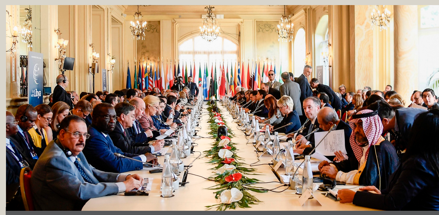
Heads of state, ministers, and special envoys attend an international conference on Libya at Villa Igiea in Palermo, Italy on November 13, 2018.

There has been little visible progress on any ofthis since the May 29, 2018 Paris agreement. A conference hosted by Italy in Palermo on November 12, 2018 was supposed to ratify the commitments made in Paris, but ended