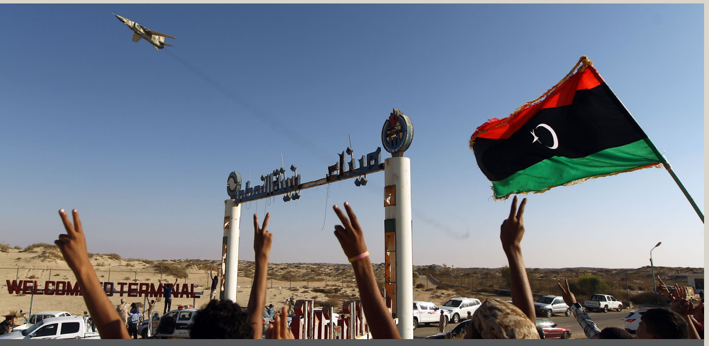
People gesture and wave a Libyan flag as a fighter jet flies by the Zueitina oil terminal on September 14, 2016

UN mediation resulted in the oil returning to NOC control. Libya's unified oil production and sales system has been a central factor in keeping the country from splitting apart, and any effort to grab it threatens to break civil accord more broadly.