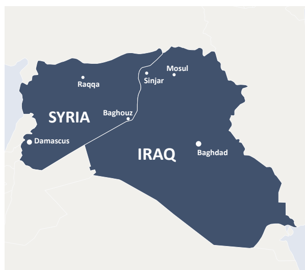
Figure 1: Map of Iraq and Syria

These obstacles to securing reliable evidence impede efforts to ensure full accountability for the crimes committed, result in sentences that do not fully reflect the gravity of conduct, and are one factor influencing some states' reluctance to actively repatriate their nationals from Al-Hol and other camps in northern Syria.