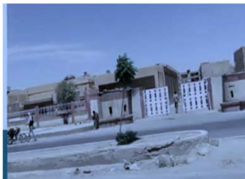
Nasr headquarters used by the IRGC in Deir ez-Zor (Ayn al-Furat, October 5, 2023)

► According to a report by the Syrian news channel Ayn al-Furat (October 5, 2023), the IRGC and Iran's allies in the Syrian regime are preventing the promotion of projects to rehabilitate neighborhoods destroyed by the civil war in Deir ez-Zor in eastern Syria to maintain their control over the area and use houses in those neighborhoods as weapons depots and military headquarters. According to the report, the Nasr headquarters, located near the College of Education building on Port Said Street, is used as the central command headquarters of the Revolutionary Guards and pro-Iranian militias in Deir ez-Zor. The headquarters was established in early 2023 on the instruction of Hajj Kamil, the IRGC Commander in eastern Syria. It includes several headquarters located between civilian houses to prevent airstrikes. One headquarters is used by Hajj Kamil himself, a second headquarters adjacent to it serves the IRGC's support and supply officer, a third headquarters serves the Finance Bureau and the Legal Bureau, and a fourth one serves Hezbollah and the joint bureau of Hezbollah and the Revolutionary Guards.