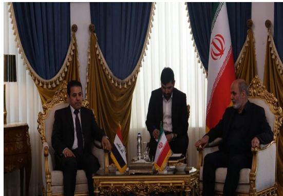
The Iraqi national security advisor meets with the secretary of Iran's Supreme National Security Council (Fars, October 1, 2023)

northern Iraq from the border between the two countries, in accordance with Iran's demand to disarm these groups. On October 1, 2023, Al-Araji met with the secretary of the Supreme National Security Council, Ali-Akbar Ahmadian, to discuss bilateral issues and the full implementation of the security agreement. Ahmadian stressed that the agreement must be implemented accurately and fully and pointed out the need to promote relations between the two countries, including in the economic sphere. Al-Araji reiterated his country's commitment to implementing the security agreement with Iran and expanding ties between the countries (Fars, October 1, 2023).