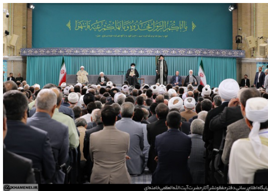
The speech of the Iranian Supreme Leader on October 3, 2023