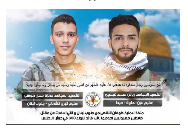
Two PIJ operatives killed in the clash in northern Israel (Website of the PIJ's military-terrorist wing, October 9, 2023)