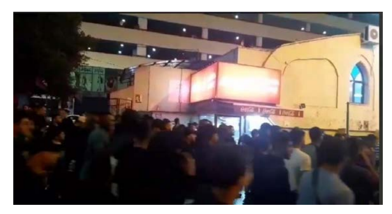
The procession in Nablus (Safa, October 9, 2023)

In Jenin, the Jenin refugee camp, and the villages of Ya'bad and Araba south of the city, demonstrations were held in support of the Gaza Strip at the call of the national and Islamic factions (Wafa, October 9, 2023).