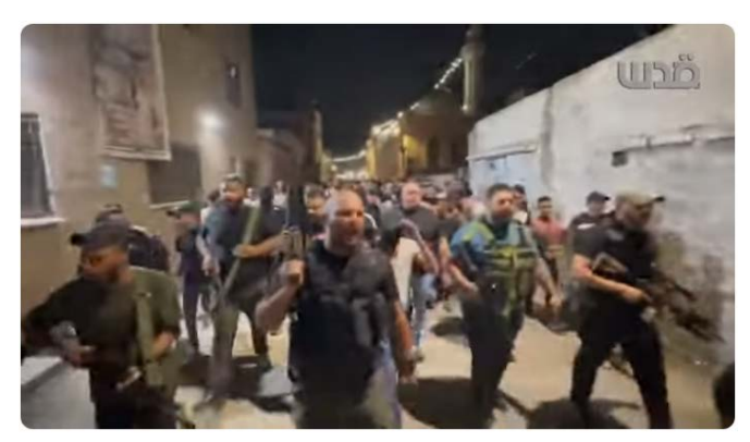
Demonstration in support of the Gaza Strip in Jenin (QudsN YouTube channel, October 9, 2023) Palestinian Authority