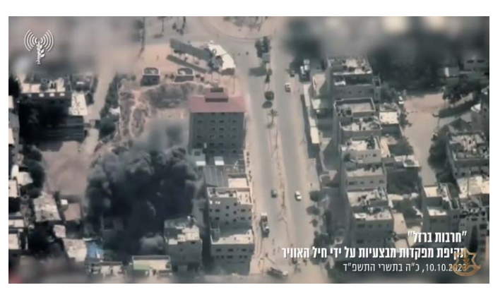
An attack on operational headquarters used by Hamas and the PIJ (IDF website, October 10, 2023)