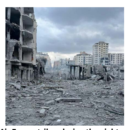
Right: The al-Rimal neighborhood in Gaza City after Israeli Air Force strikes during the night (Shehab Twitter account, October 10, 2023). Left: The aftermath of an attack on the building of the Palestinian telecommunications company PALTEL in Gaza City (Twitter account of photojournalist Hassan Aslih, October 10, 2023)