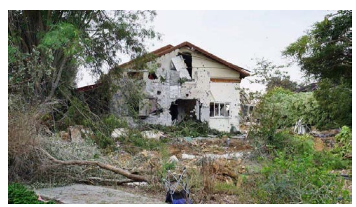
Photos from the settlements surrounding Gaza after the terrorist attack by Hamas