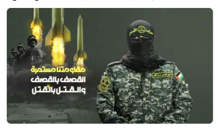
Abu Hamza. The Arabic on the screen reads, "Our resistance continues; a bomb for a bomb and a kill for a kill (al-Mayadeen TV Twitter account, October 9, 2023)

Abu Hamza, the spokesman for the PIJ's military-terrorist wing , published a video message warning that if Israel cared about the lives of the soldiers, officers and "settlers" held by the PIJ, it had to immediately stop attacking homes and killing "innocent people." If not, he threatened, they would suffer the same fate as Ron Arad more than forty years ago¹ (PIJ military-terrorist wing Telegram channel, October 10, 2023).