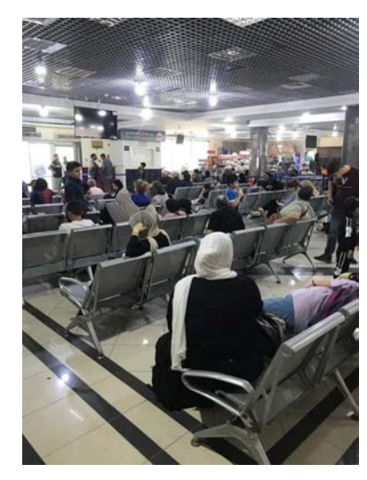
Activity at the Rafah Crossing

Following the IDF spokesman's call for citizens living in Gaza to flee to Egypt to escape IDF attacks in the Gaza Strip, "senior Egyptian sources" warned against pushing Palestinians towards the border with Egypt and calling for a mass exodus from the Gaza Strip. According to the "sources," the purpose of Israel's "dangerous calls" was to empty the Strip of its inhabitants and eliminate the Palestinian issue, and they emphasized that "Egyptian sovereignty is not something to be toyed with." One of the "senior sources" claimed Israel had the responsibility of creating humanitarian crossings to transfer aid to the residents of the Gaza Strip (al-Qahara Network, October 10, 2023).