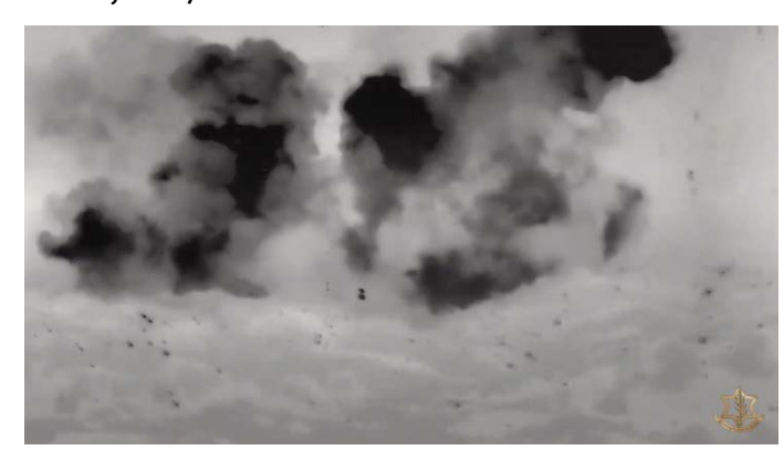
Right: Attack on a terrorist squad in the Zikim area. Left: Attack on terrorist targets in the Gaza Strip (IDF spokesman's website, October 10, 2023)