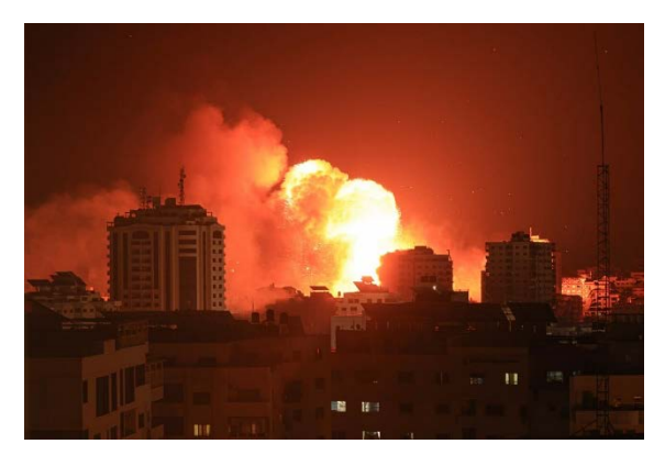
Right: Israeli Air Force night strikes in Gaza City (Twitter account of photojournalist Hassan Aslih, October 9, 2023). Left: Attack on a target in the northern Gaza Strip (Shehab Twitter account, October 9, 2023)

Abu Hamza, the spokesman for the PIJ's military-terrorist wing , published a video message warning that if Israel cared about the lives of the soldiers, officers and "settlers" held by the PIJ, it had to immediately stop attacking homes and killing "innocent people." If not, he threatened, they would suffer the same fate as Ron Arad more than forty years ago¹ (PIJ military-terrorist wing Telegram channel, October 10, 2023).