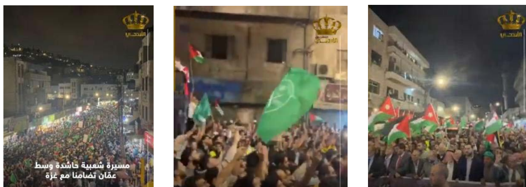
The mass rally in Amman: Palestinian flags next to Hamas flags (Jordan’s official TV channel, October 10, 2023)

▶ On October 10, 2023, a mass rally was held in Amman in support of Gaza. The rally included calls for support for Gaza and Hamas, including “Continue, Hamas,” “In spirit and fire we will redeem you, al-Aqsa,” and calls for the "liberation of Palestine" through jihad. Hamas and Palestinian flags were waved (Jordan’s official TV channel, October 10, 2023).