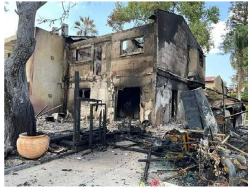
Buildings in Kibbutz Be'eri hit by rockets from Gaza