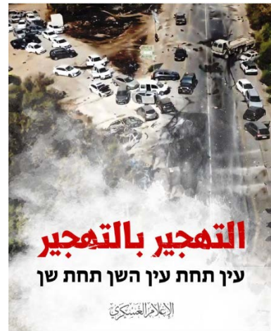
Right: An Izz al-Din Qassam Brigades poster. The Arabic reads, "Expulsion in return for expulsion." The Hebrew reads, "An eye for an eye and a tooth for a tooth" (Izz al-Din Qassam Brigades Telegram channel, October 10, 2023). Left: From a video of rockets fired at Ashqelon (Monitoring News Twitter account, October 10, 2023)