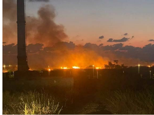
Right: Fires in Ashqelon caused by a rocket hit. Left: The results of rocket fire targeting Ashqelon