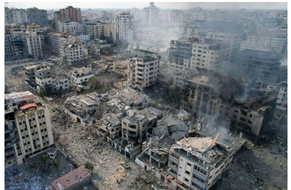
Neighborhoods in Gaza after the air strikes (QudsN Twitter account, October 10, 2023)