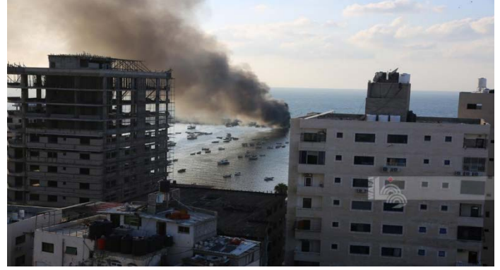
The Israeli Navy attacks fishing boats in the Gaza port (Wafa, October 10, 11, 2023)