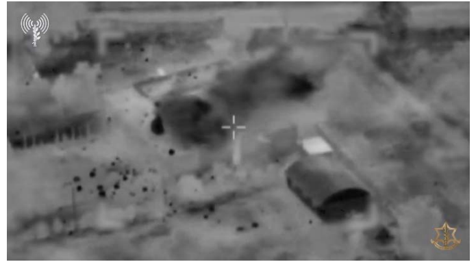
Right: Israeli Air Force attack on a Hamas site for launching high-precision rockets. Left: The destruction of an aircraft detection system (IDF spokesman's website, October 11, 2023)