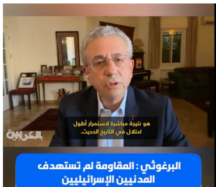
Mustafa al-Barghouti interviewed by CNN in English (QudsN Twitter account, October 10, 2023)

▶ Similar statements were made by Mustafa al-Barghouti, a Palestinian leftist , who was interviewed from Ramallah by CNN in English. After claiming he was not identified with the PA or Hamas, he went on to claim that Hamas did not attack civilians, only soldiers and military facilities and that most events in the south were a "natural reaction" to the "crimes of the occupation and settlers" (QudsN Twitter account, October 10, 2023).