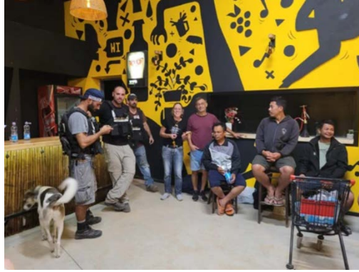
Besieged civilians who were rescued