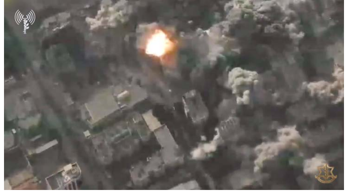
Right: The attack on the Islamic University, a center of Hamas terrorist activity (IDF spokesman's website, October 11, 2023). Left: The ruins of the Islamic University (QudsN Twitter account, October 10, 2023)