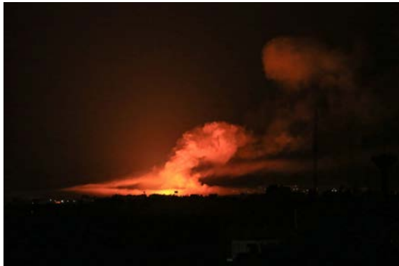
Right: Attacks on Khan Yunis (Shehab Twitter account, October 11, 2023). Left: The attack on the al-Doha building in Rafah where a National Bank branch, a Hamas post office and other communications offices were located (Shehab Twitter account, October 11, 2023)