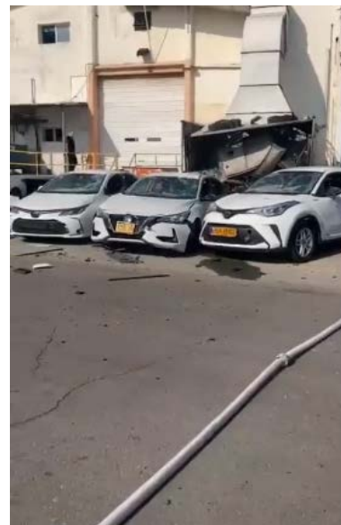
Right: Rocket hit in Rishon LeZion. Left: Damage from a rocket hit in a southern Israeli city