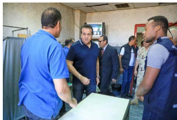
Right: The Egyptian minister of health visits the Egyptian side of the Rafah Crossing. Left: Preparations for erecting a field hospital on the Egyptian side of the Rafah Crossing (Twitter account of photojournalist Hassan Aslih, October 16, 2023)

► Al-Ghad TV reported that before dawn the trucks bringing humanitarian aid trucks began to move from the El-Arish region towards the Egyptian side of the Rafah Crossing. In the afternoon, the channel reported the trucks were waiting at the Rafah Crossing (al-Ghad TV, October 17, 2023). The spokesman for the crossings authority in the Gaza Strip stated they had not yet received notification of the opening of the Rafah Crossing (al-Ghad TV, October 17, 2023).