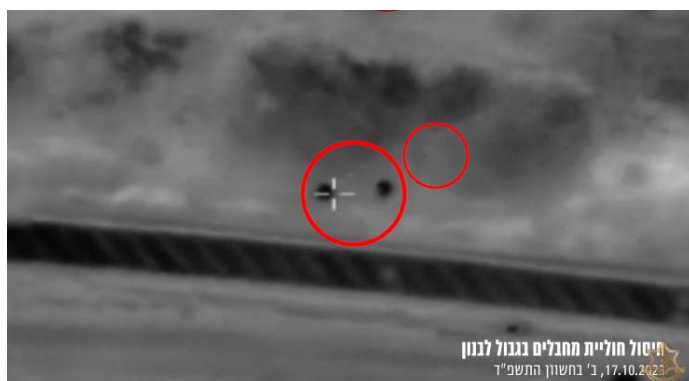
Eliminating the terrorist squad (IDF website, October 17, 2023)

► On the morning of October 17, 2023 , the IDF prevented a four-man terrorist squad from infiltrating Israel from Lebanon. IDF surveillance identified the squad approach the border fence and planted an IED. The terrorists were shot and killed (IDF spokesman, October 17, 2023).