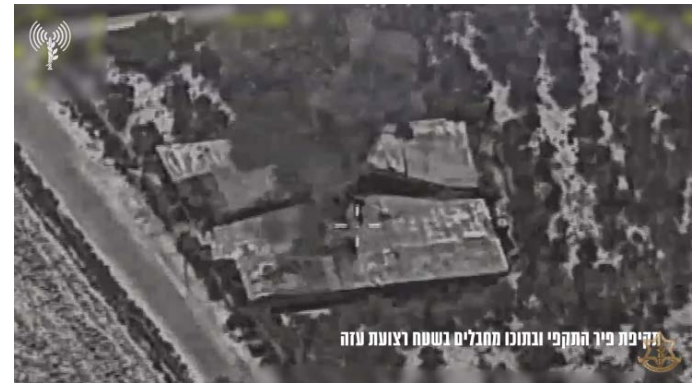
Right: Attack on the shaft of a terrorist attack tunnel. Left: Attack on the shaft of a mortar shell-launching pit