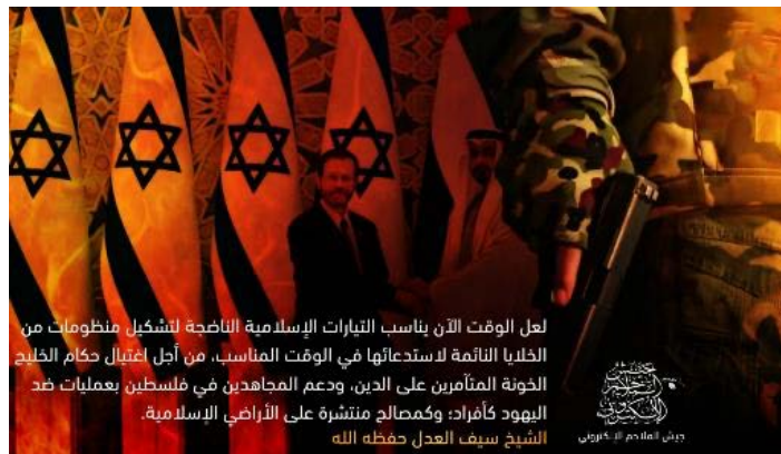
The al-Qaeda poster (Telegram, October 17, 2023)

► Jaish al-Malhem al-Khatroni, al-Qaeda's media information branch, published a poster with a quote from Seif al-Adel, the leader of al-Qaeda, calling on the members of the organization and its supporters to establish sleeper cells to kill the leaders of the "traitorous" Gulf States and help the "jihad fighters" in "Palestine." He also called for attacks on Jews and their property in Islamic countries as an expression of "support for Palestine." The quote appears on the background of a photo of Muhammad bin Zayed, UAE president, meeting with Yitzhak Herzog, president of Israel (Telegram, October 17, 2023). Al-Adel is apparently in Iran.