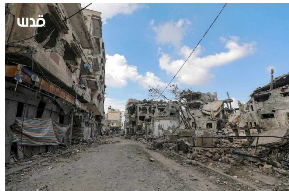
The aftermath of attacks in Gaza City (QudsN Twitter account, October 17, 2023)