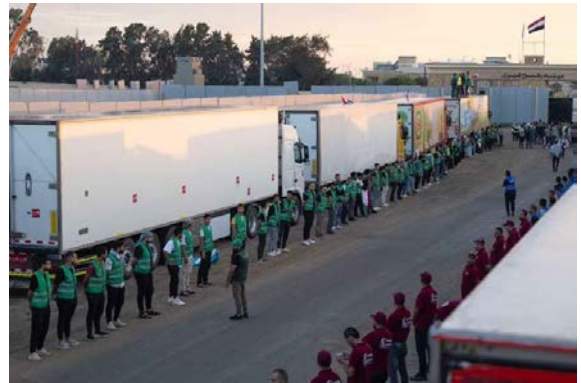
The convoy of trucks bringing humanitarian aid waits on the Egyptian side of the Rafah Crossing