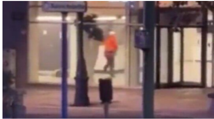
The terrorist during the attack (Telegram, October 16, 2023)

► On October 16, 2023, an armed man opened fire near the stadium in Brussels about half an hour before the soccer game between Belgium and Sweden began. He shouted "Allahu Akbar," declared he belonged to ISIS and fled. Two fans wearing Sweden football shirts were killed. The terrorist was pursued, shot and killed. He was identified as Abd al-Salam Jilani of Fateh al-Asoud, 45 years old of Tunisian origin. The Belgian government declared a state of national emergency (Reuters and La Monde, October 16-17, 2023).