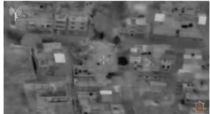
Israeli Air Force strikes in the Gaza Strip (IDF spokesman's website, October 17, 2023)