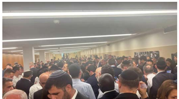
Right: Knesset members leave the Knesset hall to take shelter during the rocket attack. Left: Israeli Air Force attack on a launch squad