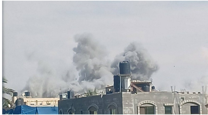
Right: Attack in west Gaza City (QudsN Twitter account, October 16, 2023). Left: A satellite image showing the destruction in Beit Hanoun in the northern Gaza Strip (al-Ghad TV, October 16, 2023)