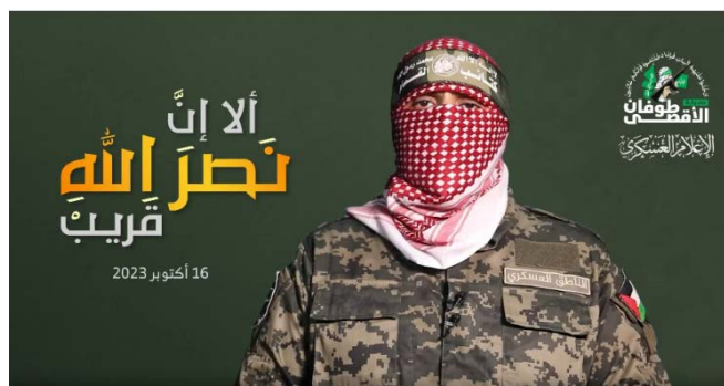
Abu Obeida gives a speech. The Arabic reads, "Indeed the victory of Allah's people is near and approaching" (Qur'an Sura 2, verse 214)