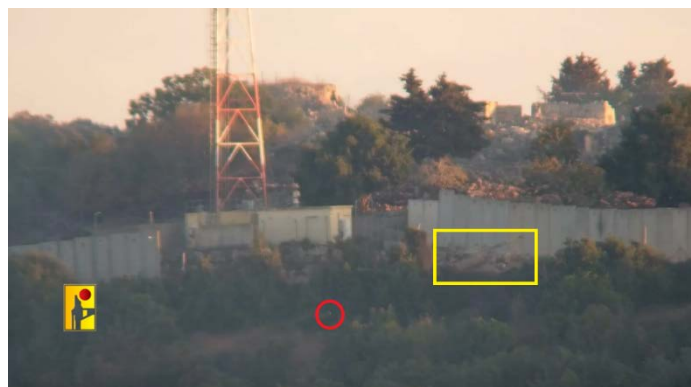
Photos from Hezbollah's video documenting the anti-tank fire. Right: Merkava tank (yellow) at Tabak post before Hezbollah's anti-tank missile hit (red). Left: The missile hits the tank

► In response, IDF forces fired artillery at the sources of the attack. The IDF later attacked Hezbollah military-terrorist targets in Lebanese territory (IDF spokesman, October 17, 2023).