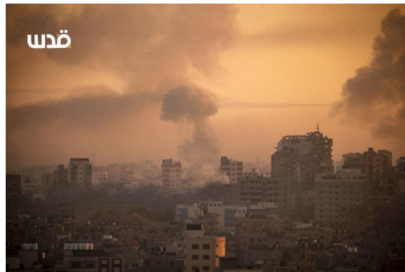
Right: Israeli Air Force strikes in Gaza. Left: Israeli Air Force attack on western al-Bureij in the central Gaza Strip