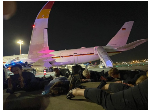
Right: German Chancellor Olaf Schulz and his entourage prostrate on the ground at Ben-Gurion International Airport following sirens heralding rocket launches from Gaza (QudsN Twitter account, October 17, 2023). Left: A fire in Ashqelon caused by a rocket from Gaza (QudsN Twitter account, October 17, 2023)