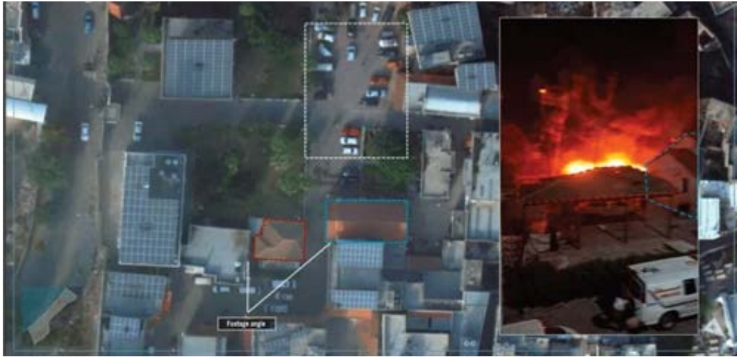
Infrared image of the parking lot. The main impact points and some damage to roofs are visible. There are no craters and none of the walls of the surrounding buildings has collapsed (IDF spokesman, October 18, 2023)

hospital in Gaza. One of them said the debris was from rockets manufactured locally, and "not [like those made by] Israel, adding that "as soon as it was fired, something went wrong and it fell [near the hospital]" (IDF spokesman, October 18, 2023).