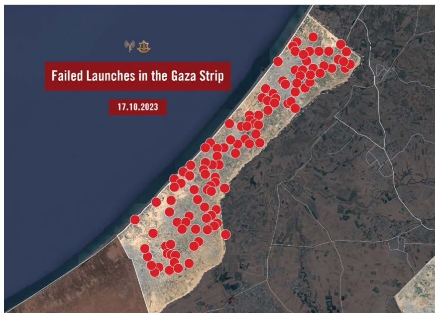
Failed rocket launches that fell inside the Gaza Strip (IDF spokesman, October 18, 2023)