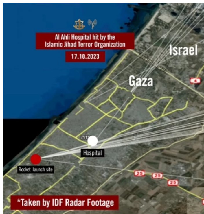
The trajectory of the rocket launch (IDF spokesman, October 18, 2023)

► However, a comprehensive investigation conducted by the IDF, which included cross-referencing information from all operational and intelligence systems, made it clear that the IDF had not attacked the hospital in Gaza, which rather had been damaged by a rocket launched by the Palestinian Islamic Jihad (PIJ) which fell in the Gaza Strip, one of a barrage of rockets launched from a cemetery near the area hospital.