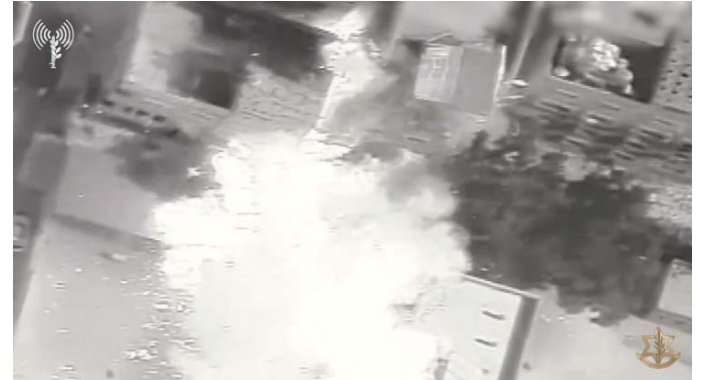
Recent Israeli Air Force strikes in the Gaza Strip (IDF website, October 18, 2023)