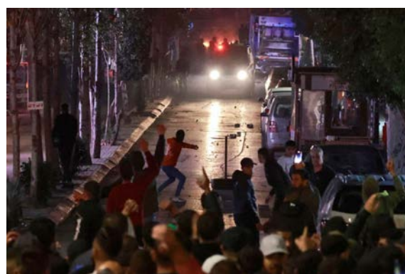
Right: A protest march in Bethlehem. Left: Demonstration in central Ramallah and clashes with Palestinian security forces (QudsN Twitter account, October 17, 2023).