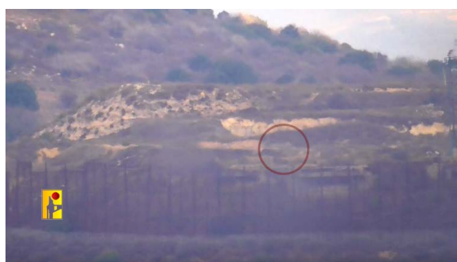
Photos from a Hezbollah video documenting the anti-tank fire at Zar'it