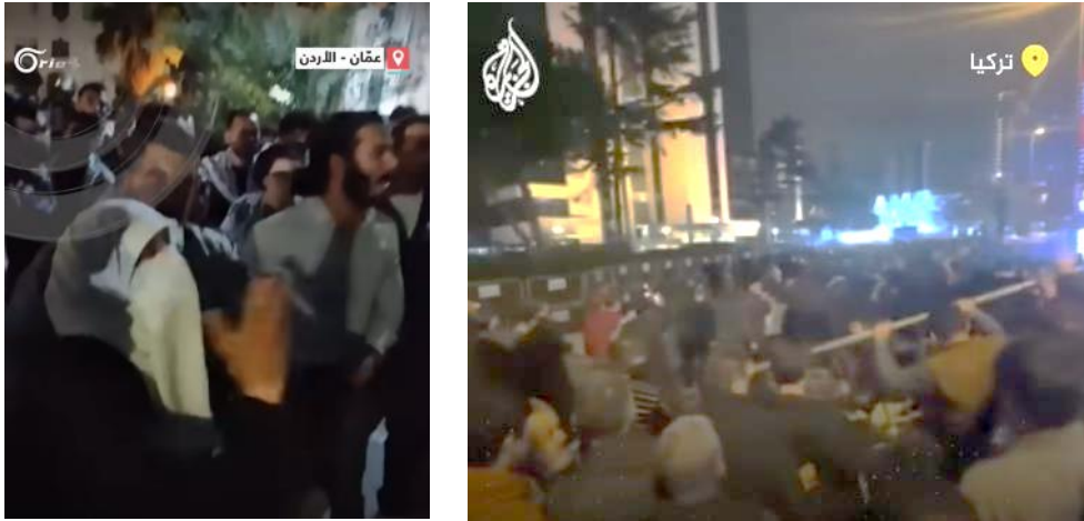
Right: Demonstration in front of the Israeli consulate in Turkey, and left, in front of the Israeli embassy in Jordan

Strip were also held in Baghdad, Rabat (Morocco), Taiz (Yemen) and Nouakchott (Mauritania) (al-Jazeera, October 17, 2023).