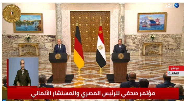
El-Sisi (right) and the German chancellor hold a joint press conference (al-Ghad, October 17, 2023)

► Egyptian President Abdel Fattah el-Sisi met with German Chancellor Olaf Scholz . El-Sisi warned that "the deteriorating situation in Gaza could spin of control." He expressed concern about the humanitarian situation in the Gaza Strip, stressing that Egypt had not closed the Rafah crossing but rather Israeli attacks had prevented it from opening. He told the German chancellor that Egypt refused to eliminate the Palestinian problem by means of military tools (al-Ghad, October 18, 2023).