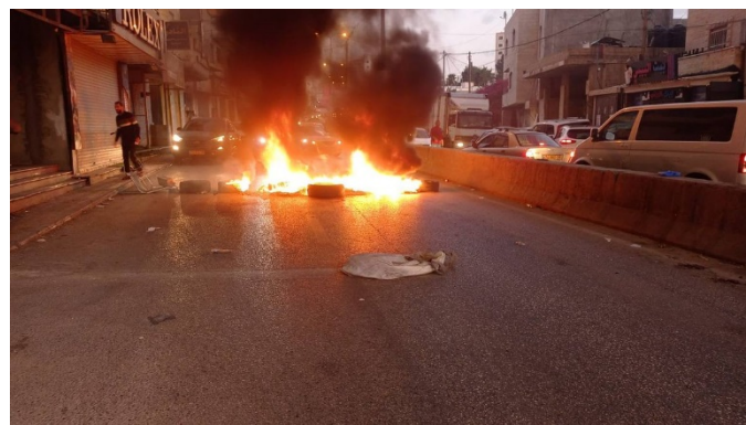
Right: Clashes with Israeli security forces near the Qalandia Crossing (QudsN Twitter account, October 18, 2023). Left: General strike in Nablus (QudsN Twitter account, October 18, 2023)