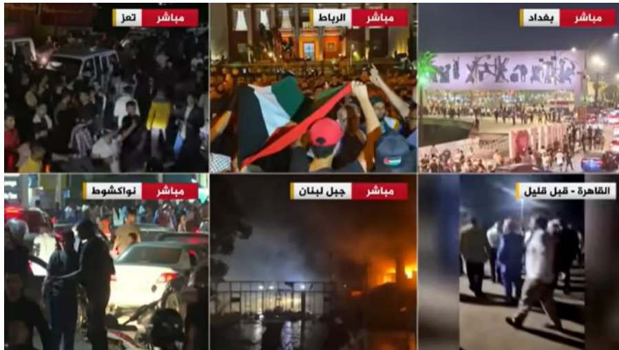
Demonstrations in Yemen, Morocco, Iraq, Mauritania and Egypt (al-Jazeera, October 17, 2023)