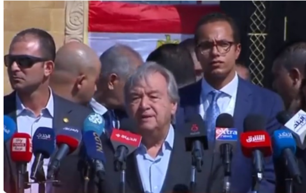
UN Secretary General Guterres holds a press conference on the Egyptian side of the Rafah crossing

said there should be fewer conditions regarding the delivery of aid (al-Jazeera, October 20, 2023).