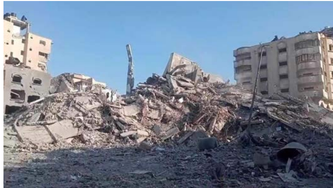
Attack on the Andalus Building