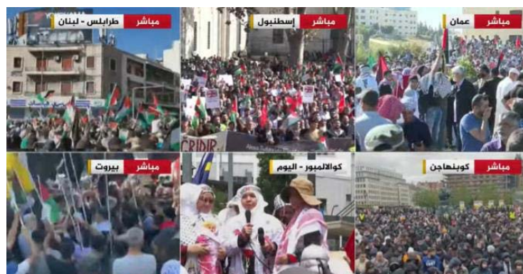
Right: Rallies in support of the Palestinians (clockwise) in Amman, Istanbul, Tripoli in Lebanon, Copenhagen, Kuala Lumpur (Indonesia) and Beirut (al-Jazeera, October 20, 2023). Left: Flotilla off the coast of Sidon (al-Jazeera, October 20, 2023)