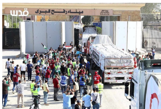
Right: The trucks enter the Rafah Crossing (QudsN Twitter account, October 21, 2023). Left: Unloading trucks and loading the equipment onto Palestinian trucks (Telegram channel of journalist Hassan Aslih, October 21, 2023)

► In a speech given at the Rafah Crossing, UN Secretary General António Guterres claimed the residents of the Gaza Strip suffered from a lack of water, food and fuel, and the transfer of humanitarian aid from Egypt had to be accelerated and the number of trucks increased. He called for an unconditional humanitarian ceasefire to ensure aid reached the Gaza Strip, and