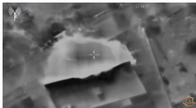
Right: The attack on the terrorist squad which launched an anti-tank missile at the Margaliof area. Left: Attack on an observation post