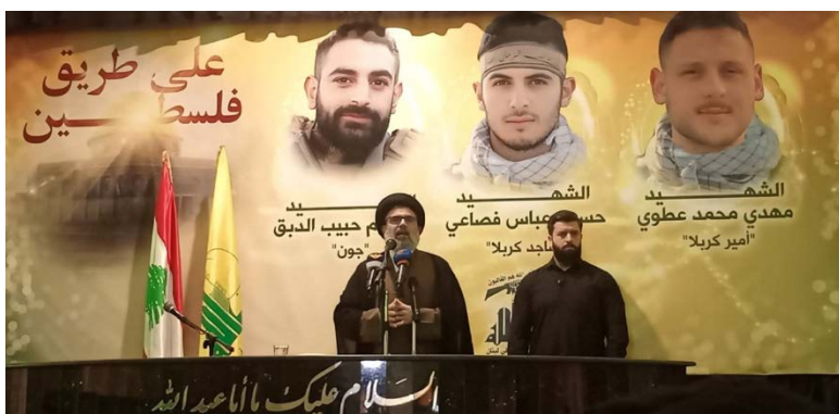
Hashem Safi al-Din at a memorial ceremony in the town of Kounine, south Lebanon

► Hashem Safi al-Din, chairman of Hezbollah's Executive Council, said the regional "resistance" fighters were armed and prepared to fight with their missiles and weapons to the end on any front.