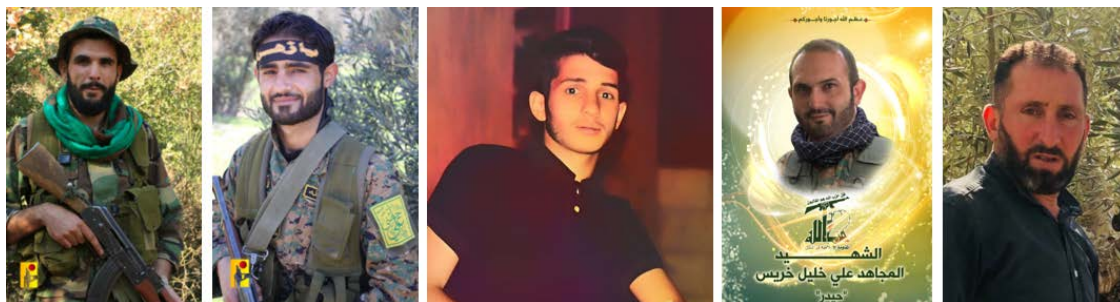
Five of the six Hezbollah operatives killed on October 21, 2023 (Hezbollah combat information Telegram channel, October 21, 2023)