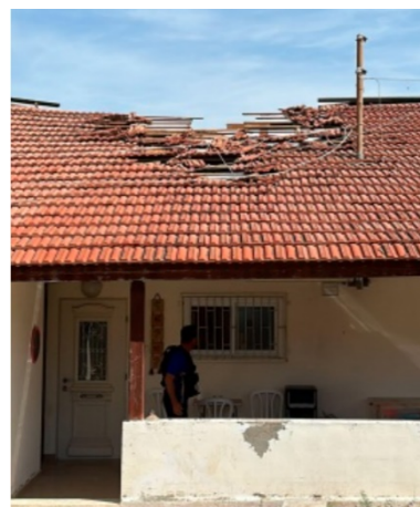
Right: A rocket hits a house in Sderot (QudsN Twitter account, October 21, 2023). Left: A rocket falls near Latrun (QudsN Twitter account, October 20, 2023)