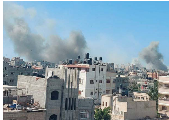
Israeli Air Force strikes in Gaza. Left: The aftermath of an attack on buildings in al-Zara'a, south of Gaza