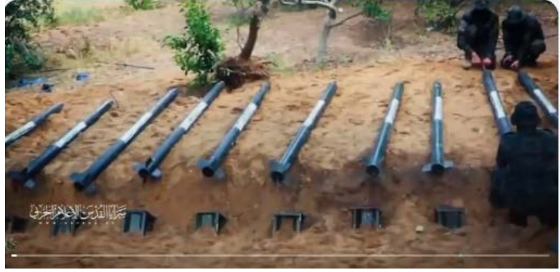
Photos from a video released by the PIJ's military-terrorist wing documenting rocket launches from launch pits