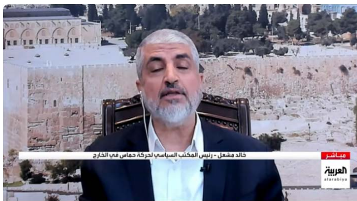
Khaled Mashal

► Senior Hamas figure Usama Hamdan held a press conference in Lebanon where he called on UNRWA and the UN to take responsibility and condemn Israel's threats about damaging UNRWA schools, which were sheltering tens of thousands of displaced persons, including children, women and the elderly. Regarding the release of the two American abductees, Hamdan confirmed they would work with all mediators to implement Hamas' decision to end the issue of the abducted civilians "under the appropriate conditions." He claimed Israel was responsible for the welfare of the abductees because of its continuing attacks on the Gaza Strip. Relating to the entry of the humanitarian aid trucks through the Rafah Crossing, he claimed it was insufficient for the needs of the "besieged Palestinian people" and the Gaza Strip's collapsing public health sector. He called for the Crossing to be permanently open for the passage of wounded from the Strip to other countries and the entry of humanitarian aid and fuel ( Hamas Telegram channel, October 21, 2023).