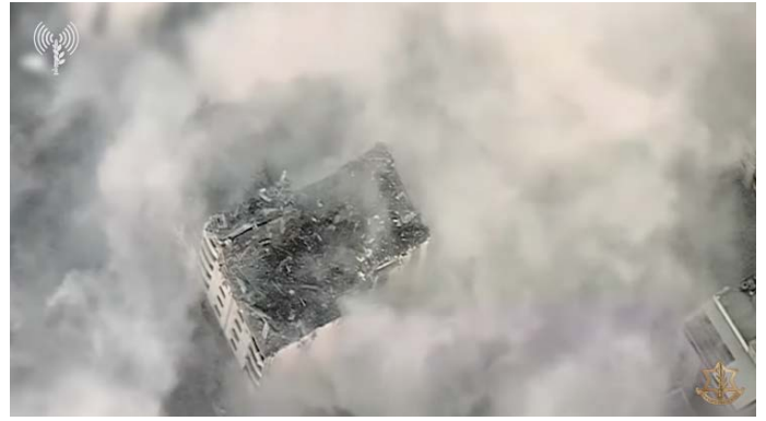
Israeli Air Force strikes in the Gaza Strip (IDF Spokesman's website, October 21, 2023)