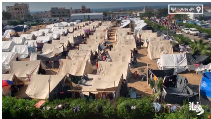
Tents erected by UNRWA in the west of Khan Yunis for the evacuees from the northern Gaza Strip (, October 19, 2023)

► The Hamas media information bureau claimed 1.4 million Gazans had left their homes, about half of them going to 127 shelters, and the rest to friends and relatives. A tent camp was also established in the al-Muasi neighborhood in Gaza City. International organizations are working in shelters to prevent outbreaks of disease and transfer aid to those in need.