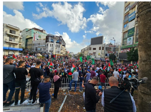
Right: A march in Ramallah (Twitter account of al-Quds TV, October 20, 2023). Left: A march in Nablus (QudsN Twitter account, October 20, 2023)