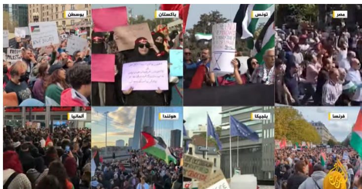
Protests in support of the Palestinians in Boston, Pakistan, Tunisia, Egypt, France (Paris), Belgium (Brussels), the Netherlands and Germany (al-Jazeera, October 22, 2023)