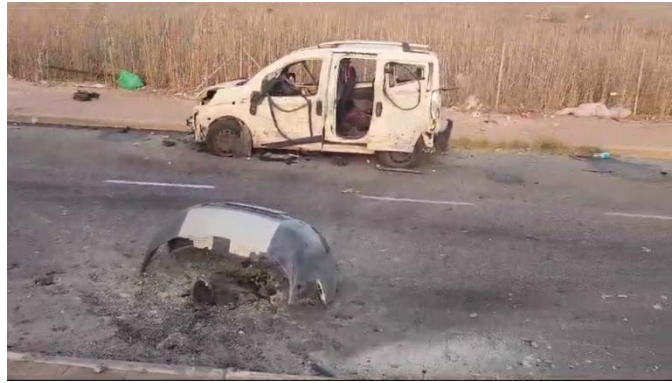
Rocket hit near vehicles in Netivot