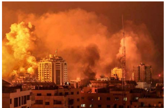
Attacks in the Gaza Strip during the night of October 22, 2023