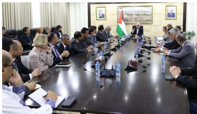
Muhammad Shtayyeh meets with foreign representatives in the PA (Wafa, October 22, 2023)

► PA Prime Minister Muhammad Shtayyeh met in Ramallah with diplomats from 25 countries. He claimed international support for "Israeli aggression" legitimized the continued killing and destruction and a united international front was needed to stop Israel's plans to "uproot residents and invade the Gaza Strip." He said that in addition to the aggression in the Gaza Strip, they were dealing with the IDF's "terrorism" in Judea and Samaria, and that to continue the "murder" of Palestinians the IDF rules for opening fire had been changed and the settlers were being encouraged to arm themselves (Wafa, October 22, 2023).