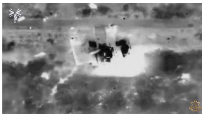
The IDF attack on a Hezbollah military facility (IDF Spokesman's website, October 23, 2023)

► IDF forces continued to attack terrorist squads in Lebanese territory planning to launch anti-tank missiles and rockets at Israel, destroying them and their weapons. During the past day, several squads planning to shoot at Matat, Har Dov, Malkia and Shlomi were eliminated. At the same time, airstrikes were carried out against Hezbollah military-terrorist, including compounds and observation posts (IDF spokesman, October 22, 23, 2023).