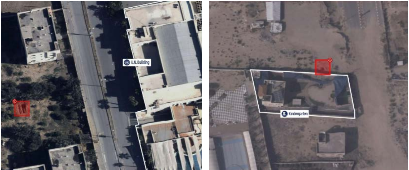
Rockets fired from within the civilian population [marked in red]. Right: A launch point near a kindergarten. Left: A launch point near a UN building (IDF spokesman, October 22, 2023)

► During the IDF activity in the Gaza Strip Palestinian terrorists continued launching rockets at Israel, but to a lesser extent than on previous days. They primarily attacked the Israeli cities, towns and villages near the Gaza Strip. One volley was launched at the Beit Shemesh area and another at Beersheba. According to IDF surveillance, the rockets were launched from kindergartens, schools and mosques, using the Gazan population as human shields.