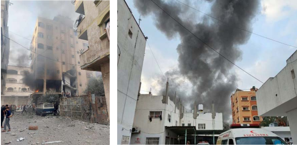
Right: Attack on a house near the Kamal Adwan hospital in Beit Lahia. Left: Attack on the Riyan Building in the Jabaliya refugee camp

► Ground activity: IDF forces, accompanied by tanks and engineering vehicles, operated in the Kissufim area on the Gaza Strip border. Their objectives were to carry out counterterrorism activities, clear the area of terrorists in preparation for a ground maneuver and attempt to collect additional information about the missing and abducted. During one activity Palestinian terrorists fired an anti-tank missile at an IDF tank and engineering vehicle, killing an IDF soldier and wounding three (IDF spokesman, October 22, 2023). On the night of October 22, 2023, infantry forces attacked several targets, among them terrorist and anti-tank squads (IDF spokesman, October 23, 2023).