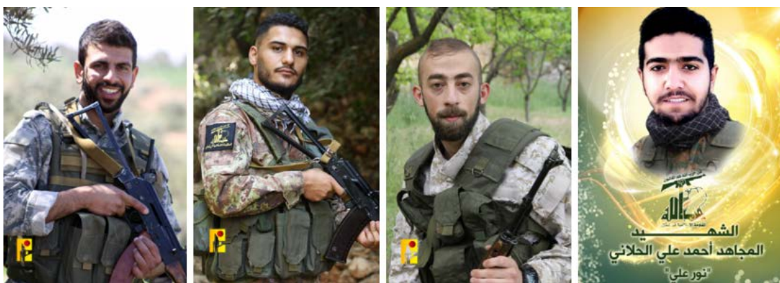
Hezbollah operatives killed on October 22, 2023