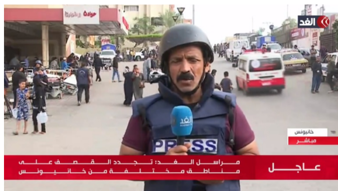
The al-Ghad TV correspondent reports from Nasser Hospital in Khan Yunis (al-Ghad TV, October 23, 2023)