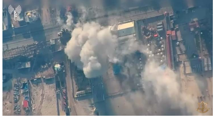
Attacks on Hamas operational facilities