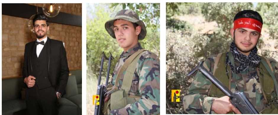
Hezbollah operatives killed on October 22, 2023