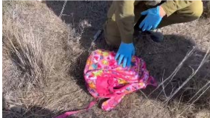
The booby-trapped school bag

explosives prepared for remote detonation (IDF spokesman, October 22, 2023). A terrorist who had been in Israeli territory since the attack on October 7, 2023 was captured.