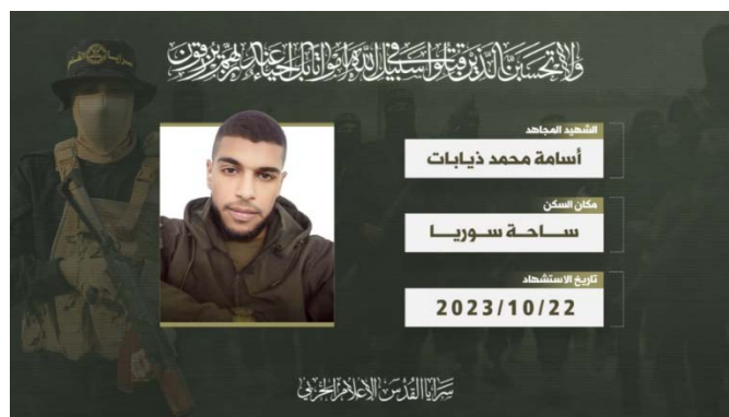
Jerusalem Brigades operative killed in south Lebanon (Jerusalem Brigades Telegram channel, October 22, 2023)