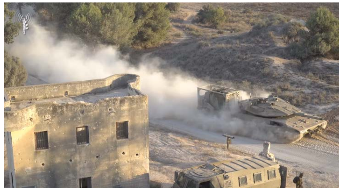
IDF tank in Gaza (IDF website, October 30, 2023)

► Aerial activity: Israeli Air Force aircraft continued intense attacks on targets throughout Gaza, including Hamas anti-tank and rocket launching positions, tunnel shafts and military compounds, while also assisting the ground forces (IDF spokesman, October 31, 2023).