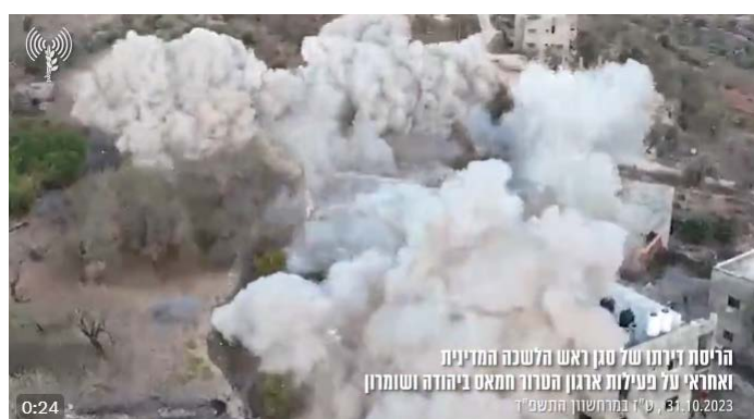
The demolition of Saleh al-'Arouri's house