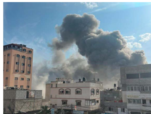
Right: Israeli Air Force attacks on Nuseirat in the central Gaza Strip (QudsN Twitter account, October 30, 2023). Left: Nuseirat residents visit the ruins after the Israeli Air Force attack (Wafa YouTube channel, October 31, 2023).