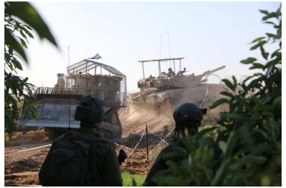
The IDF ground maneuver in the Gaza Strip