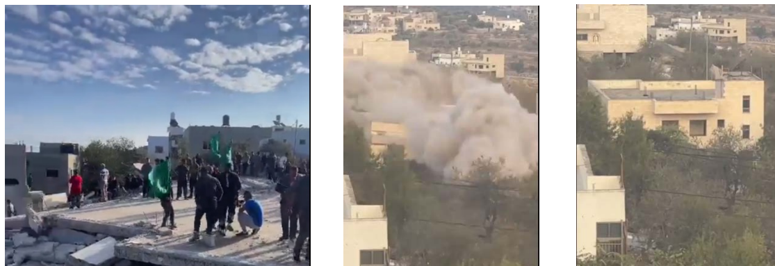
(Right to left): Saleh al-'Arouri's house just before it was blown up; the house being blown up; local residents with green Hamas flags come to show solidarity and visit the ruins of the house (QudsN Twitter account, October 31, 2023)