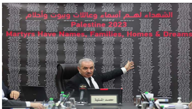
Muhammad Shtayeh, at the start of the cabinet meeting, points to the names of those killed in Gaza. The inscription in Arabic and English reads, Palestine 2023, Martyrs Have Names, Families, Homes & Dreams (Wafa, October 30, 2023)

►The PA government approved a budget and an emergency plan for the PA ministry of health, which is also responsible for the Gaza Strip. According to the plan, the ministry will be able to purchase medical equipment and medicine for hospitals in the Gaza Strip for the next three months (ministry of health in Ramallah Facebook page, October 30, 2023). The names of all the Palestinians killed were displayed on the wall at the weekly cabinet meeting (Wafa, October 30, 2023).