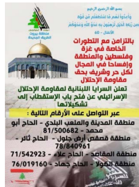
The Lebanese companies' recruitment poster (the Twitter account of "the national campaign to cope with turning Lebanon into Syria," October 31, 2023)

► A recruitment ad was posted on social media, attributed to the "organization of Lebanese companies for resistance to the Israeli occupation," which is affiliated with Hezbollah. The ad stated that during the "unusual" developments in the Gaza Strip, Israel and the region, the organization had began recruiting fighters. The ad gave the locations of four areas in the capital and the names and phone numbers of the people responsible for recruitment in each. Outrage was expressed on Twitter, which shared the recruitment ad, and the Lebanese security agencies were called on to stop the activity (the Twitter account of "the national campaign to cope with turning Lebanon into Syria," October 31, 2023).