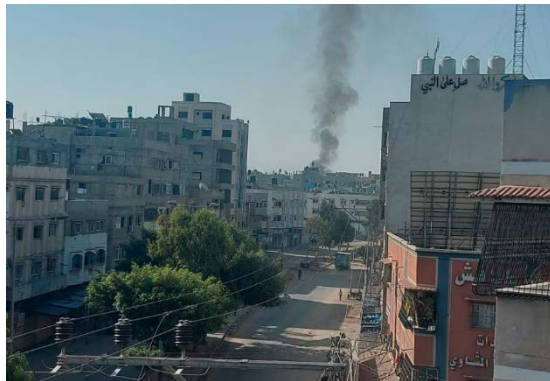
Right: Israeli Air Force strikes in Gaza (Shehab Twitter account, October 31, 2023). Left: Attacks in the Tel al-Hawa neighborhood in Gaza City (QudsN Twitter account, October 31, 2023)