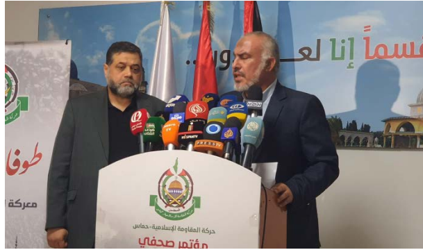
The press conference in Beirut (Lebanese News Agency, October 30, 2023)