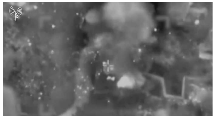
The IDF Hezbollah military-terrorist facilities (IDF website, October 30, 2023)