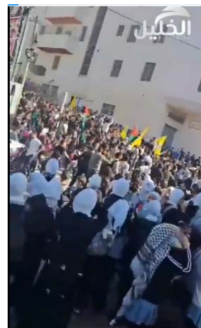
Right: A student march in Bani Na'im (QudsN Twitter account, October 31, 2023). Center: A student march in the town of Kafr Ra'i in the Jenin district (Shehab Twitter account, October 31, 2023). Left: A student march in Ramallah (QudsN Twitter account, October 31, 2023)