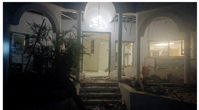
A direct hit by a rocket from Gaza on a house near the town of Elad