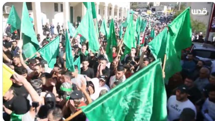
Right: A march in Hebron (QudsN Twitter account, November 3, 2023). Left: A march in Nablus (Paldf Twitter account, November 3, 2023)