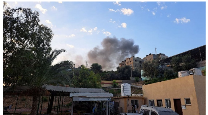
Right: The Israeli Air Force morning attack on Tel al-Za'atar in Jabaliya (Shehab Twitter account, November 5, 2023). Left: Israeli Air Force night strikes in Gaza (Wafa YouTube channel, November 5, 2023)

► Naval activity: To support the IDF forces operating on land, an Israeli Navy missile ship attacked booby-trapped buildings and Hamas observation posts (IDF spokesman, November 2, 2023).