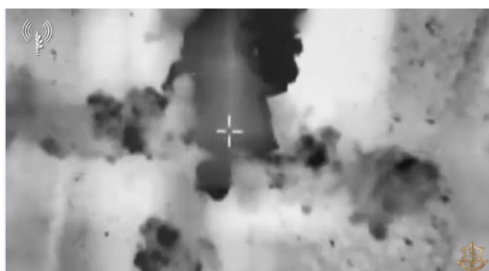
Right: IDF attack on a terrorist squad about to launch anti-tank missiles. Left: IDF attack on Hezbollah military facilities