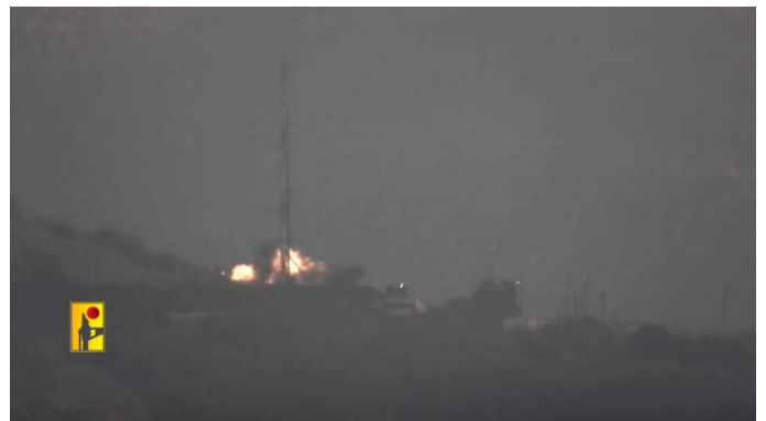
Right: UAV attack on the Nahal Sion post. Left: Attack on the Pereg post (Telegram channel of Hezbollah's combat information unit, November 2, 2023)