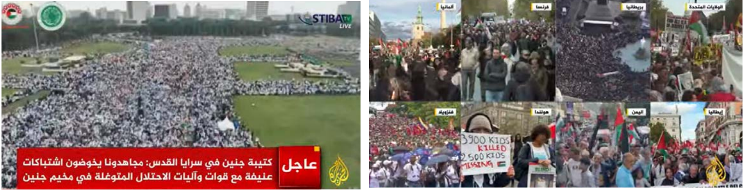
Right: Demonstrations in support of the Palestinians (top row from right to left) in the United States, Britain, France and Germany. Bottom line from right to left: Italy, Yemen, the Netherlands and Venezuela. Left: Demonstration held in Jakarta, the capital of Indonesia