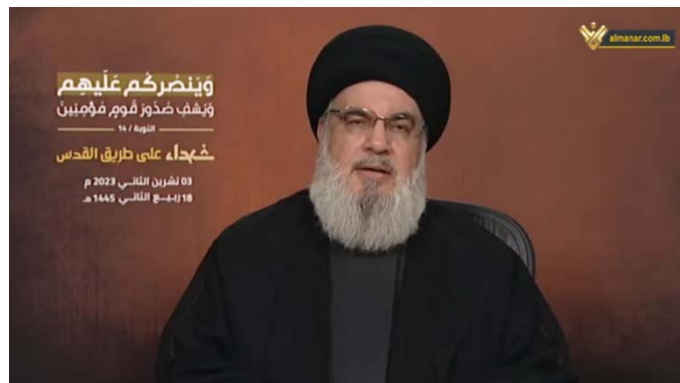
Right: Hassan Nasrallah gives his speech. Left: A crowd gathered in the Dahia, the Shi'ite stronghold in the south of Beirut, to listen to the speech