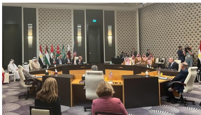
The meeting of the foreign ministers in Amman (Wafa, November 4, 2023)

► Hussein al-Sheikh, head of the Palestinian delegation and secretary of the PLO's Executive Committee, gave a detailed explanation of the Palestinian position in light of the war in Gaza and demanded an immediate ceasefire. He stressed the need to open permanent humanitarian routes to provide medical equipment, water, food, and electricity to the Gaza Strip. He also stressed the importance of stopping attacks by Jewish settlers in Judea, Samaria and east Jerusalem (Wafa, November 4, 2023).