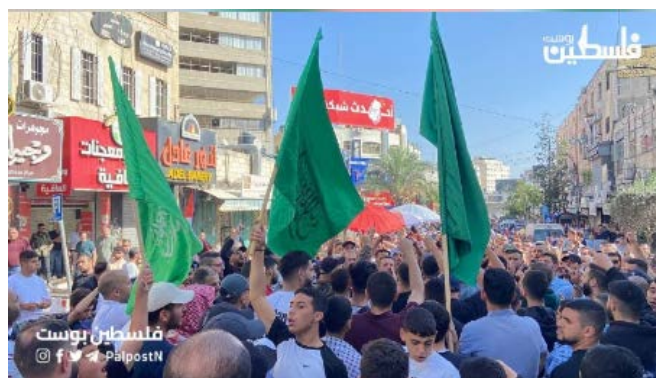
Right: A march in Ramallah (Palestine Post Telegram channel, November 3, 2023). Left: Students demonstrate in front of the education department in Ramallah district (Paldf Twitter account, November 5, 2023)

► The PIJ leadership in Judea and Samaria said that what was happening in Judea and Samaria paved the road for a broad war that would end with the uprooting of the population of the West Bank in accordance with the plan and agenda of the Israeli extreme right, and that Israel was isolating the West Bank in light of its war in the Gaza Strip. The announcement stressed that all national forces had to be mobilized to deal with the plan, calling on everyone to bear responsibility at the national level, disregarding any political consideration that was not in the interests of the Palestinians (Telegram channel of the PIJ's information bureau, November 3, 2023).