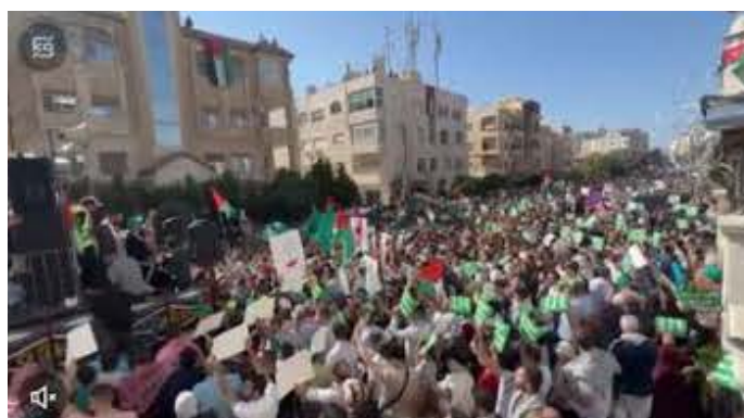
The mass demonstration in front of the Israeli embassy in Amman (Rida Yassin Twitter account, November 3, 2023)

► On November 3, 2023, a demonstration was held in front of the Israeli embassy in Amman where calls were heard in support of Hamas and to revoke Jordan's peace agreement with Israel (Rida Yassin Twitter account, November 3, 2023).