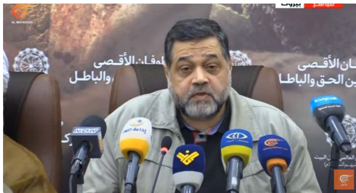
Usama Hamdan speaks at the conference (al-Mayadeen TV Telegram channel, November 4, 2023)

few days ago and met with the leader of Iran, Ali Khamenei (al-Mayadeen TV Telegram channel, November 4, 2023).