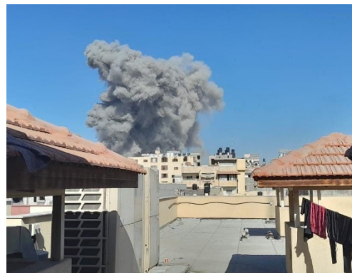
Israeli Air Force strikes in the Gaza Strip (QudsN Twitter account, November 4, 2023)