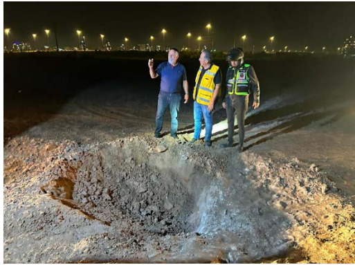
A crater caused by a rocket in the area east of Tel Aviv and west of Jerusalem (no source, November 4, 2023)