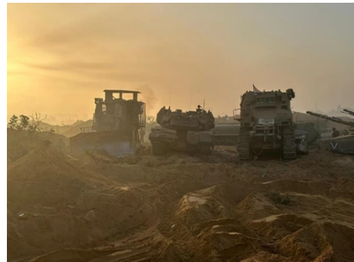
IDF forces in the Gaza Strip