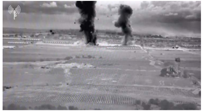
Destruction of Hamas tunnel shafts in the Gaza Strip (IDF website, November 3, 2023)