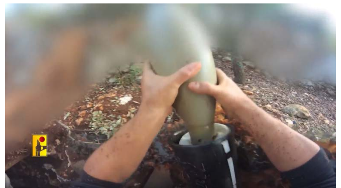
Launching mortar shells at the Wadi Shomera area (Telegram channel of Hezbollah's combat information unit, November 2, 2023)