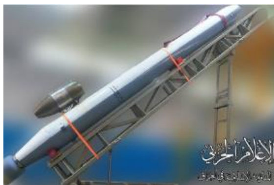
Photo of a rocket attached to the threat