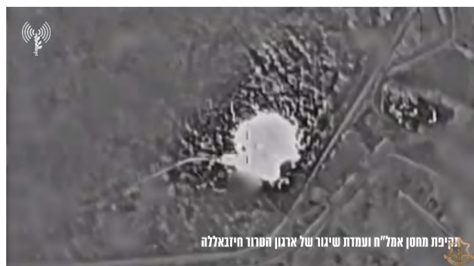
Right: Attack on a Hezbollah terrorist facility. Left: Attack on a munitions warehouse and launch site