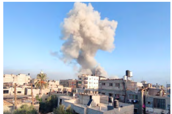
Right: Israeli Air Force attack on Khan Yunis (QudsN X [Twitter] account, November 7, 2023). Left: Air Force attack near the Indonesian Hospital in the northern Gaza Strip (QudsN X [Twitter] account, November 7, 2023)