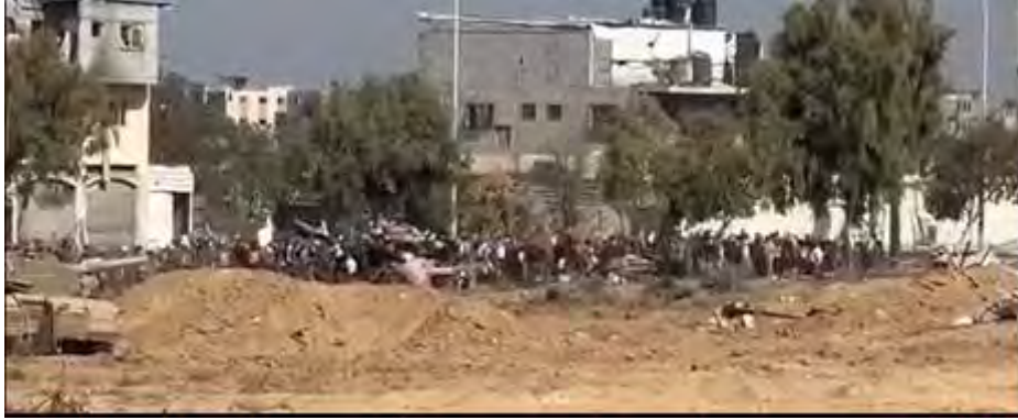
Gazans evacuating to the south along the Salah al-Din road (IDF spokesman in Arabic, November 7, 2023)