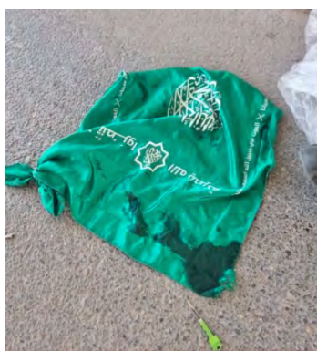
The green Hamas flag and knife in the terrorist's possession

► On the morning of November 7, 2023, a Palestinian woman draped in a Hamas flag and armed with a knife arrived on foot at the Qalandia Crossing (north of Jerusalem) and advanced toward the security guards and Border Police fighters stationed there. The forces identified and shot at her; she was detained by the security forces. There were no casualties.