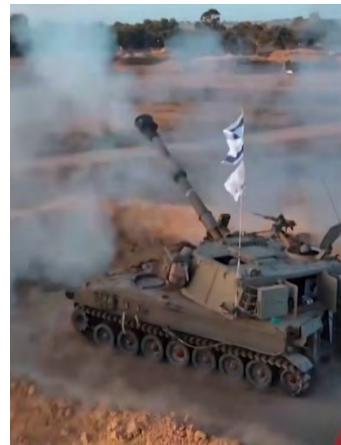
Right: A tank shoots at Gaza City (al-Ghad TV, November 7, 2023). Left: Flares light the sky over Gaza City (QudsN X [Twitter] account, November 6, 2023)

► Aerial activity: Israeli Air Force aircraft continued massive attacks on Hamas targets as well as intelligence-guided targeted attacks on launch squads. A fighter jet operating with intelligence guidance eliminated the commander of the Deir al-Balah Battalion of the the Center Camps' Brigade, who, along with other Brigade commanders, participated in dispatching nukhba terrorists into Israeli territory on October 7 (IDF Spokesman, November 6, 2023).