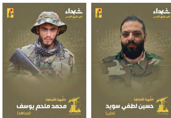
The two Hezbollah casualties (Telegram channel of Hezbollah's combat information unit, November 6, 2023)