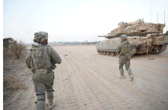
IDF forces in the Gaza Strip (November 7, 2023)