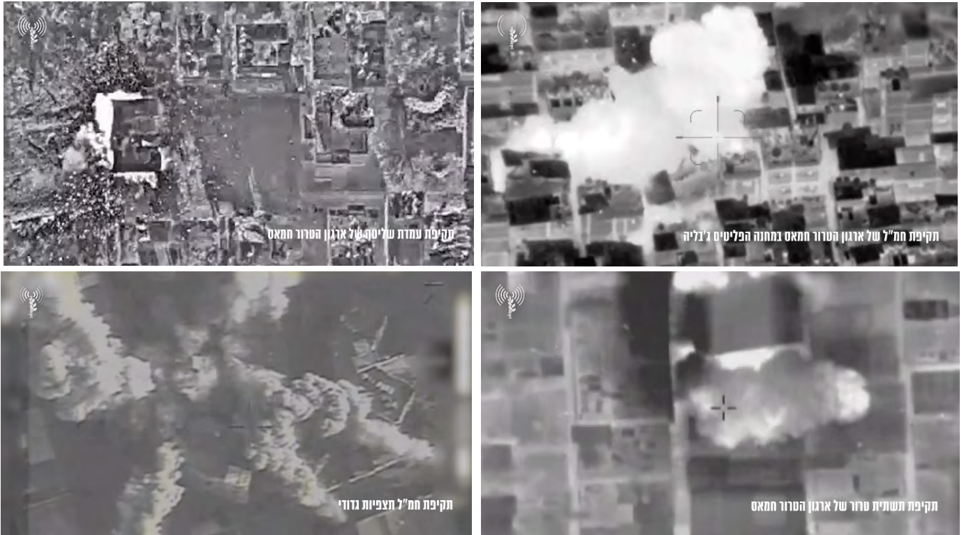
Israeli Air Force attacks in the Gaza Strip