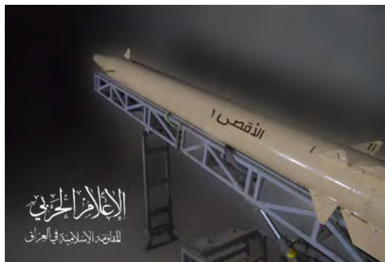
Aqsa 1 missile

reported that for the first time, they used an Aqsa 1 medium-range missile (resistance Telegram channel, November 6, 2023).