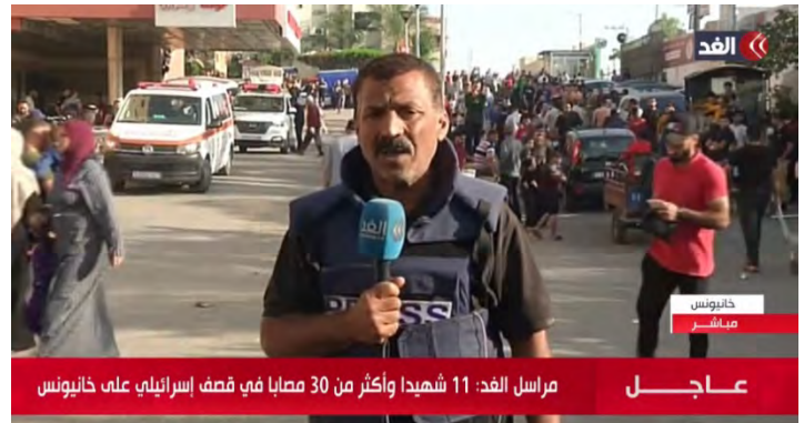
Local residents gather in front of the entrance to Nasser Hospital in Khan Yunis during the morning (November 7, 2023)