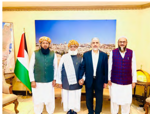
The Pakistanis meet with Mashaal and Haniyeh