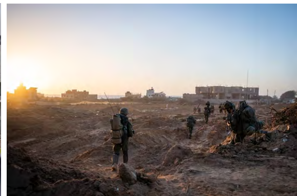
Activities of IDF forces in the Gaza Strip (IDF spokesman's website, November 14, 2023)