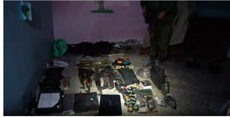
Right: Weapons found in the hospital basement. Left: A hidden tunnel in the home of a senior Hamas terrorist leading to the hospital