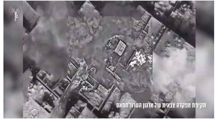
The IDF attacks Hamas terrorist targets in the Gaza Strip (IDF spokesman's website, November 13, 2023)