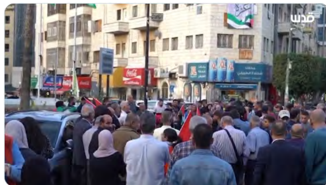
A demonstration in Ramallah demanding a boycott of Israeli products, attended by senior Fatah figure Sabri Sidam (QudsN X account, November 13, 2023)