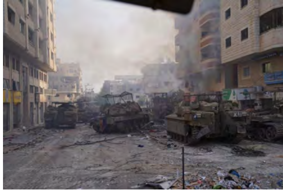
IDF armored vehicles in Gaza (QudsN X account, November 13, 2023)