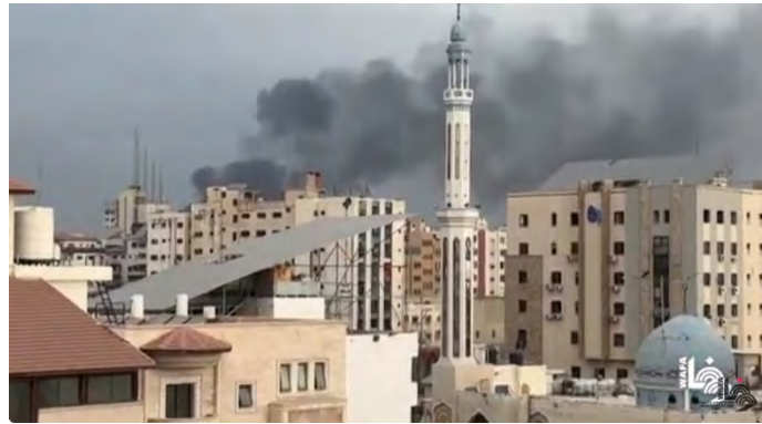
Morning Israeli Air Force strikes in Gaza (Wafa YouTube channel, November 14, 2023)

► Naval activity: Israeli Naval forces attacked a military camp used by the Hamas naval units for training and weapons storage (IDF spokesman, November 14, 2023).