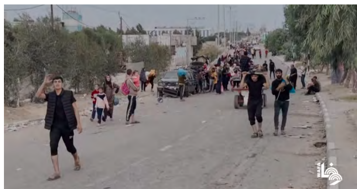
Residents of the northern Gaza Strip continue to evacuate to the south