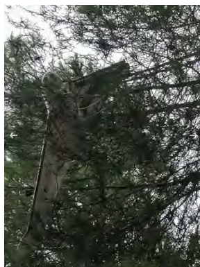
The detected aircraft