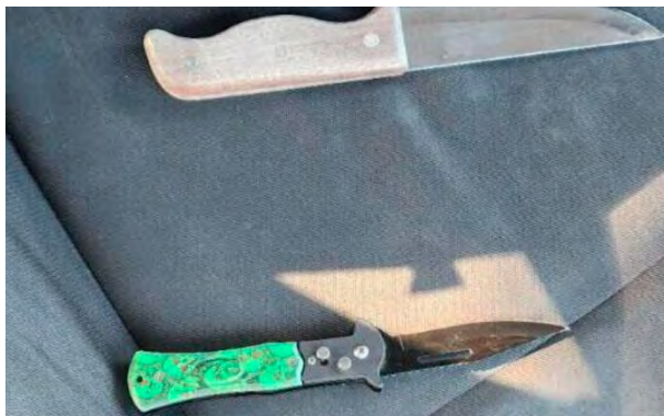
The knives found in the possession of the two youths (Israel Police spokesman's unit, November 13, 2023)

by police after raising suspicion. Questioning revealed that they had left their home with school bags on the morning of the incident and boarded a bus to Tel Aviv with the intention of stabbing soldiers. They got off the bus in the Namir Road area, put their school bags aside and hid the knives on their bodies (Israel Police Force spokesman's unit, Israeli media, November 13, 2023).