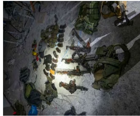
The weapons found in the camp of the Hamas naval units