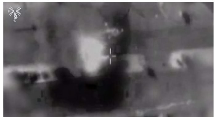
The IDF attacks terrorist targets in the Gaza Strip