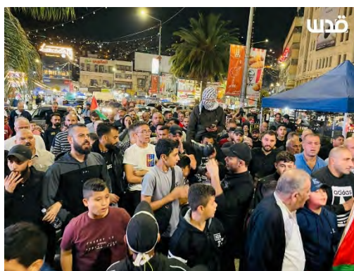
Demonstration in Nablus to protest the war in the Gaza Strip