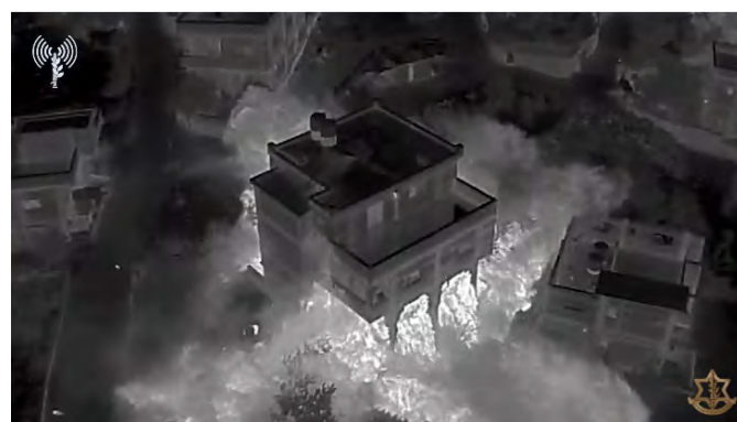
Right: Demolition of the terrorist's house (IDF website, November 14, 2023). Left: Attack on the terrorist squad in Tulkarm (IDF website, November 14, 2023)