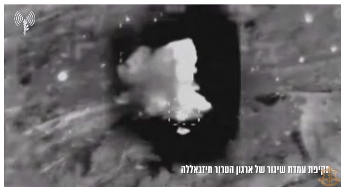
Attack on a Hezbollah launching post (IDF spokesman's website, November 13, 2023)

► IDF forces responded with artillery fire, attacked a launching post and a terrorist who shot at Israel. An IDF tank attacked a squad attempting to launch anti-tank missiles. In the evening and night, Israeli Air Force aircraft attacked Hezbollah terrorist infrastructure in Lebanese territory. Among the targets attacked were compounds where weapons were stored and a headquarters (IDF spokesman, November 13, 2023).