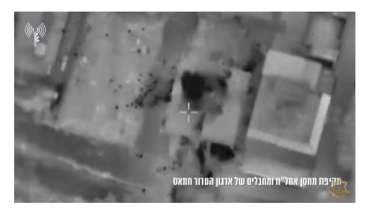
The IDF attacks weapons warehouse and Hamas terrorists (IDF spokesman's website, November 20, 2023)