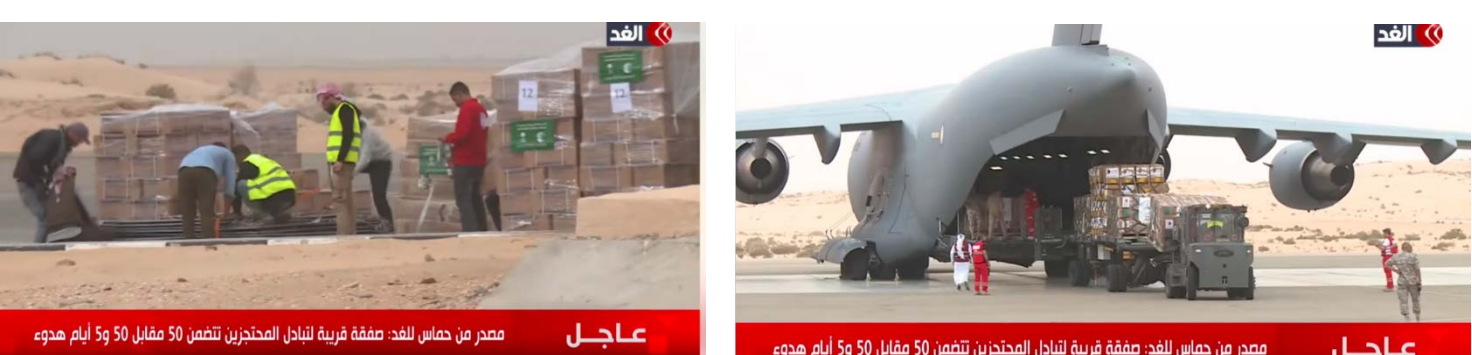
Humanitarian aid for Gaza from Saudi Arabia and the UAE lands at the El Arish airport (al-Ghad TV, November 19, 2023)

▶ The Hamas-controlled Gaza crossings authority announced that 40 trucks of equipment had been brought in through the Rafah crossing for the Jordanian field hospital (al-Ghad TV, November 20, 2023). The equipment is for the construction of another Jordanian field hospital in Khan Yunis during the next 48 hours. A Jordanian medical team of 50 doctors is expected to arrive (Mamlaka, November 20, 2023).