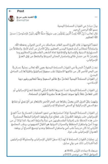
Text of the announcement by the spokesman of the Houthi movement's armed forces (Houthi Armed Forces Spokesman Yahya Saria's X account, November 19, 2023)

▶ Iranian Foreign Minister Hossein-Amir Abdollahian told journalists that "we are witnessing the first stage of the expansion of the war by the resistance groups" and that if the possible scenarios for stopping "Israel's crimes" did not yield results, "we will probably witness a new situation in the region" (Fars, November 19, 2023).