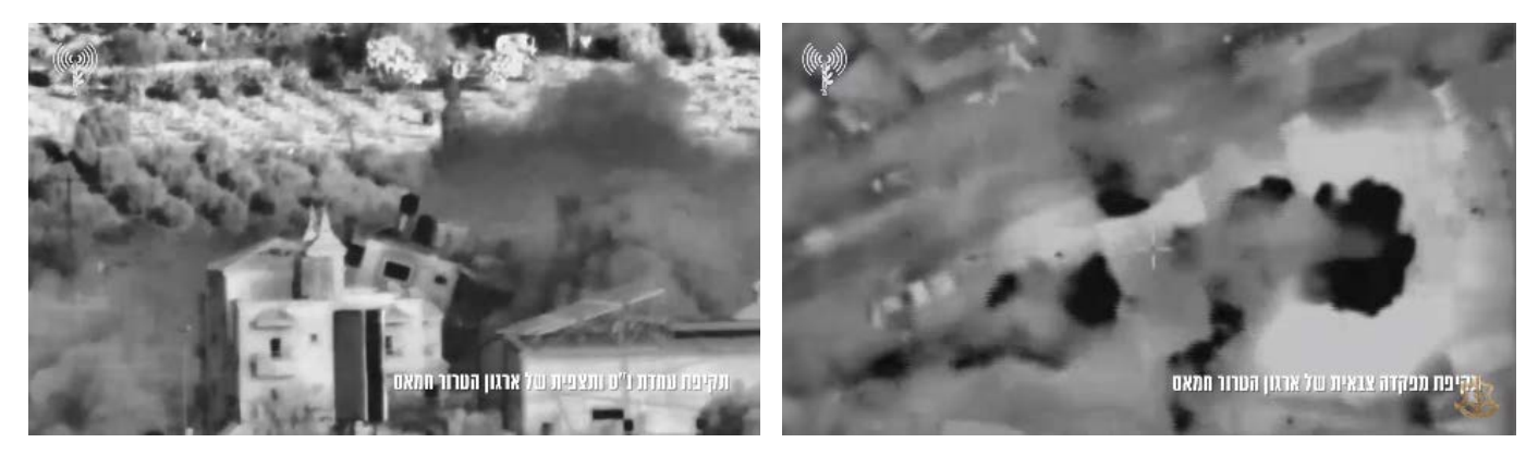
The IDF attacks targets in the Gaza Strip

► Aerial activity: Israeli Air Force aircraft continued to operate in the Gaza Strip to eliminate terrorist squads, attack terrorist targets and locate weapons and military equipment. During the past day, three company commanders of Hamas' military-terrorist wing were killed.