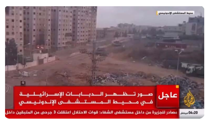
IDF tanks near the Indonesian hospital (Hassan Aslih's X account, November 20, 2023)

► Aerial activity: Israeli Air Force aircraft continued to operate in the Gaza Strip to eliminate terrorist squads, attack terrorist targets and locate weapons and military equipment. During the past day, three company commanders of Hamas' military-terrorist wing were killed.