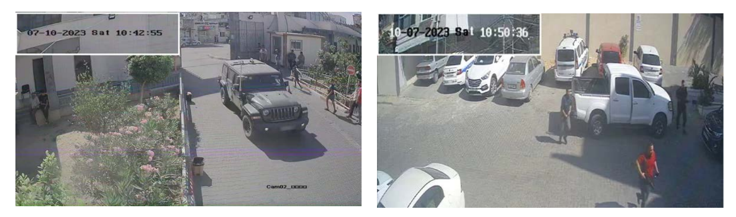
Right: The vehicles of the terrorists at the entrance to the hospital. Left: an IDF vehicle that was brought to the hospital

• A vehicle similar to the one used by Hamas terrorists in the October 7 invasion was found in the hospital, loaded with weapons. IDF military vehicles taken by the terrorists were also brought to the hospital compound (IDF spokesman, November 19, 2023).