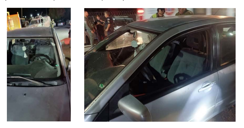
The vehicle damaged in the shooting attack

• On the evening of November 8, 2023, shots were fired at an Israeli vehicle near the Gitai Junction between Samaria and the Jordan Valley. An Israeli civilian and his wife were injured and a five-month-old baby in the vehicle was unharmed. According to the initial assessment, a terrorist ambushed the vehicle and shot at it with a handgun. Empty shell casings were found at the scene. IDF forces were deployed to search for the terrorist (Israeli media, November 9, 2023).