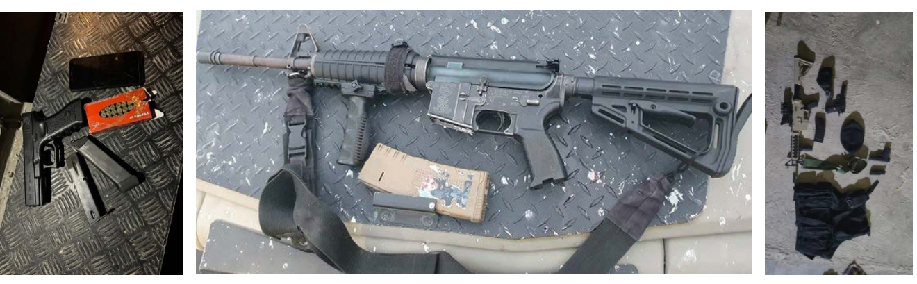
Weapons confiscated during Israeli security force activities (IDF spokesperson's website, October 29, 2023)