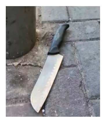
The knife used in the stabbing attack in Jerusalem

• On the morning of November 6, 2023, an Arab from East Jerusalem armed with a knife, stabbed two Border Guard fighters near the Shalem Station in east Jerusalem. One fighter was mortally wounded and later died. The terrorist who carried out the attack was shot and killed by police forces at the scene. The police also detained the terrorist's escort. The terrorist was Muhammad Omar al-Froukh, 16 years old, from Issawiya (Israel Police Force Facebook page, Shehab, November 6, 2023).