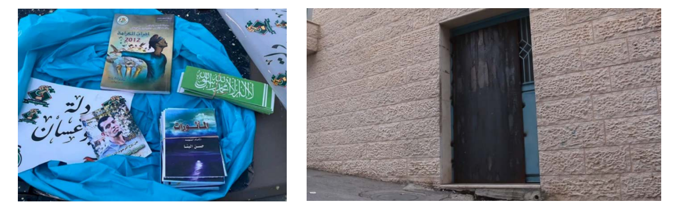
Right: Sealing the entrance to the Islamic Charity Society of Hamas in Hebron (Wafa YouTube channel, November 13, 2023). Left: Incitement and propaganda materials confiscated from a printing house in Nablus (IDF spokesman, November 13, 2023)

As part of their counterterrorism activities, the security forces also focused on printing houses used by Hamas to print incitement and propaganda materials and searching for funds intended to finance terrorist activities. For example, on November 13, 2023, IDF forces operated in Hebron and Bayta (south of Hebron) and sealed the offices of Hamas' Islamic Charity Association, confiscating money and computer equipment. Operating in Nablus, the Israeli security forces confiscated incitement and propaganda materials in a printing house (IDF spokesperson, November 13, 2023).