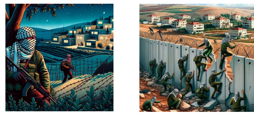
Palestinian posters calling on terrorist operatives in Judea and Samaria to attack settlements (Palestinian cartoons Telegram channel, November 16, 2023)

Right: A series of posters calling on the residents of Judea and Samaria to "resist" in various ways: hit and run, night harassment activities; Molotov cocktails, stabbing, shooting at roadblocks and soldiers, sabotaging telephone poles, blowing up buses of soldiers and settlers (Islamic Bloc in Hebron University Telegram channel, November 9, 2023). Left: An Islamic Bloc in al-Quds University call to the residents of Jerusalem to observe the evening and night prayers at the point closest to the Temple Mount because Israel prevents Muslim worshipers from reaching it (Islamic Bloc in al-Quds University Telegram channel, November 6, 2023)