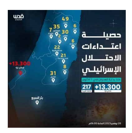
Mapping Palestinian deaths in Judea and Samaria by district (QudsN X account, November 20, 2023)