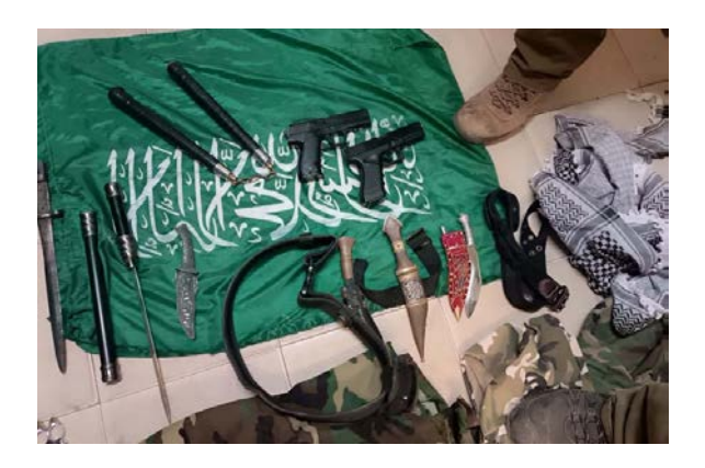
Weapons and a Hamas flag confiscated during a security force operation in Judea and Samaria (website of the IDF spokesperson, November 8, 2023)

As part of their counterterrorism activities, the security forces also focused on printing houses used by Hamas to print incitement and propaganda materials and searching for funds intended to finance terrorist activities. For example, on November 13, 2023, IDF forces operated in Hebron and Bayta (south of Hebron) and sealed the offices of Hamas' Islamic Charity Association, confiscating money and computer equipment. Operating in Nablus, the Israeli security forces confiscated incitement and propaganda materials in a printing house (IDF spokesperson, November 13, 2023).