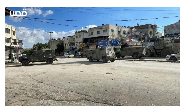
Right: Security force activity in the Balata refugee camp in Nablus. (QudsN X account, November 21 2023). Left: IDF forces detain wanted Palestinians in the village of Burqa, east of Ramallah (Shehab X account, November 22, 2023)