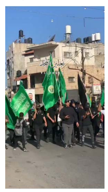
Right: Student march in Ni'lin (QudsN Telegram channel, November 6, 2023). Left: Women students demonstrate in front the department of education in the Ramallah district (Paldf Twitter account, November 5, 2023)