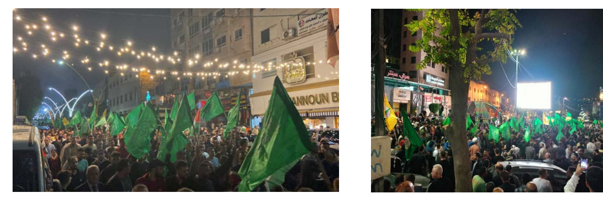
Hamas march in Hebron