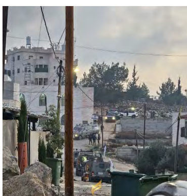
Detention of wanted persons in the al-Dheisheh refugee camp in Bethlehem (QudsN X account, December 6, 2023)

◆ In the early morning hours of December 6, 2023, the forces operated in the village of Tammun in northern Samaria and in the al-Far'a refugee camp. In both places, violent clashes broke out between armed Palestinians and the IDF who shot at them (IDF spokesperson's Telegram channel, December 6, 2023). The Palestinians reported two Palestinians killed, one in Tammun and the other in the al-Far'a refugee camp. The body of the fatality in Tammun was wrapped for burial in a Hamas flag and the other in a PIJ flag (Wafa, Palinfo X account, December 6, 2023). The Palestinians later reported on the activity of Israeli security forces to detain wanted persons in the Dheisheh refugee camp in Bethlehem (QudsN X account, December 6, 2023).