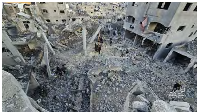
Right: The aftermath of the IDF attack on Block 2 in the Jabaliya refugee camp (QudsN X account, December 6, 2023). Left: The IDF attack near Nasser Hospital in Khan Yunis (QudsN X account, December 5, 2023)