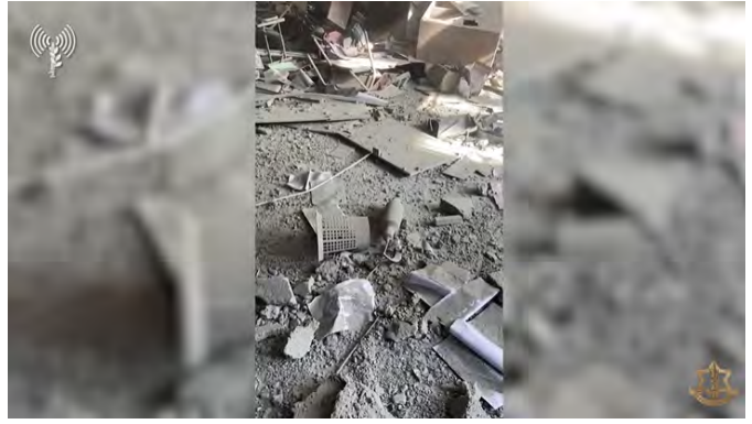
Right: IED found in a school in the northern Gaza Strip. Left: A stockpile of weapons located in the northern Gaza Strip (IDF website, December 6, 2023)