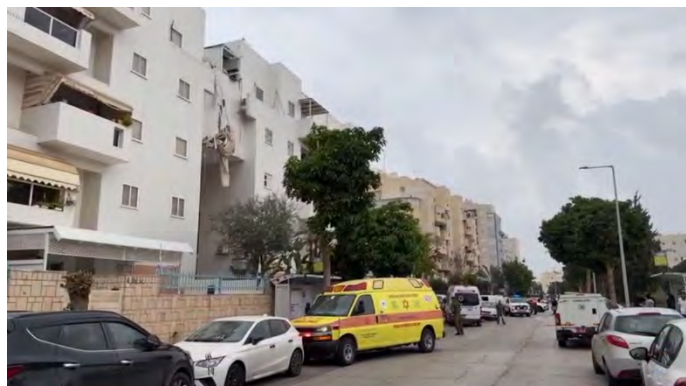
A direct rocket hit by a rocket on a residential building in Ashkelon