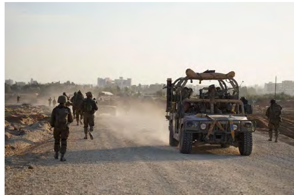
IDF forces in the Gaza Strip

► Aerial activity: During the past day, the Israeli Air Force attacked about 250 targets in the Gaza Strip, killing Hamas and Palestinian Islamic Jihad (PIJ) terrorist operatives and destroying terrorist facilities (IDF spokesperson, December 6, 2023).