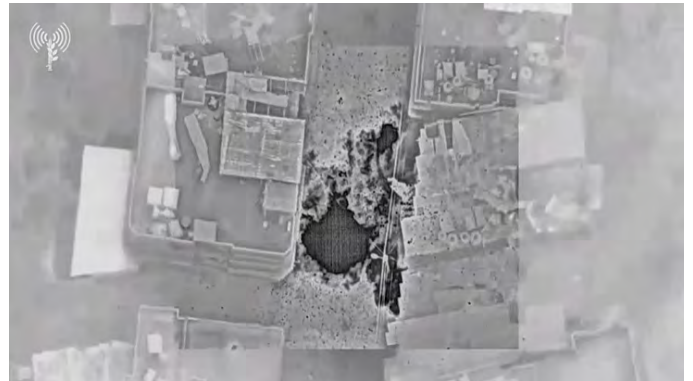
Aerial attack on a terrorist squad (IDF spokesperson, December 6, 2023)

► The Palestinian media reported the expansion of ground activity in the southern Gaza Strip and heavy exchanges of fire along several axes in the east and northwest of Khan Yunis. There was also heavy fighting in eastern Gaza City (Ma'an, December 6, 2023). According to reports, IDF forces operated in the Bani Suheila area to the east of Khan Yunis and encircled a neighborhood where several families remained; the Red Cross was called on to coordinate the