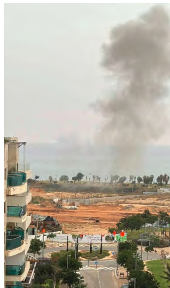
Smoke rises in the Tel Aviv area following a rocket hit (QudsN X account, December 5, 2023)