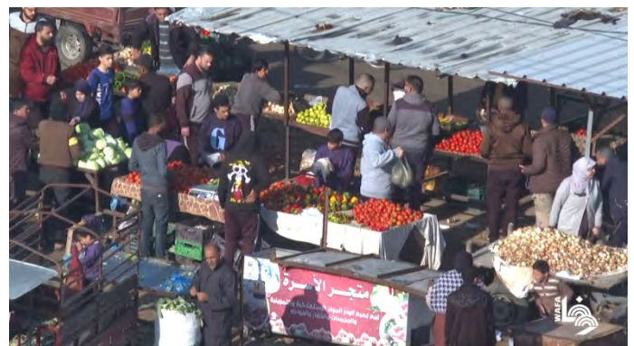
Morning pictures from Rafah. Vegetables and shoppers (Wafa YouTube channel, December 6, 2023)

►According to senior Hamas terrorist Osama Hamdan , Israel is not satisfied with the "massacres" and is also starving the Gazans with the blockade and by preventing humanitarian aid from arriving. He claimed that anyone who prevented humanitarian aid from reaching the Strip was complicit in the crime of starving the Palestinians. He warned of an increase in the number of deaths caused by disease, hunger and thirst, and called on the Arab and Islamic countries and people around the world with "a live conscience" to take their human and moral responsibility. He also called on UNRWA and the World Health Organization to meet their responsibilities, continue providing services to the Gazans and not submit to