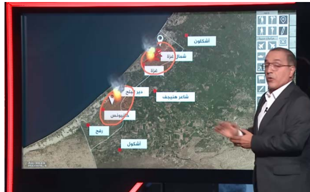
An al-Jazeera TV presenter reports on the activities of the IDF forces