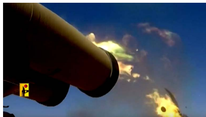
Right: Launching an Tha'r Allah system anti-tank missile (Hezbollah combat information wing Telegram channel, December 9, 2023). Left: An anti-tank missile hits a Merkava tank near the Biranit post (Hezbollah combat information wing Telegram channel, November 17, 2023)

► Lebanese politicians who commented on the December 7 attack on the Lebanese army position in the vicinity of the south Lebanon village of al-Adeisa claimed Israel was ramping