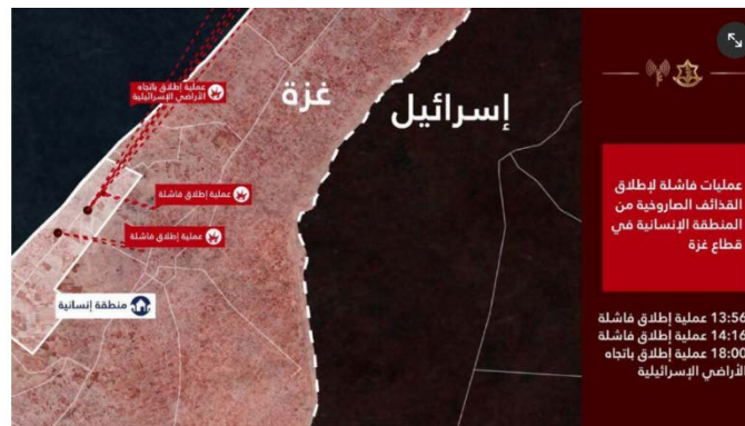
Rocket launches from the area to which the civilian population evacuated (IDF spokesperson in Arabic, December 8, 2023).

►The terrorist organizations in the Gaza Strip continued firing rockets at Israel, although their numbers were relatively low and for the most part attacked the cities, towns and villages surrounding the Gaza Strip. On December 8, 2023, three barrages were launched towards central Israel from the safe zone in the southern Gaza Strip to which the population had evacuated.