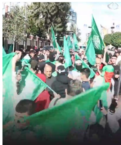
Right: March in Hebron. Left: March in Tulkarm

► The national and Islamic forces in Judea, Samaria and Jerusalem declared a general strike on December 11, as part of a global strike declared to protest the American bias in favor of Israel and the continuation of the war in the Gaza Strip (Hurriya News, December 10, 2023; Wafa, December 9, 2023).