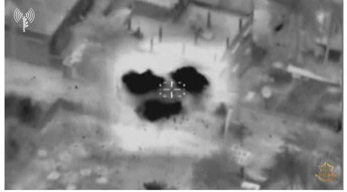
Israeli Air Force attacks in the Gaza Strip (IDF spokesperson, December 9, 2023)