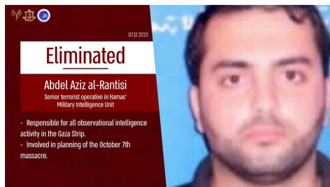
Abd al-Azia Rantisi and Ahmed Ayoush (IDF Account X, December 7, 2023)