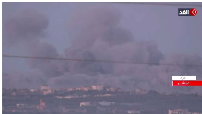
Smoke rises from the IDF attacks in the Tufah and Shejaiya neighborhoods in eastern Gaza City (December 10, 2023)