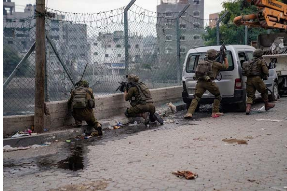
IDF forces in Jabalia (IDF spokesperson, December 9, 2023)

◆ The Jabalia refugee camp: During an attack based on information about the presence of Hamas terrorist operatives and weapons in nearby buildings, the fighters arrived through an alley, surprised the terrorists and killed them.