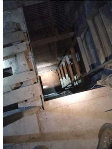
Right: A tunnel shaft found Shejaiya. Left: The tunnel shaft located in a classroom (IDF spokesperson, December 8, 9, 2023)