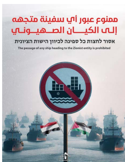
Poster issued by the Houthis (on the Houthi movement's Ansar Allah Telegram channel, December 9, 2023)

► Yahya Saria, spokesman for the Houthi armed forces , issued an official statement saying that from now on, the Yemeni army would prevent the passage of ships bound for Israel of any nationality unless they were destined for the Gaza Strip to provide humanitarian aid. He added that any ship sailing towards Israel would become a legitimate target for the forces. He warned all ships against cooperating with Israeli ports and stressed that international trade traffic for all ships would continue as usual, except for Israeli ships or those carrying goods to Israel (Yahya Saria's X account, December 9, 2023).