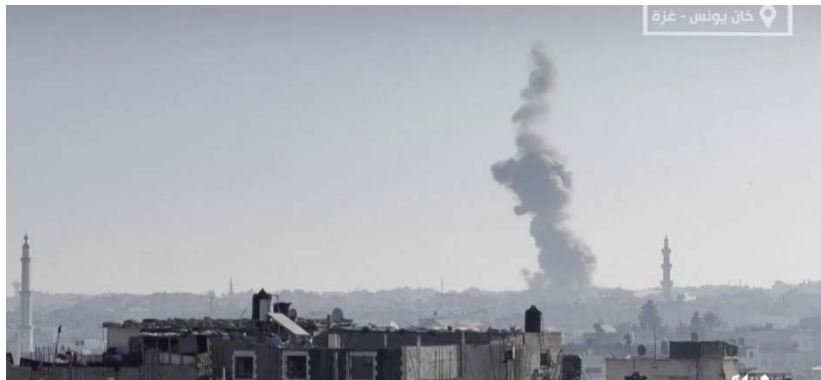
IDF attack on Khan Yunis (YouTube channel, December 9, 2023)

► Naval activity: Israeli Navy forces attacked terrorist facilities used by Hamas' naval commandos in the central and southern Gaza Strip, including military sites and posts, observation posts, weapons warehouses, buildings and vessels used for terrorist purposes and terrorist squads (IDF spokesperson, December 8-9, 2023).