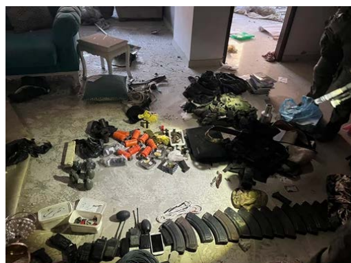
The weapons found in al-Azhar University (IDF spokesperson, December 8, 2023)

► Aerial activity: The Israeli Air Force, in cooperation with the ground forces, continued attacking terrorist targets throughout the Gaza Strip. On the night of December 7, 2023, airstrikes in the Khan Yunis area lasted for two consecutive hours (IDF spokesperson, December 8, 2023).