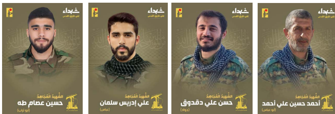
Hezbollah casualties (Hezbollah combat information wing Telegram channel, December 7-9, 2023)