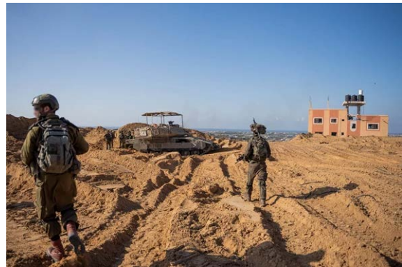
IDF forces in the Gaza Strip (IDF spokesperson, December 8, 2023)