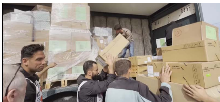
The Red Cross delivers medical aid to Nasser Hospital in Khan Yunis