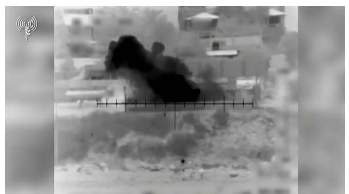
Israeli Navy attacks (IDF spokesperson, December 8, 2023)