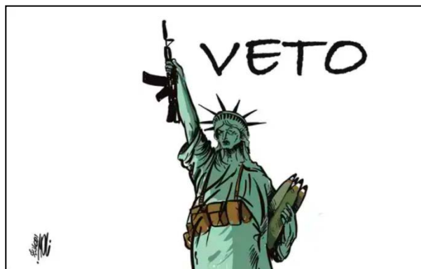
Palestinian cartoon condemning the American veto (al-Quds, December 10, 2023)