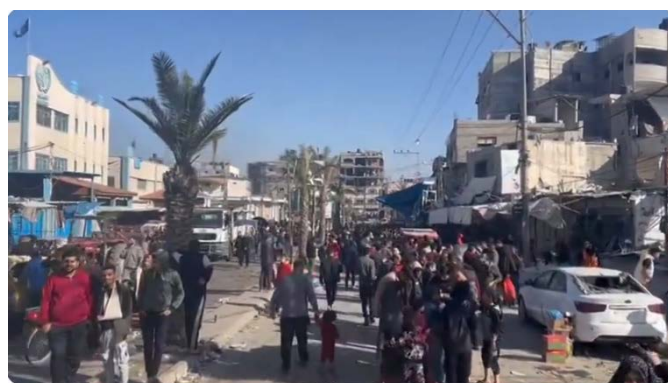
Right: Gazans in the Jabalia refugee camp. Left: Waiting in line at the UNRWA center to receive food (Shehab X account, December 9, 2023)