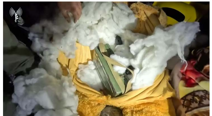
Right: Weapons found inside a giant teddy bear. Left: Weapons found inside an UNRWA bag (IDF spokesperson, December 9, 2023)