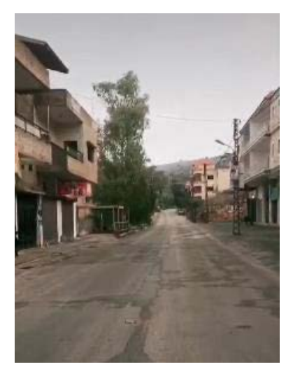
The deserted village of Houla