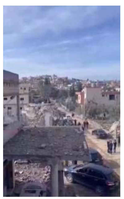
The town of Aita al-Shaab: significant destruction and few residents visible on the streets

According to estimates, the rate of displaced civilians differs from settlement to settlement and ranges from 10%-90%. More departure is evident in Christian areas compared to Shi'ite areas. For example, about 20% of the residents evacuated from the Shi'ite Bint Jbeil Shi'ite, about 70% from the Christian village of Rmeich, which, according to the head of the village council, became a "ghost town." Lebanese sources reported that about 90% of the residents of the villages of Kila, Houla, al-Adissa, Yaroun and al-Khira, the overwhelming majority of whom are Shi'ite, evacuated, as did the about 75% of residents of Shuba. Most of the residents of the town of Jadeeda (also called Jadeeda-Marjayoun), in the center of Marjayoun district, remained in their homes (Facebook page of Farid Kteich, December 8, 2023; Beirut News, November 16, 2023; Sky News, November 10, 2023; Sputnik, November 13 2023).