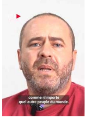
Residents express indignation at Lebanon's being dragged into the fighting

▶ The Lebanese government provides the residents with some help though the Council of the South, a group that works for their well-being on behalf of the Lebanese government, distributing aid packages to the needy in the southern villages, for example in the town of Markaba on December 11, 2023. However, the aid is limited and cannot substantially improve the residents' conditions, especially in light of Lebanon's precarious economic situation.