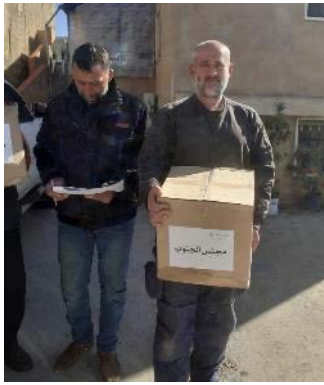
Distribution of aid packages in Markaba (Facebook page of the town of Markaba, December 11, 2023)