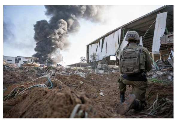
IDF forces in the southern Gaza Strip (IDF spokesperson, December 17, 2023)

▶The Palestinian media reported that IDF forces were attacking the east Gaza City neighborhoods of Shejaiya, Daraj and Tufah with intense artillery fire (QudsN X account, December 18, 2023). An al-Jazeera correspondent in Gaza reported 50 dead in the IDF attack in the Sabra neighborhood of Gaza City, who were evacuated to Shifa Hospital. Considerable damage to property was reported (QudsN X account, December 18, 2023).