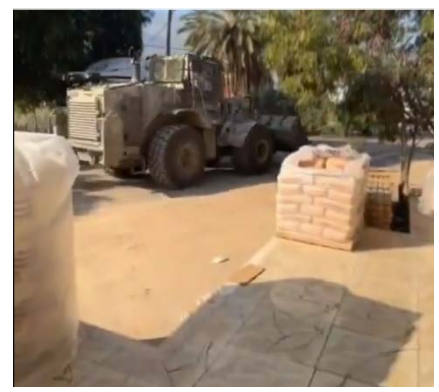
Right: The entrance of an IDF bulldozer to the al-Far'a refugee camp. Left: An IED detonated during an Israeli security force operation

Since the beginning of the war in the Gaza Strip, about 2,400 wanted Palestinians have reportedly been detained, of whom about 1,200 were Hamas operatives (IDF spokesperson's X account, December 18, 2023).