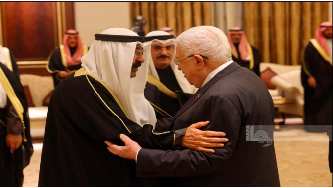
Mahmoud Abbas visiting Kuwait

▶ Catherine Colonna, French foreign minister, met in Ramallah with PA Prime Minister Muhammad Shtayyeh. During the meeting, Shtayyeh stressed the importance of the pressure France could exert to stop Israel's activity in the Gaza Strip, Judea and Samaria and the necessity of opening all crossings to the Gaza Strip for the entry of humanitarian aid and fuel. He also called on France to take action against "settlers holding French citizenship." Referring to the day after the war, Shtayyeh made it clear that the Palestinian leadership's top priority was the need to reach a ceasefire, and that talking about the day after had to include a political solution that would include all the Palestinian territories and would lead to the twostate solution.