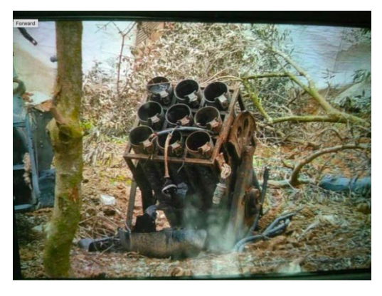
A rocket launching pit and rocket launcher located in the Khan Yunis area (IDF spokesperson, December 18, 2023)