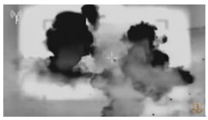
Right: Attack on Hezbollah's terrorist infrastructure (IDF spokesperson, December 18, 2023). Left: Attack on a squad (IDF spokesperson, December 17, 2023)