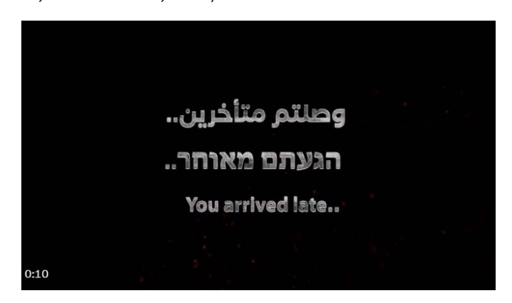
The end of the video (Palinfo, December 18, 2023).

▶The Izz al-Din Qassam Brigades, Hamas' military-terrorist wing, published a video of the tunnel the IDF uncovered entitled called "You arrived late, mission accomplished," in Arabic, Hebrew and English. It begins with Israeli Ministry of Defense Yoav Gallant inside the tunnel, followed by scenes from the October 7 attack and massacre, in an attempt to link the tunnel to the attack (Palinfo, December 18, 2023).