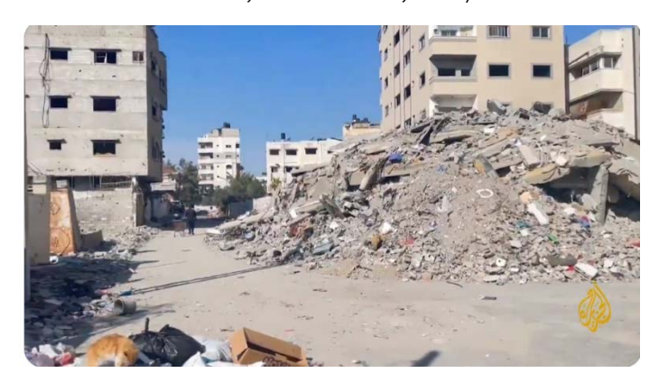
Property damage in the Sabra neighborhood in Gaza City caused by IDF strikes

A correspondent for al-Arabi TV in Deir al-Balah, broadcasting from Shuhadaa al-Aqsa hospital, reported that IDF forces continued attacks in the Jabalia and Beit Lahia areas as well as in the refugee camp. In Deir al-Balah, 15 deaths were reported and they were evacuated to the hospital (al-Arabi YouTube channel, December 18, 2023).