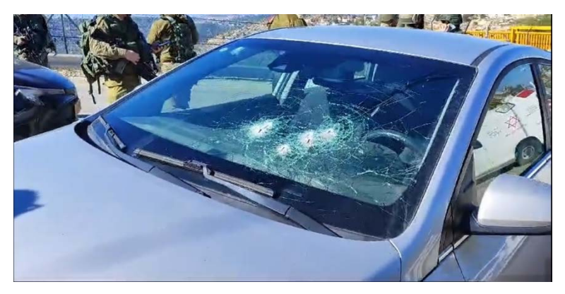
The vehicle damaged in the shooting attack

▶On the morning of December 18, 2023, a drive-by shooting targeted two Israeli vehicles near the town of al-Rawabi (northeast of Ramallah). One of the vehicles, in which a family was traveling, was hit by about ten bullets. The driver returned fire. His wife was wounded and their children were unscathed. Israeli security forces pursued the terrorists (Israeli media, IDF spokesperson's X account, December 18, 2023).