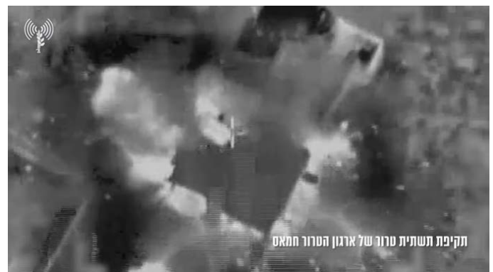
Israeli Air Force attacks in the Gaza Strip (IDF website, December 19, 2023)