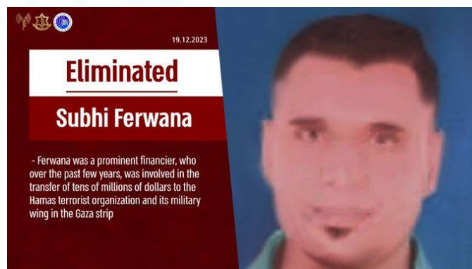
Subhi Farwana (IDF spokesperson, December 19, 2023)

millions of dollars to finance the activities of Hamas' military-terrorist wing through their currency-exchange business (IDF website, December 19, 2023). 2