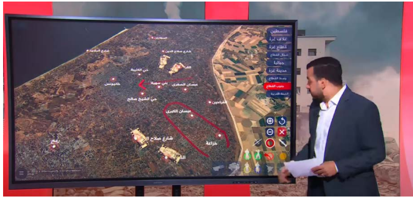
An al-Arabi TV presenter describes the IDF fighting in the Khan Yunis area

►Palestinian media reported 29 dead in an attack on three buildings in Rafah. The casualties were evacuated to Abu Yusuf al-Najar Hospital and the Kuwaiti Hospital (al-Quds, al-Arabi TV, December 19, 2023).