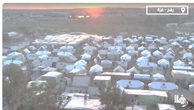
The tent camp erected in western Rafah (Wafa YouTube channel, December 19, 2023)

►The Wafa YouTube channel published pictures of a tent camp erected in west Rafah for displaced persons from the Gaza Strip. The tents were donated by Qatar (Wafa YouTube channel, December 19, 2023).