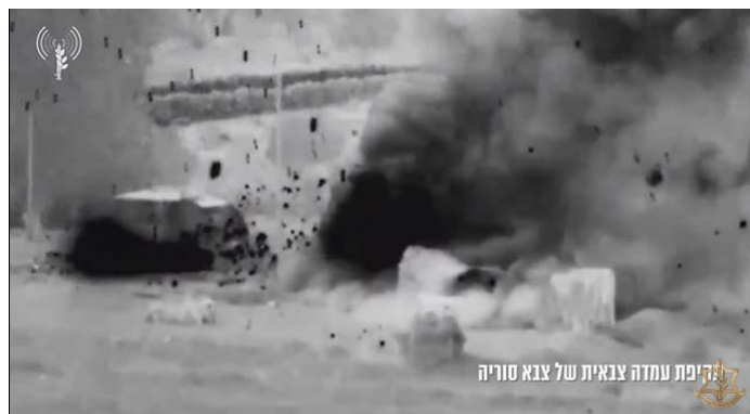
IDF attack on a Syrian army position (IDF spokesperson, December 18, 2023)

► On December 18, 2023 around 10 p.m. several rockets were launched at Israel from Syria; they fell in open areas. In response, IDF forces attacked the sources of the launches, and IDF tanks attacked a military position of the Syrian army (IDF spokesperson, December 18, 2023).