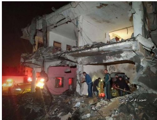
The results of a night attack in Rafah (Shehab X account, December 19, 2023)

►Palestinian media reported 29 dead in an attack on three buildings in Rafah. The casualties were evacuated to Abu Yusuf al-Najar Hospital and the Kuwaiti Hospital (al-Quds, al-Arabi TV, December 19, 2023).