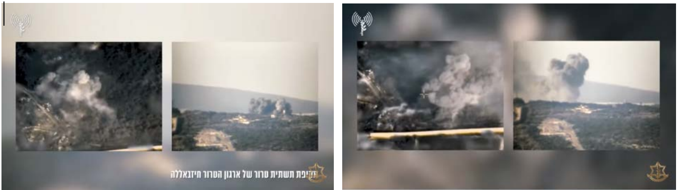
IDF attacks on Hezbollah terrorist facilities (IDF spokesperson, December 18, 2023)