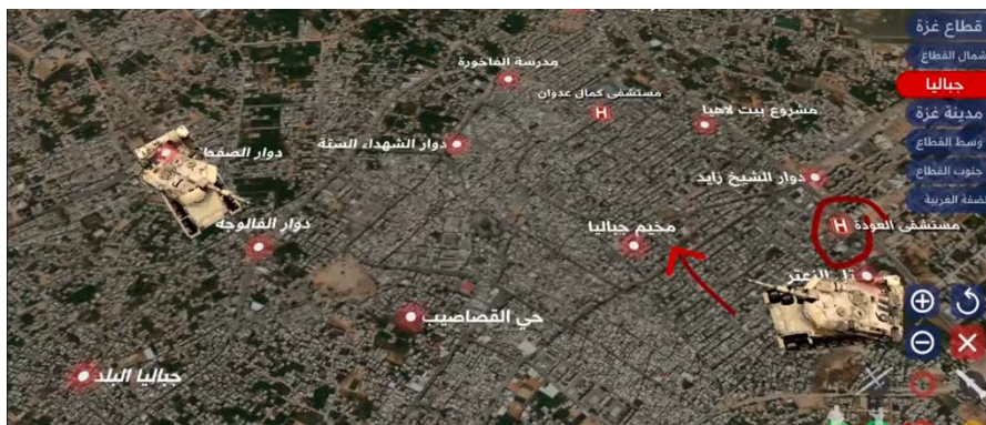
Al-Arabi TV reports on the IDF's combat moves in the Jabalia refugee camp (al-Arabi YouTube channel, December 18, 2023)