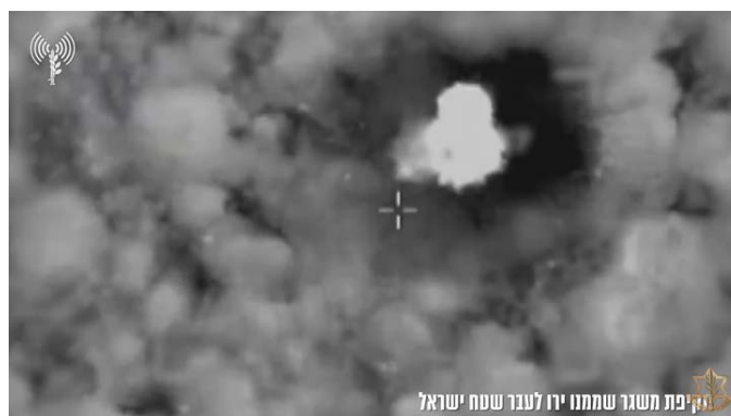
Attack on a rocket launcher used to attack Israel (IDF spokesperson, December 18, 2023)