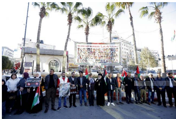
Demonstration in front of UN headquarters

► The Palestinian network of NGOs held a demonstration in front of the UN headquarters in Ramallah, demanding an end to the war in the Gaza Strip.