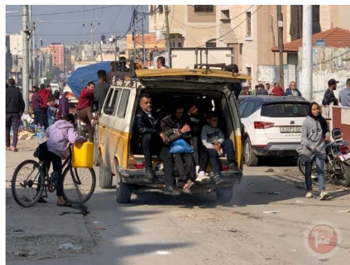
Transportation in the Gaza Strip (Ma'an, December 19, 2023)