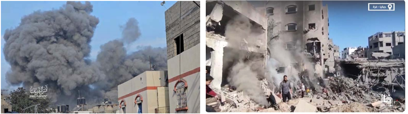
Right: The Jabalia refugee camp. Left: IDF attacks in the northern Gaza Strip