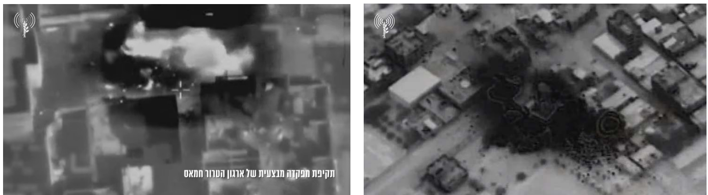
The IDF attacks targets in the Gaza Strip