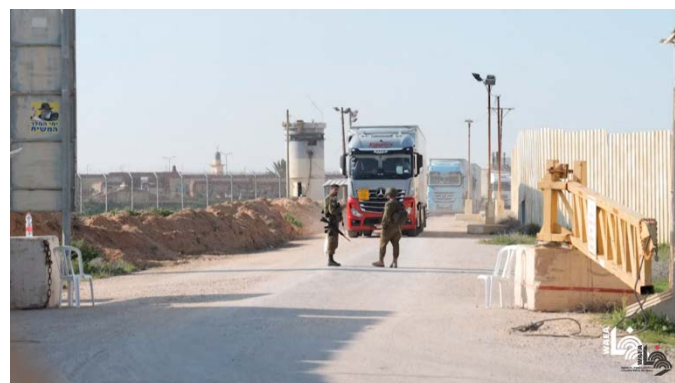
Trucks enter the Gaza Strip through the Kerem Shalom Crossing