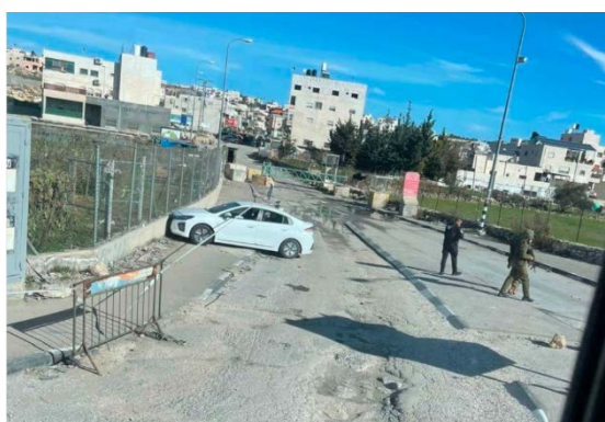
The scene of the attack at the Beit Einun junction (north of Hebron) (QudsN X account, December 20, 2023)

► On the morning of December 20, 2023, a Palestinian tried to run over an IDF force operating at the Beit Einun junction (north of Hebron) with his vehicle. In response, the force shot and killed him (Israeli media, December 20, 2023). The Palestinian media reported that the driver was Basel al-Muhtasib, 28, from Hebron (Arabs48 website, December 20, 2023).