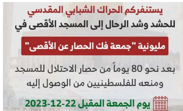
Call to go to al-Aqsa Mosque (Hurriya News, December 20, 2023)

► Palestinian youth activists and networks in Jerusalem issued calls to participate in the “million-man march” of the “Friday of breaking the siege of al-Aqsa” on December 22, 2023. They demanded that all mosques be closed and that everyone go to al-Aqsa Mosque for the Friday prayers (QudsN, December 19, 2023; Hurriya News, December 20, 2023).