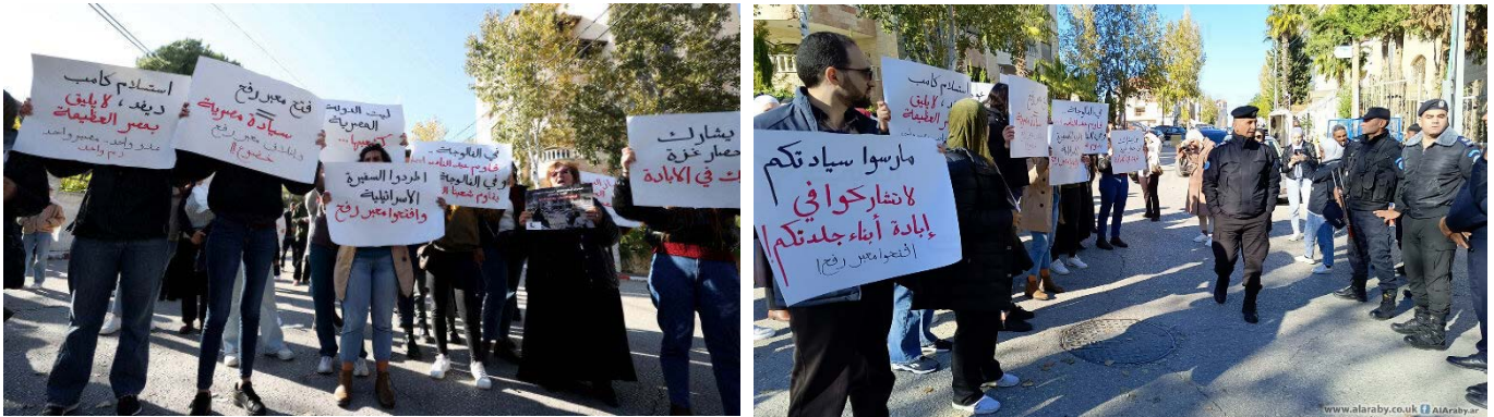
The demonstration near the Egyptian embassy in Ramallah