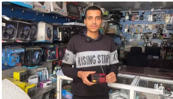
Right: Increasing demand for battery-operated portable radios (Wafa YouTube channel, December 19, 2023). Left: Residents of Gaza listening to the radio (al-Ghad TV, December 19, 2023)

► A Ma'an news agency correspondent in Gaza broadcast a program about civilian means of transportation. He said that due to the fuel shortage, the many vehicles damaged in combat zones and residents who had been forced to abandon their vehicles and evacuate, civilians were using alternative means of transportation, such as horse- and donkey-drawn carts, vehicles used for transporting furniture and equipment, and open vans. In addition, many civilians preferred to walk, even long distances (Maan, December 19, 2023).