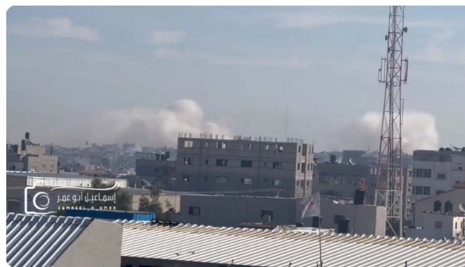
Fighting between the IDF forces and the "resistance" [terrorist operatives] in Bani Suheila, in eastern Khan Yunis