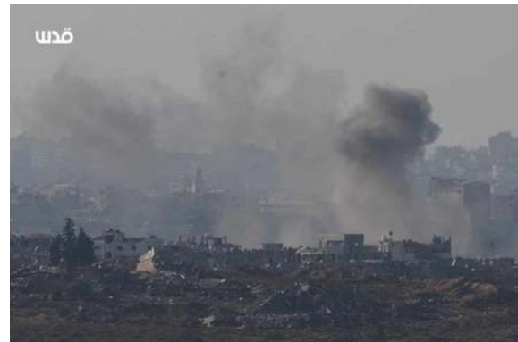
IDF attacks in the northern Gaza Strip (QudsN X account, December 19, 2023)