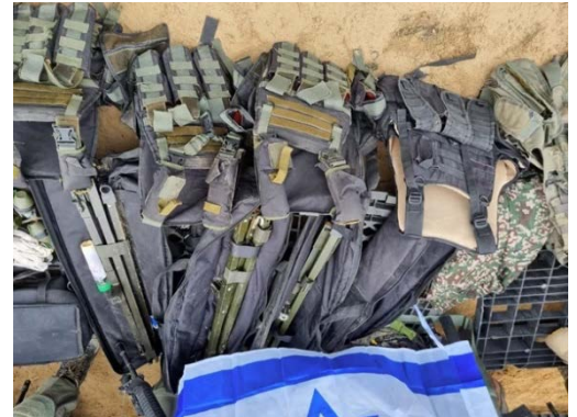
Some of the weapons found (IDF spokesperson, December 19, 2023)