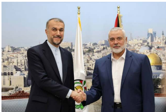
Haniyeh meets with the Iranian foreign minister (Iranian foreign ministry website, December 20, 2023)

Palestinians to put an end to the "criminal aggression of the Zionist regime against the Gaza Strip," end the siege and deliver humanitarian aid to the Gaza Strip. He said Iran was confident that the Palestinian people would not allow anyone to force political plans on them (Tasnim, December 20, 2023).