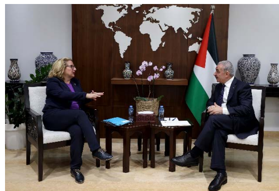
Right: Shtayyeh meets with the German minister. Left: Shtayyeh meets with members of the Italian Parliament