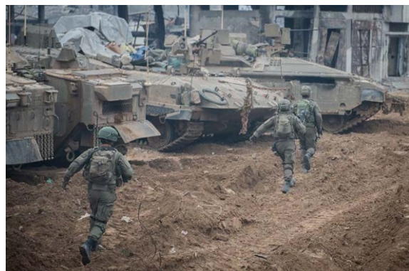
IDF forces in the Gaza Strip (IDF spokesperson, December 20, 2023)

► The Palestinian media reported that IDF forces continued to attack the Jabalia area, the northern Gaza Strip, eastern Gaza City, the Shejaiya and Tufah neighborhoods, the central