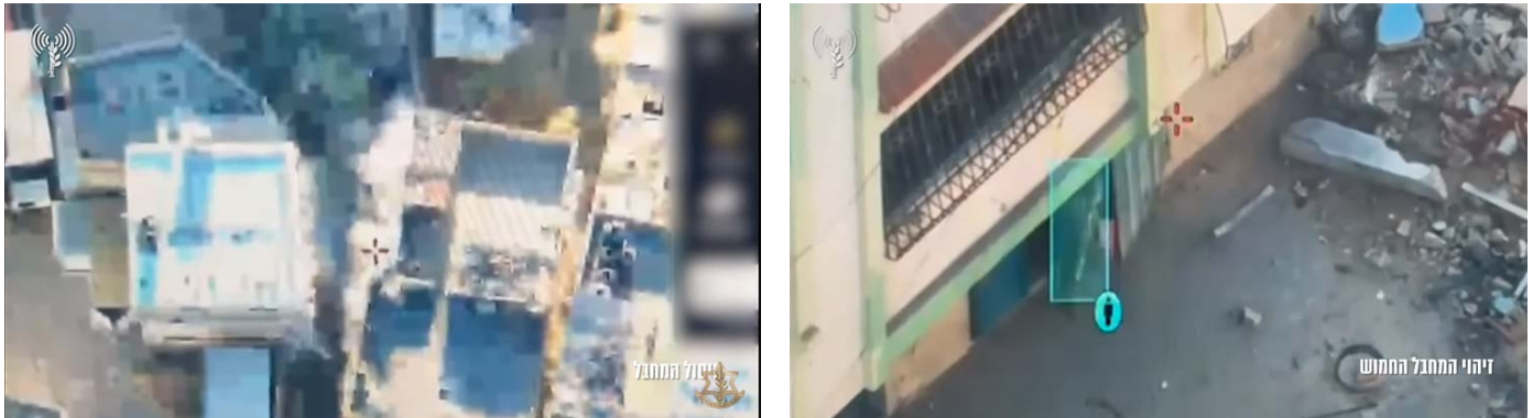
IDF forces identify (right) and eliminate (left) an armed terrorist in Khan Yunis

from which the terrorists had attacked them and where large quantities of weapons were stored.