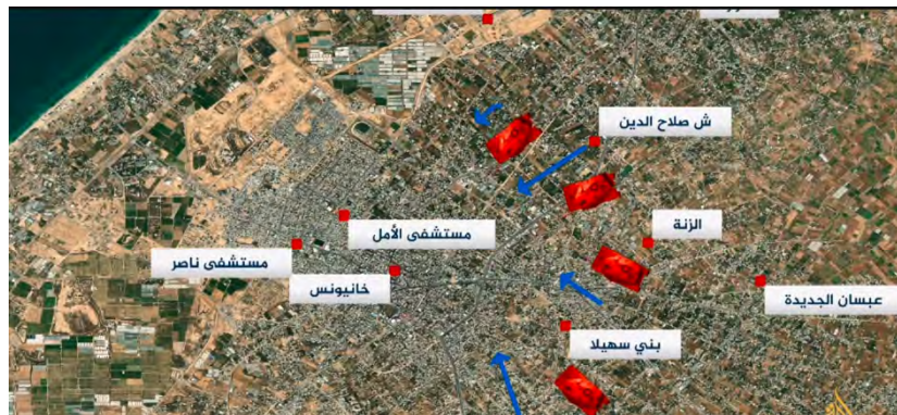
IDF ground maneuver in the Khan Yunis area (al-Jazeera YouTube channel, December 27, 2023)

►An al-Jazeera TV correspondent reported that IDF forces were operating from the north, south and east of the city of Khan Yunis (al-Jazeera YouTube channel, December 27, 2023).