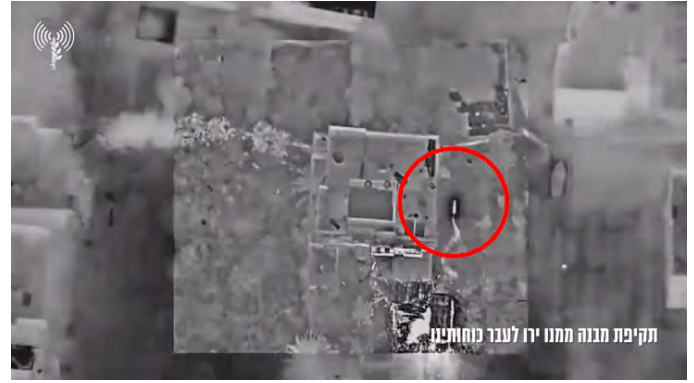
Right: Terrorists shoot at IDF forces from a building in the northern Gaza Strip. Left: The building attacked by a fighter jet (IDF spokesperson, December 28, 2023)

► The central Gaza Strip: IDF forces have been operating in the area of the al-Bureij refugee camp for several days. An al-Jazeera correspondent reported that the IDF attacks focused on the Deir al-Balah and Khan Yunis areas (al-Jazeera TV YouTube channel, December 27, 2023)