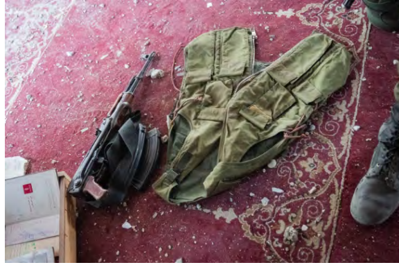
Weapons found in the mosque (IDF spokesperson, December 28, 2023)

►An al-Jazeera TV correspondent reported that IDF forces were operating from the north, south and east of the city of Khan Yunis (al-Jazeera YouTube channel, December 27, 2023).