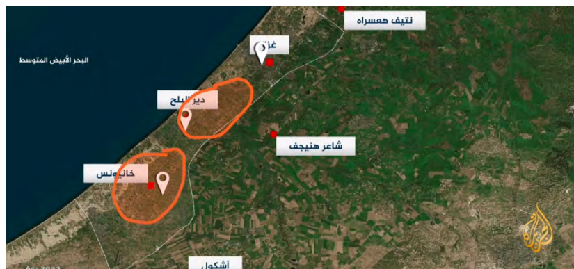
IDF attacks focus on the Deir al-Balah area (central Gaza Strip) and the Khan Yunis area (southern Gaza Strip) (al-Jazeera YouTube channel, December 27, 2023)

► The central Gaza Strip: IDF forces have been operating in the area of the al-Bureij refugee camp for several days. An al-Jazeera correspondent reported that the IDF attacks focused on the Deir al-Balah and Khan Yunis areas (al-Jazeera TV YouTube channel, December 27, 2023)