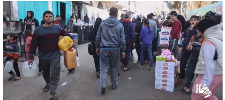
The main street in the Nuseirat refugee camp