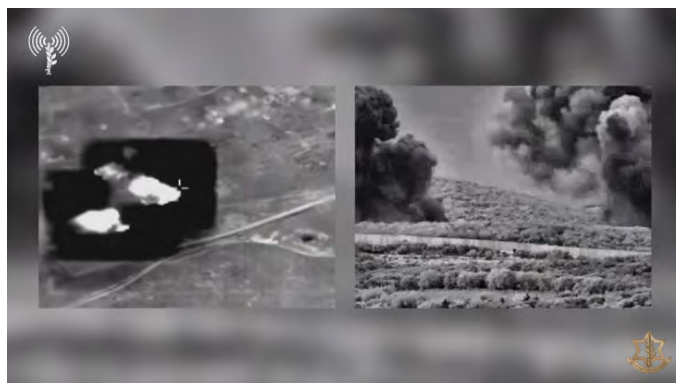
Right: Hezbollah terrorist infrastructure being attacked (IDF spokesperson, December 27, 2023). Left: Airstrikes attributed to Israel against the town of Ramya, in south Lebanon (Ali Shoeib's X account, December 28, 2023).