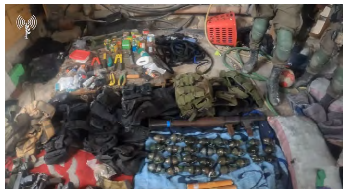
Some of the weapons found in the area of the hospital (IDF spokesperson, December 27, 2023)

► The southern Gaza Strip: The IDF expanded its military activity in the Khan Yunis area, during which the fighters identified an underground facility in a mosque. An IED was detonated in one of the rooms and the terrorists shot at the soldiers. Meanwhile, the IDF began activity in the Khirbat Khiza'a area, where the terrorists who attacked Kibbutz Nir Oz on October 7 th crossed the border. (IDF spokesperson, December 27 and 28, 2023).