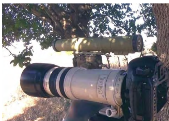
Launcher with a guided missile and a camera (Ali Ghandour's X account, retweeted by Ali Shoeib, December 27, 2023)

► In connection with the firing of guided missiles at military and civilian targets in Israel, a photo was recently published showing a guided missile launcher with a camera with a telephoto lens next to it, which enables remote photography (Ali Ghandour's X account, retweeted by Ali Shoeib, December 27, 2023).