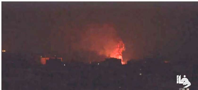
IDF attack in Rafah (Wafa YouTube channel, December 28, 2023)