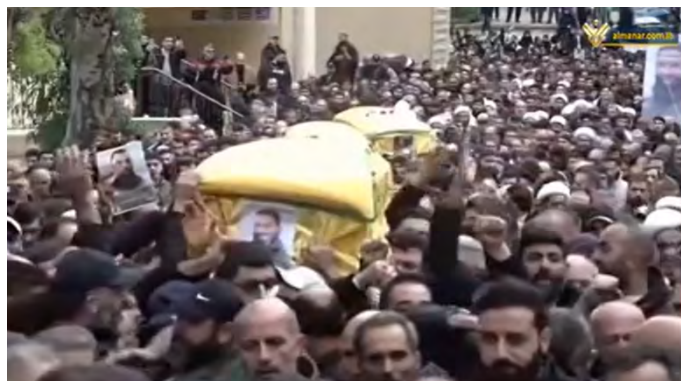
The funeral procession: the coffins draped in Hezbollah flags (al-Manar, December 27, 2023)

that association with the organization is a criminal offense for every Australian citizen (ABC News, December 28, 2023).