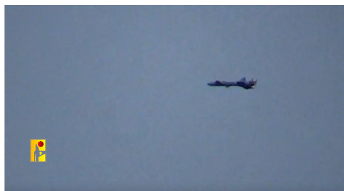
Right: Hezbollah drone in flight for an attack in the Mount Dov area. Left: A cloud of dust rising after the impact (Hezbollah's combat information Telegram channel, December 28, 2023)