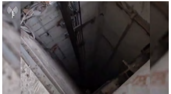
Right: A tunnel shaft. Left: Part of the tunnel (IDF spokesperson, December 27, 2023)