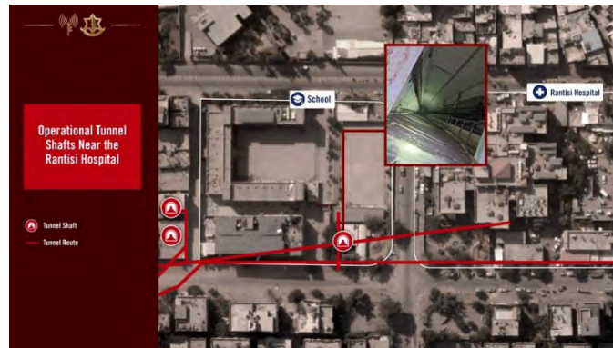
Aerial photograph of the area of Rantisi Hospital and the locations of the tunnel shafts