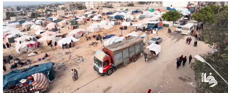
A tent camp in Deir al-Balah erected for residents evacuated from the al-Bureij refugee camp (Wafa YouTube channel, December 27, 2023)