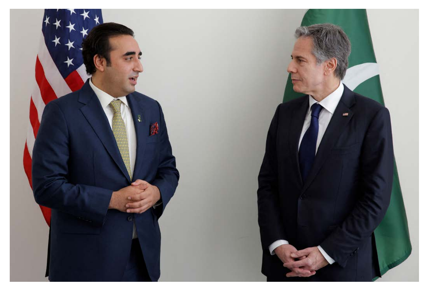
Photo above: U.S. Secretary of State Antony Blinken (R) meets with Former Pakistani Foreign Minister Bilawal Bhutto Zardari (L) at United Nations headquarters in New York on May 18, 2022.

Pakistan will, however, need to attract foreign investments from diverse sources to capitalize on CPECenabled infrastructure projects, service its accumulated loans, and safeguard against potential Chinese pressure to turn CPEC economic assets into dual-use facilities. The U.S. would particularly not want to see the Chineseadministered commercial port city of Gwadar, located on the coast of the Arabian Sea, become a base for Chinese naval operations.