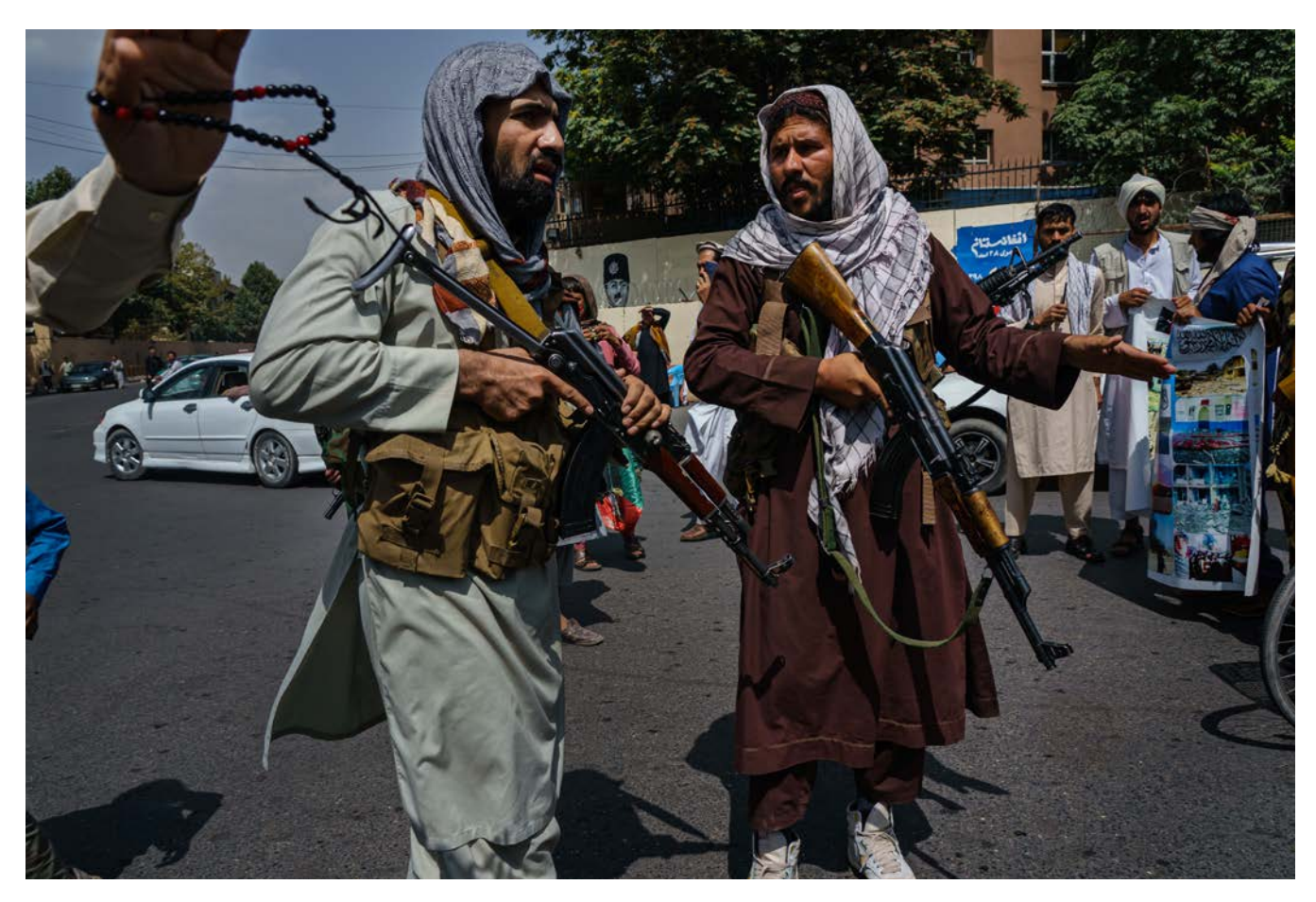
Photo above: Taliban fighters mobilize to control a crowd in Kabul, Afghanistan, on Aug. 19, 2021.

undocumented Afghan migrants.<sup>77</sup> Around 400,000 Afghans had been deported by the end of November,<sup>78</sup> and the refoulment process is still ongoing. This significant refugee outflow is a humanitarian crisis, and it is further straining Pakistan's ties with the Taliban regime in Afghanistan. The latter is ill-equipped to handle such an influx, and is already unable to cater to the most basic needs of its citizens. It is possible that Pakistan's resolve to deport the planned number of Afghans may dissipate as a result of pressure