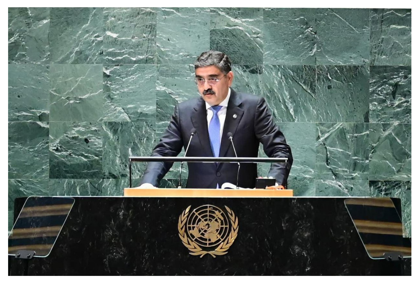
Photo above: Pakistan's caretaker Prime Minister Anwaar-ul-Haq Kakar delivers his remarks during the 78th session of the U.N. General Assembly in New York on Sept. 22, 2023.

PTI supporters also managed to get several congressmen to call for United Nations oversight<sup>28</sup> of the upcoming general elections and to express concern about the erosion of freedom of expression and human rights in the country. However, the initial response from the White House remained cautious, merely expressing concern<sup>29</sup> about the unfolding situation in Pakistan. While wary of being viewed as interfering in Pakistan's domestic politics, especially after Khan's accusations of a U.S.-backed plot to overthrow him, American diplomats did engage with