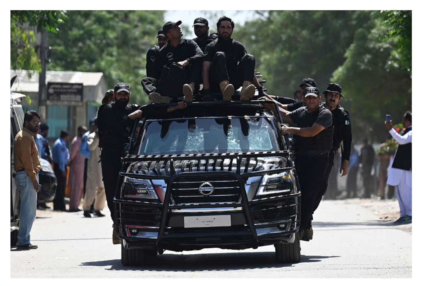
Photo above: Security personnel escort a car carrying former Prime Minister Imran Khan as he arrives at the high court in Islamabad on May 9, 2023, following his arrest.

enabled by behind-the-scenes military influence. Like other Pakistani leaders before him, Khan lost favor<sup>5</sup> with the all-powerful military, four years into his tenure, due to increasingly ad hoc decision making, including his attempt to influence the appointment of the country's new intelligence chief. Without the military's backing, Khan's opponents threw him out of power via a no-confidence vote in parliament in April 2022. Khan then kept ratcheting up pressure on the "establishment" — a term<sup>6</sup> often