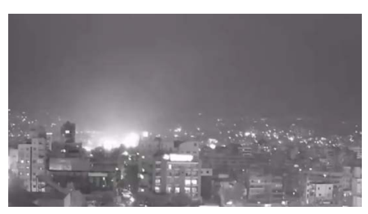
Right: From a video documenting the moment of the explosion (al-Jazeera, January 2, 2024). Left: The building where the attack occurred (January 2, 2024; al-Manar, January 3, 2024)