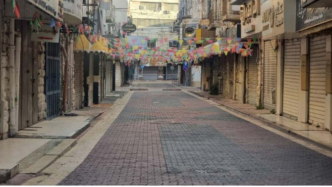
Right: General strike in Nablus. Left: General strike in Ramallah (QudsN X account, January 3, 2024)