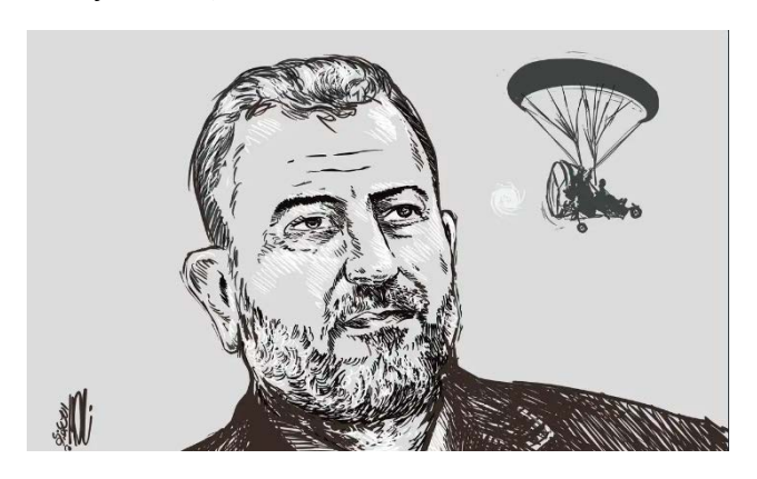
The al-Quds meme (al-Quds, January 3, 2024)

The east Jerusalem daily al-Quds, which is affiliated with the PA, published a meme of al-'Arouri looking up and a paraglider, indicating that he had been involved in the terrorist attack and massacre on October 7, 2023, and the launching of the paragliders into Israeli territory (al-Quds, January 3, 2024).