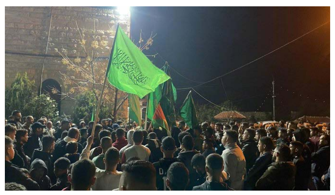
Right: The gathering in front of the al-'Arouri family home in 'Aroura (al-Qastel website X account, January 2, 2024). Left: The mass march in the village (Palestinian TV Telegram channel, January 2, 2024)

The Fatah movement in Judea and Samaria announced a general strike on January 3, 2024 as a sign of mourning (al-Ghad TV channel, January 2, 2024). The Palestinian organizations called for igniting the ground under the feet of the "occupation" in response (Shehab website, January 2, 2024).