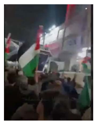
Demonstration of support for Hamas and al-'Arouri in al-Zarqa in Jordan (al-Fajr, January 2, 2024)