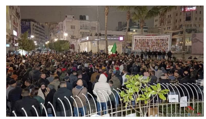
Right: A mass march in Ramallah (al-Araby al-Jadeed, January 2, 2024). Left: A procession in the Jenin refugee camp (Safa's X account, January 2, 2024)