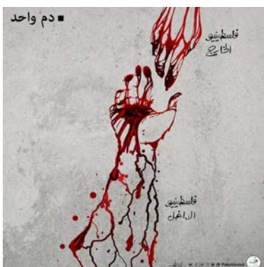
Cartoons by Alaa' al-Laqta (Alaa' al-Laqta's Facebook page, January 2-3, 2024)