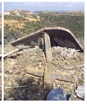
Results of the Israeli Air Force attack in Deir Aames 2024