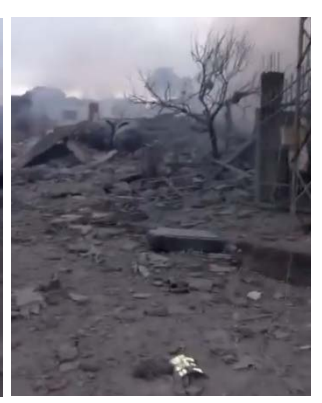
The results of Israeli Air Force attacks in Kafr Kila