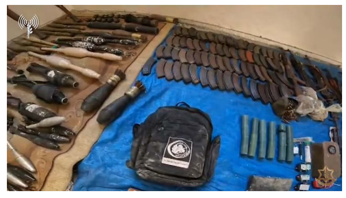
The weapons found by the forces (IDF spokesperson, January 25, 2024)