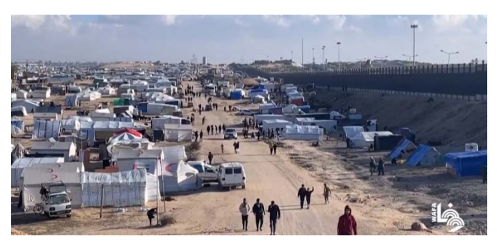
Residents set up a tent camp near the Gaza Strip-Egypt border

In response to the demonstrations by the families of the hostages in Israel near the Kerem Shalom Crossing and their attempt to block the entry of aid to the Gaza Strip, the PA foreign ministry claimed Israel was ignoring UN warnings about the humanitarian situation in the Gaza Strip and was allowing the families of the hostages to block the Kerem Shalom Crossing, thereby preventing urgent aid supplies to enter for four consecutive days. The foreign ministry also called it "contempt for the decisions of the International Court of Justice" and a denial of the basic needs of all the residents of the Gaza Strip (PA foreign ministry X account, January 27, 2024).