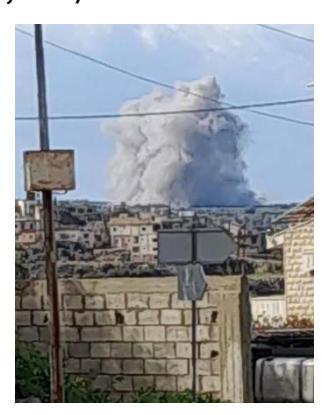
Right: The Israeli Air Force attacks in Houle. Left: The Israeli Air Force attacks Zibqin and Majdal Zoun