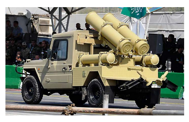
Right: A double barrel Falaq-1 rocket launcher mounted on an ATV (al-Manar, January 26, 2024). Left: A double-cannon launcher and its technical specifications (al-Manar, January 26, 2024)