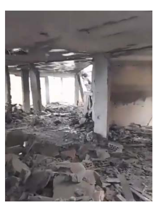
The results of the Israeli Air Force attacks in al-Hiyam attack

In the documentation of an attack on a building in Deir Aames, about 12 kilometers (about 7.5 miles) north of Shtula, a person can be heard in the background saying that a three-story building was completely destroyed (Fouad Khreiss' X account, January 27, 2024).