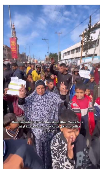
The demonstration in Khan Yunis (Right: QUDSN X account. Left: Sputnik website in Arabic X account, January 25, 2024)

The Israeli Coordinator of Government Activities in the Territories (COGAT) issued pictures of displaced Palestinian persons who passed through the safe crossing from Khan Yunis to the al-Mawasi area, chanting "The people want to overthrow Hamas" (COGAT Facebook page in Arabic, January 27, 2024).