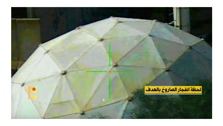
The target at the Dvoranit post, as seen from the missile camera, only one second before it was hit (Hezbollah combat information Telegram channel, January 25, 2024)

Hezbollah provided technical details and photos of a Falaq-1 heavy rocket and its launcher, which it claimed it had used in an attack on the Ma'ale Golani camp (on the slopes of Mount Hermon) on January 26, 2024. According to Hezbollah, the rocket has a maximum range of ten kilometers (six miles), can reach a maximum height of 3,500 meters, weighs 113 kgs (about 250 pounds) with a warhead weighing 50 kgs (110 pounds), is 1.32 meters long and has a diameter of 240 mm. The rocket is launched from a double-barrel [or four-barrel] launcher mounted on top of an ATV. It can also be used to attack naval targets (al-Manar, January 26, 2024).