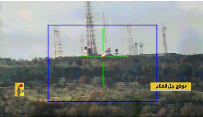
Right: The target at the Dvoranit post, as seen from the missile's camera before launch. Left: The target a few seconds before it was hit (Hezbollah combat information Telegram channel, January 25, 2024)