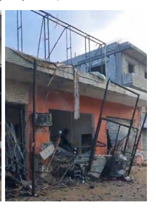
The results of the Israeli Air Force attack Tayr Harfa-al-Jabin