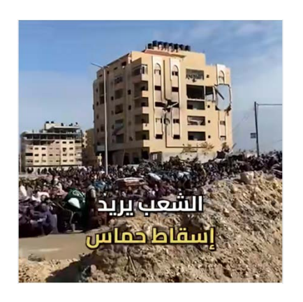
Right: A picture from a video published by al-Arabiya TV (COGAT Facebook page in Arabic, January 27, 2024). Left: Nabas website, January 27, 2024)