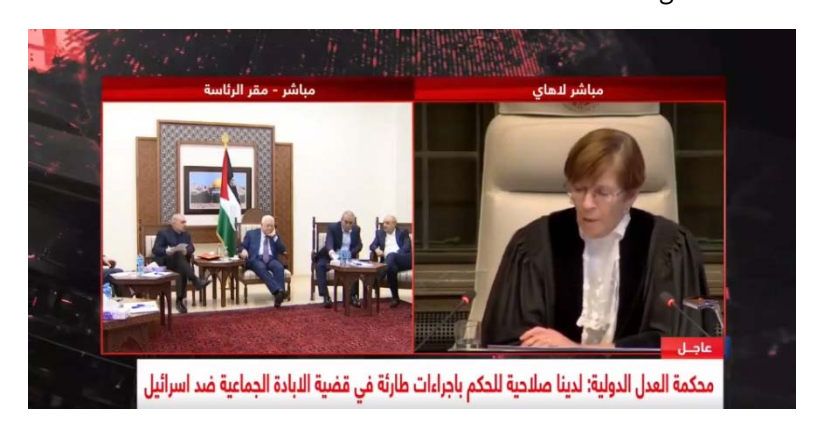
Mahmoud Abbas watches from his office in Ramallah the ruling of the ICJ in The Hague

The court's ruling was favorably accepted by the Palestinians, but some criticized the court's failure to call for an immediate ceasefire.