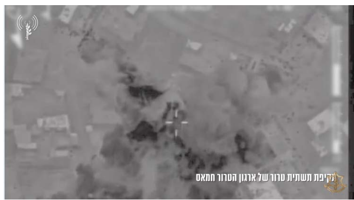
Attack in Khan Yunis (IDF website, January 27, 2024)