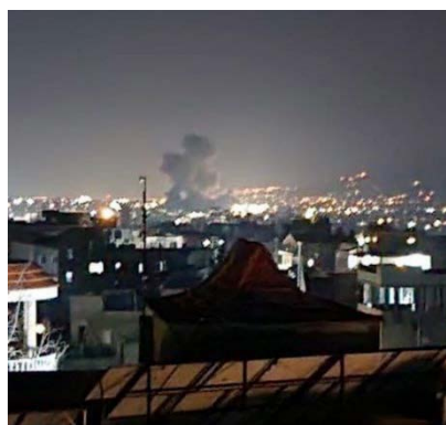
Attack in the Baalbek area (al-Manar, March 12, 2024)

► Hezbollah reported several airstrikes in the vicinity of Baalbek and which injured six people (al-Mayadeen, March 12, 2024). Hezbollah later reported a death and several wounded in the attack (al-Manar, March 12, 2024). It was also reported that the attack targeted a building in the town of Ansar south of Ba'albek, where a center of the Lebanese ministry of industry operated.