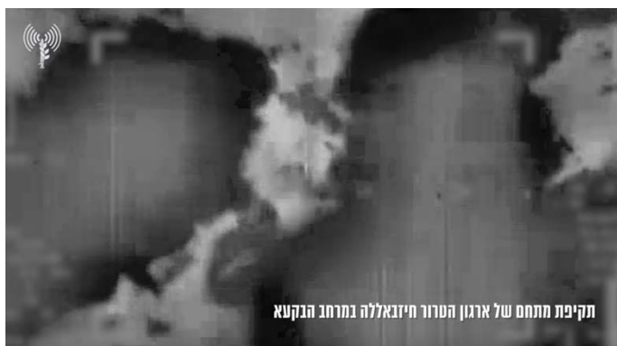
תקיפת מתחם של ארגון הטרור חיזבאללה במרחב הבקעא