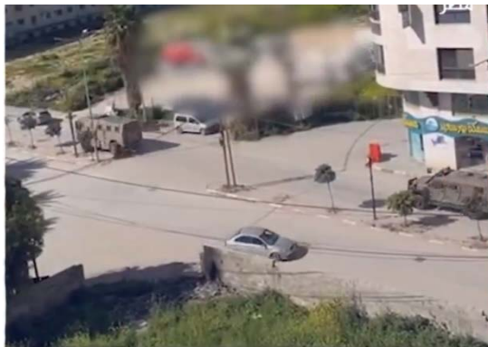
Right: Israeli forces entering the Jenin refugee camp (al-Jazeera TV X account, March 12, 2024).