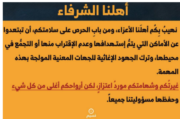
(Nasseem Center, March 12, 2024)

► Following the IDF attacks, Hezbollah channels issued a call to the entire Lebanese public, stating, "Honorable people, we beg you, our respected people, to preserve your safety, please stay away from the places that were attacked, do not approach them, do not hold gatherings near them. Please, leave the efforts to the relevant parties entrusted with the task. Your nobility is a source of pride, but your life is more important than anything and it is the responsibility of all of us to protect it" (Nasseem Center, March 12, 2024)