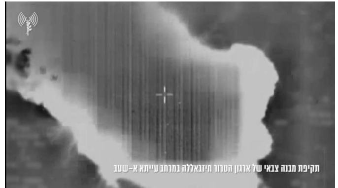
Right: Attack in the Aita al-Sha'ab area. Left: Attack in the Naqoura area (IDF spokesperson, March 11, 2024)