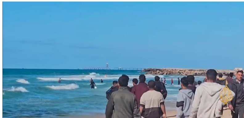
Right: Beit Lahia residents enter the sea to look for humanitarian aid which was dropped in the northern Gaza Strip. Left: Gazans wait on the beach to find the aid packages (al-Jazeera YouTube channel, March 11, 2024)

► Mohammed bin Zayed, president of the UAE , spoke with Ursula von der Leyen, president of the European Commission . They discussed the importance of establishing the sea port to transfer humanitarian aid to the Gaza Strip. Bin Zayed said they were interested in cooperating with the EU to help the Palestinians, adding that a ceasefire had to be reached immediately and the expansion of the conflict avoided (UAE News Agency, March 12, 2024). In a conversation with Nikos Christodoulides, the president of Cyprus , Mohammed bin Zayed said that land, sea and aerial "humanitarian crossings" should be opened immediately to help