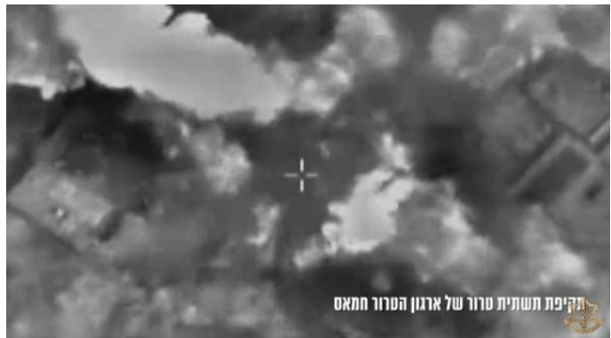
Right: Attack on a Hamas terrorist facility. Left: Attack on a munitions warehouse