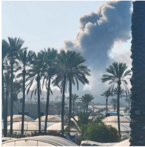
Palestinian documentation of an IDF controlled explosion in Khan Yunis (Shehab X account, March 12, 2024)

► Northern and central Gaza Strip: IDF forces continued operations and with intelligence guidance, located a number of rocket launchers from which rockets were fired at Israel; the launchers were destroyed. In another incident, two rockets were fired at the fighters, who located the operatives and directed an Israeli Air Force aircraft to attack them (IDF spokesperson, March 12, 2024).