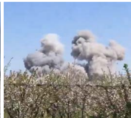
Attack on the Riyak-Ba'albek highway (Fouad Khreiss' X account, March 12, 2024)