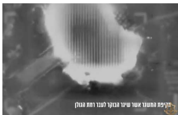
Attack on the rocket launchers (IDF spokesperson, March 12, 2024)

◆ On the morning of March 12, 2024 , a barrage of about 70 rockets was launched at the Golan Heights and the Upper Galilee. Hezbollah reported that they launched 100 Katyushas at the Israeli civil defense headquarters in Camp Kela, an artillery base in Yoav, and a number of artillery deployments. The objective of the attack was "to aid" the Palestinians and as a response to the Israeli attacks, the more recent of which was in the area of the city of Baalbek in which a civilian was killed (Hezbollah combat information Telegram channel, March 12, 2024). In response, Israeli Air Force fighter jets attacked three launchers from which the rockets were fired (IDF spokesperson, March 12, 2024). According to Lebanese reports, the IDF attacked Hasbaya and Kfar Houla.