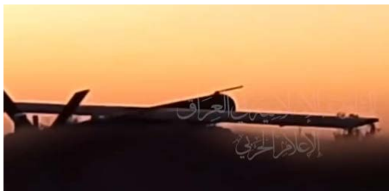
Launch of a UAV at Ben Gurion Airport