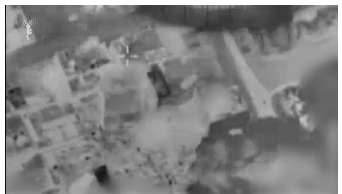
IDF attacks in the Hamad area (IDF spokesperson, March 11, 2024)