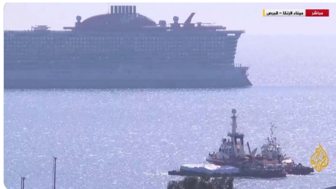
The Spanish aid ship en route from Larnaca to Gaza al-Jazeera TV X account, March 12, 2024)

► Al-Jazeera TV reported the Spanish aid ship Open Arms had sailed from the port of Larnaca en route the Gaza Strip with a cargo of 200 tons of food, mainly flour and rice. Technical issues delayed the ship's departure. At the moment it is not clear where the ship will dock to unload the aid, or if the matter has been coordinated with Israel (al-Jazeera TV X account, March 12, 2024).