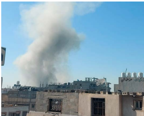
Israeli Air Force attack on the Zeitoun neighborhood in Gaza City (Shehab X account, March 12, 2024)