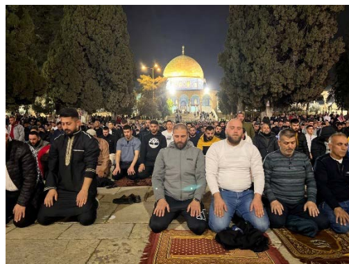
The prayer at al-Aqsa Mosque (right: Quds Press, March 11, 2024; left: FIMED website, March 12, 2024)

►As part of Israel's security measures, for the first time since 1967, barbed wire was erected on the wall near al-Aqsa Mosque near the Tribes Gate 3 area (Palestinian Authority Jerusalem district Facebook page, March 11, 2024).