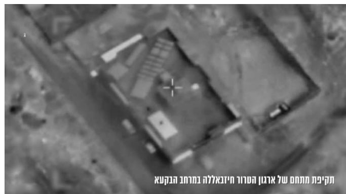
תקיפת מתחם של ארגון הטרור חיזבאללה במרחב הבקעא

Israeli Air Force attack deep inside Lebanon territory (IDF spokesperson, March 12, 2024)