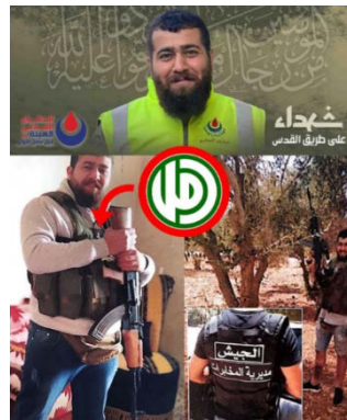
Amal operative who also worked as a paramedic