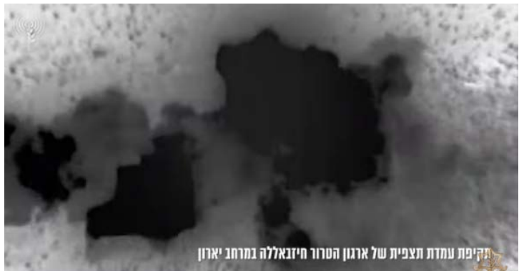
Right: Attack on a Hezbollah observation post in the Yaroun area. Left: Attack on a Hezbollah military structure in the Ghandouriyeh area