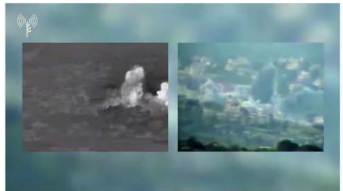
Right: Attack on a Hezbollah facility in Aita al-Sha'ab. Left: Attack on a building in al-Khiyam (IDF spokesperson, March 22, 2024)