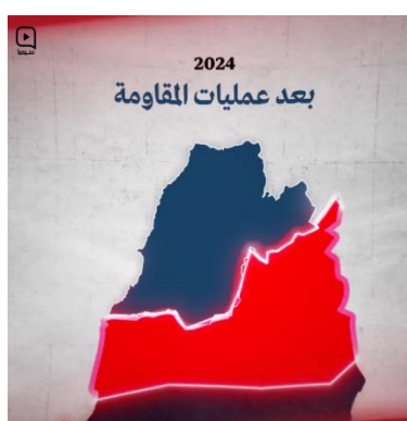
2024, according to Hezbollah's video (Simia Telegram channel, March 20, 2024)

► Hezbollah's Simia Telegram channel published a video called "The history of the security zone with Lebanon," which is intended to show Hezbollah's coming victory over Israel. It begins with a map objective the border between: "occupied Palestine" and Lebanon, and proceeds to the history of the security zone: 1978, "the first Israeli invasion" [Operation Litani]; 1985, "the second invasion" [the establishment of the security zone in Lebanon]; 2000, "after the liberation" [the withdrawal of the IDF from Lebanon]. The video ends with a map from 202, "after the war," which shows a projected "Lebanese control over the north of the State of Israel" (Simia Telegram channel, March 20, 2024).