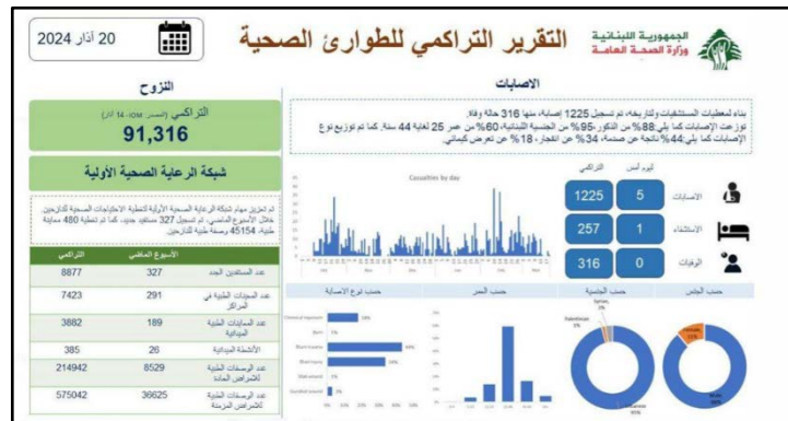
The report of the Lebanese ministry of health on the results of the fighting on the country's southern border (Lebanon News, March 20, 2024)

34% were injured as a result of an explosion and 18% were exposed to "chemical substances" (Lebanon News, March 20, 2024). The IDF spokesperson recently reported that Hezbollah was storing weapons and chemical substances in villages and towns in south Lebanon. It is possible that secondary explosions in warehouses containing the weapons and substances injured and/or killed civilians in south Lebanon.