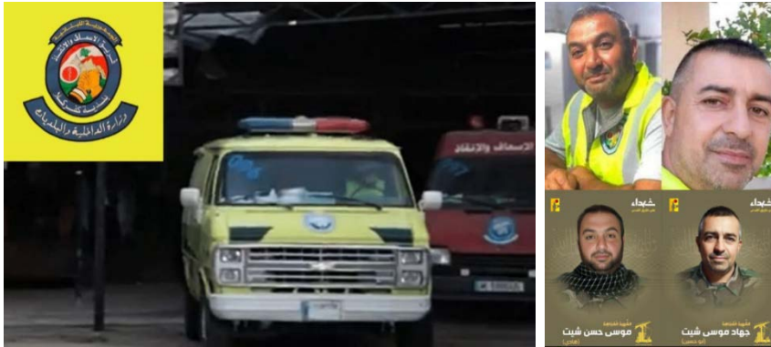
Right: Two Hezbollah terrorist operatives who also worked as paramedics. Left: The "civilian" ambulance used by Hezbollah and Amal in Kafrkila (Telegram channel of the IDF spokesperson in Arabic, March 19, 2024)