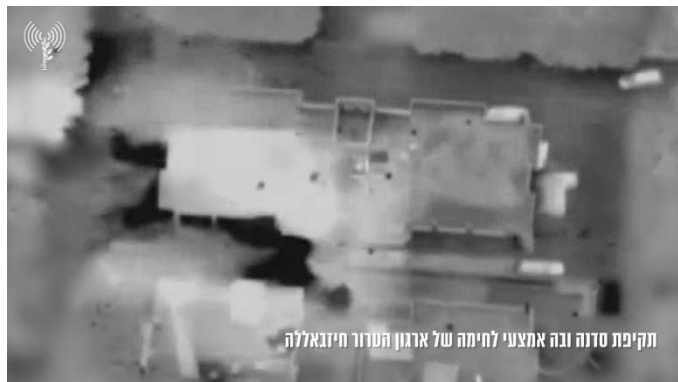
Right: Attack on the workshop in Ba'albek. Left: Attack in Ba'albek