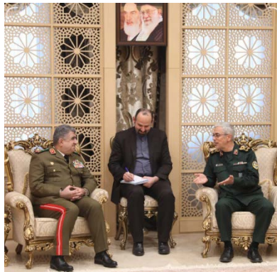
The Syrian minister of defense meets with the Iranian chief of staff (Tasnim, March 18, 2024)