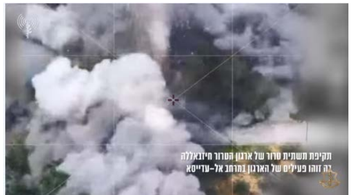
Right: Attack on Hezbollah facility in which operatives were identified in al-Adisa. Left: Attack on a Hezbollah military structure in Aita al-Sha'ab (IDF website, March 24, 2024)