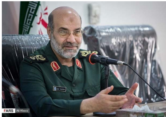
Mohammad Reza Zahedi (Fars, April 1, 2024)

►On April 1, 2024, Mohammad Reza Zahedi (Hassan Mahdavi), commander of the IRGC's Qods Force in Syria and Lebanon, was killed in an airstrike attributed to Israel on a building adjacent to the Iranian embassy in Damascus. Reza Zahedi, 64 years old, formerly served as commander of the IRGC's ground forces and deputy IRGC commander for operations.