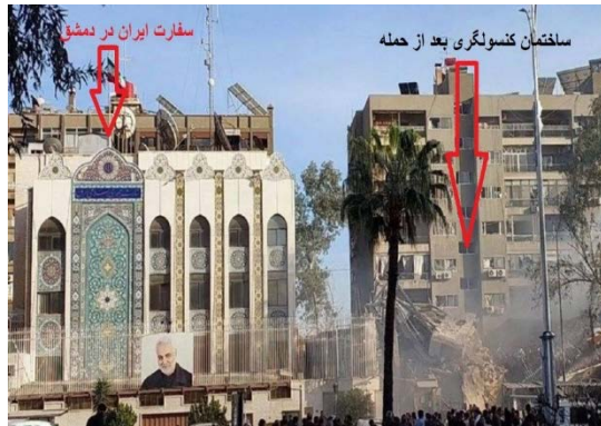
The building attacked near the Iranian embassy in Damascus, marked on the left side of the picture (Mehr, April 1, 2024)