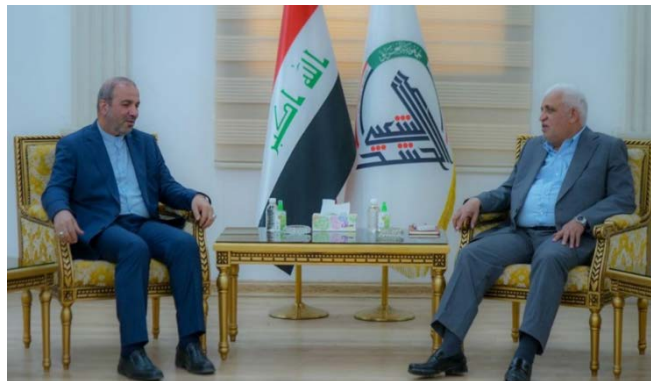
The Iranian ambassador to Baghdad meets with the chairman of the Popular Mobilization (al-Alam, March 27, 2024)