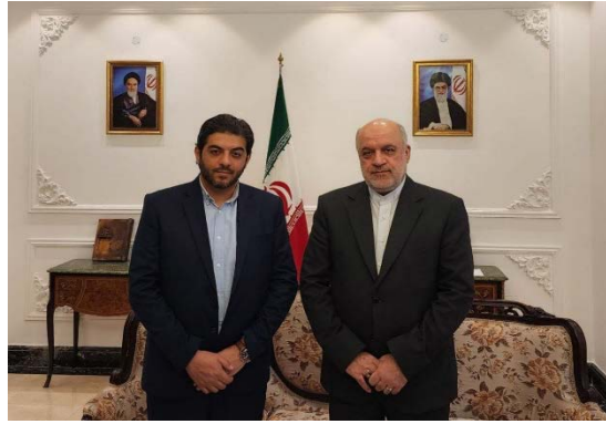
The Iranian ambassador to Beirut meets with the director of the Iraqi Nujaba militia's bureau