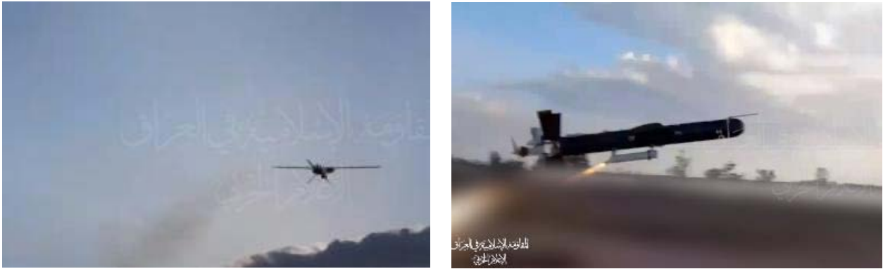
The launch of a UAV at the Tel Nof Airbase (Telegram channel of the Islamic Resistance in Iraq, April 2, 2024)