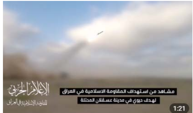
Right: Attacking a “vital target” in Ashkelon, apparently with an al-Arqaab missile Left: UAV being launched at Eilat