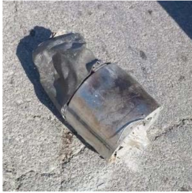
Part of the missile or UAV that landed in Jordan