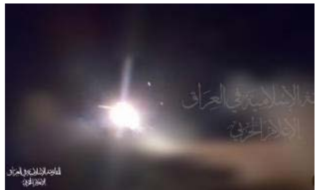
Right: UAV being launched at the Haifa refineries (Telegram channel of the Islamic Resistance in Iraq, April 6, 2024). Left: UAV being launched at the Ramat David base (Telegram channel of the Islamic Resistance in Iraq, April 4, 2024)

► In practice, except for the IDF Spokesperson’s report on April 9, 2024, referring to the identification of a suspicious aerial target that crossed into Israeli territory and was successfully intercepted (IDF website, April 9, 2024), no attacks reported by the Islamic Resistance were detected on the ground.