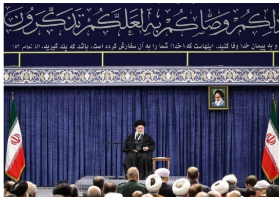
Khamenei meets with senior regime officials

▶ Iranian Supreme Leader Ali Khamenei, meeting with senior regime officials on the occasion of Ramadan on April 3, 2024, said the defeat of the “Zionist regime” in the Gaza Strip would continue and that its collapse was imminent. He noted that Israel’s desperate efforts, including the attack in Syria, would not save it from defeat, and it would certainly be dealt a blow for that operation. Khamenei added that Israel had suffered two major defeats: the first was the al-Aqsa Flood on October 7, 2023, from which it would not be able to recover, and the second was the defeat of the past six months, during which it failed to realize any of its goals despite the military, political, and economic support of the United States (website of the Supreme Leader of Iran, April 3, 2024).