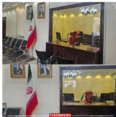
The new Iranian consulate in Damascus, inaugurated by the Iranian foreign minister (Tasnim, April 8, 2024)

▶ On April 8, 2024, Iranian Foreign Minister Hossein Amir Abdollahian arrived in Damascus for a visit, where he met with Syrian President Bashar Assad and Syrian Foreign Minister Faisal Mekdad. During the visit, Abdollahian also inaugurated a new consulate to replace the building damaged in an attack attributed to Israel in Damascus on April 1, 2024. In his meetings with the Syrian president and foreign minister, the Iranian foreign minister discussed the bilateral relations, developments in Gaza, and the attack in Damascus. Abdollahian stressed the need to implement the agreements signed between the two countries. At a press conference with his Syrian counterpart, the Iranian foreign minister said that the United States was responsible for the Israeli attack in Damascus and had to be accountable alongside Israel. He said Israel had failed in the war in the Gaza Strip and was unable to expand its aggression to other fronts (IRNA, April 8, 2024).