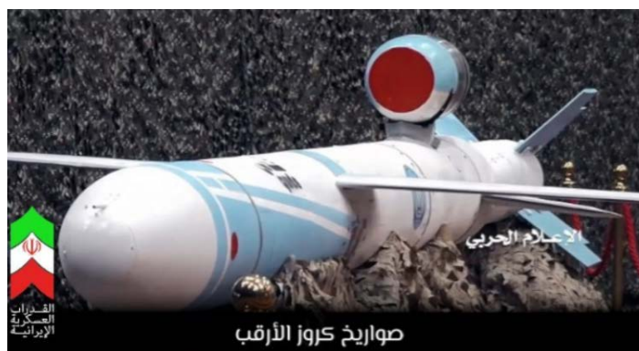
Right: Al-Arqaq cruise missile (hizbo313allaa X account, April 9, 2024) Left: Al-Arqaq cruise missile against the background of Haifa (al-Mayadeen, January 7, 2024)