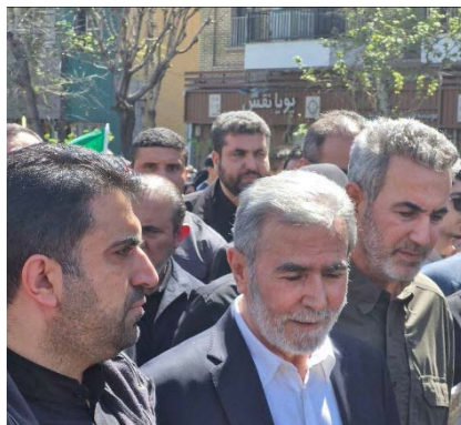
Ziad al-Nakhalah at the Jerusalem Day marches in Tehran (ISNA, April 5, 2024)

Hossein Salami, the IRGC commander, said in his speech during the Jerusalem Day rally in Tehran that the “Zionist regime” was currently between life and death, was living only thanks to artificial respiration by the United States, and its collapse was very close. He said the Zionists could not choose between war and life and that the only way they were facing was