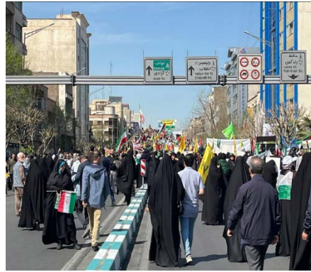
Right: World Jerusalem Day marches in Tehran (ISNA, April 5, 2024). Left: Esmail Qaani, commander of the IRGC's Qods Force, at the Jerusalem Day marches in Tehran (ISNA, April 5, 2024)