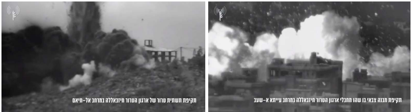
Right: Attack on Aita al-Sha'ab. Left: Attack in al-Khiyam (IDF spokesperson, April 10, 2024)