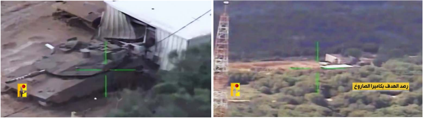
Right: An al-Mas anti-tank missile launched at the Dovev camp. Left: A few moments before the missile hit the tank (Hezbollah combat information Telegram channel, April 10, 2024)