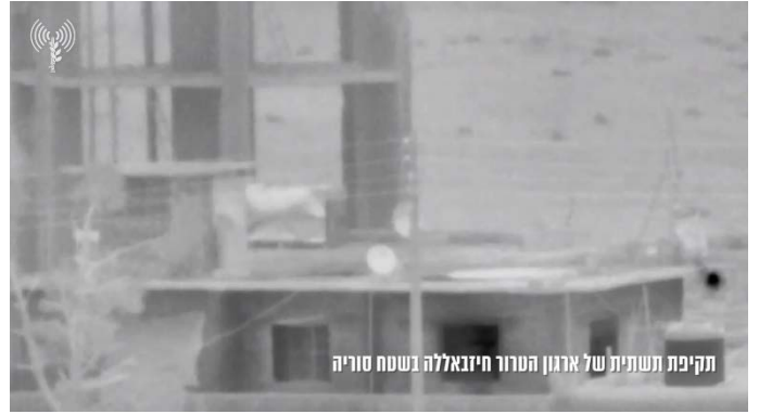
Attack in Syria in the al-Quneitra region