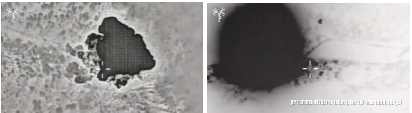
Attack in Raihan (IDF spokesperson, April 13, 2024)