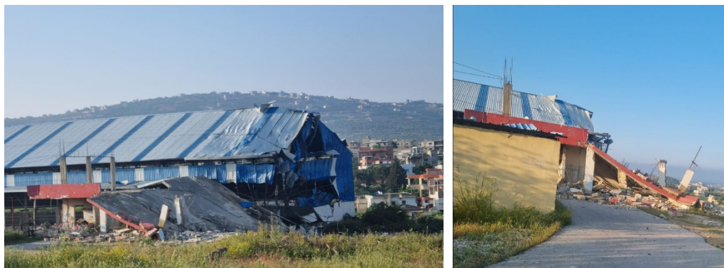
The destruction in the stadium