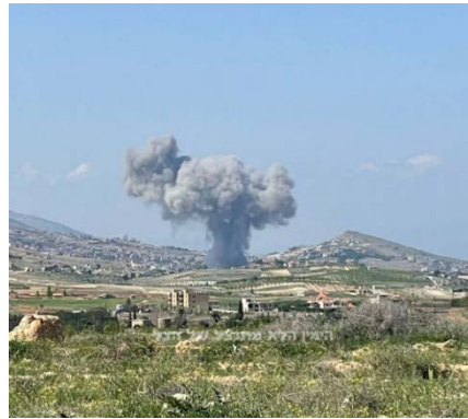
Attack in Nebi Sheet

► Lebanese media reported an aerial attack on a house in the south Lebanese town of Saddiqin on the night of April 14, 2024. Reportedly, the house was completely destroyed and dozens of nearby houses were heavily damaged. Nine people were injured and taken to hospitals in Tyre by the civil defense forces of the Scouts of the Islamic Message (Amal's youth movement) and the Islamic Health Authority. It was also reported that fighter jets carried out false attacks (by breaking the sound barrier in order to deter reactions) near villages in the Tyre district and in the coastal area (El Metn Online Facebook page, April 15, 2024). It was later reported that the attack in Saddiqin targeted a room located in the football stadium in the al-Masbah neighborhood (Saddiqin Facebook page, April 15, 2024).