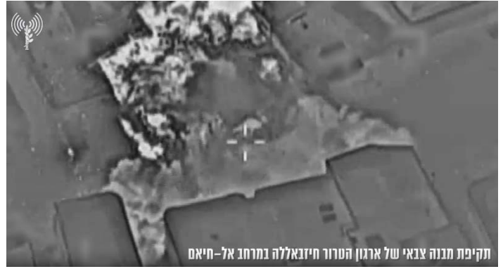
Attack in al-Khiyam. (Right: IDF spokesperson, April 14, 2024. Left: Fouad Khreiss' X account, April 14, 2024)