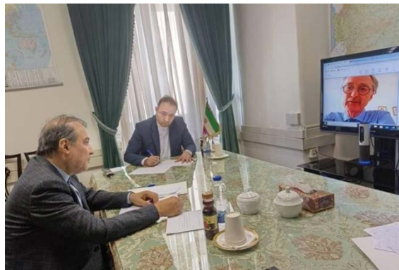
Virtual conversation between the Iranian deputy foreign minister and the UN secretary-general’s envoy for Syria (ISNA, April 30, 2024)

►Ali-Asghar Khaji, deputy foreign minister of Iran, held a virtual meeting with Geir O. Pedersen, the UN secretary-general’s envoy for Syria, to discuss the latest developments in Syria and the settlement process in the country. Khaji said “the crimes of the Zionist regime against the Palestinians and the continuation of the attacks in Syria and Lebanon” were exacerbating the regional crisis (ISNA, April 30, 2024).