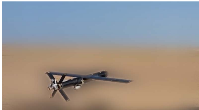
Right: Aircraft launched at Haifa. Left: Launch at Eilat