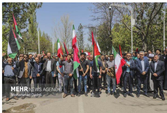
Iranian students and lecturers demonstrating in solidarity with demonstrations of pro-Palestinian students around the world (Mehr, April 28, 2024)

►Nasser Kanani, the spokesman for the Iranian Foreign Ministry, praised the pro-Palestinian demonstrations in the United States and Europe, saying that the calls against the occupation of Palestine and the genocide in the Gaza Strip and for the liberation of Palestine had now become a global demand and that the sound of the crushed bones of world Zionism was louder than ever. Kanani condemned the suppression of pro-Palestinian student protests at universities in the United States and Europe, saying that the collapse of the occupation pillars in Palestine could not be stopped (Kanani's X account, April 28, 2024). Meanwhile, demonstrations were held by students and lecturers throughout Iran in solidarity with the pro-Palestinian student demonstrations around the world (Mehr, April 28, 2024).