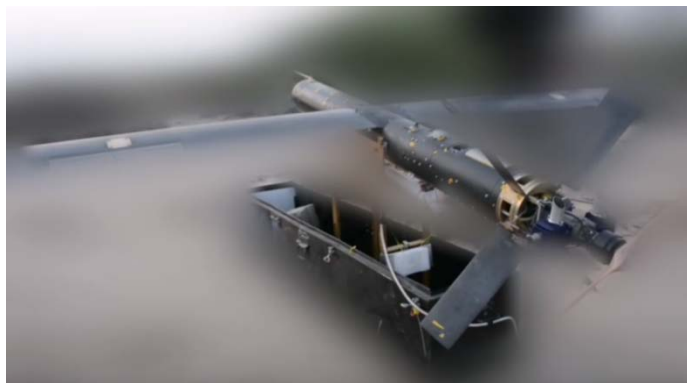
Launch at the Ovda base (Telegram channel of the Islamic Resistance in Iraq, April 19, 2024)