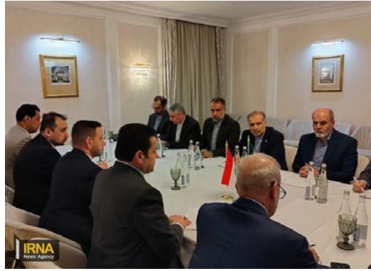
Meeting of the secretary of the Iranian Supreme National Security Council with the Iraqi national security advisor (IRNA, April 23, 2024)