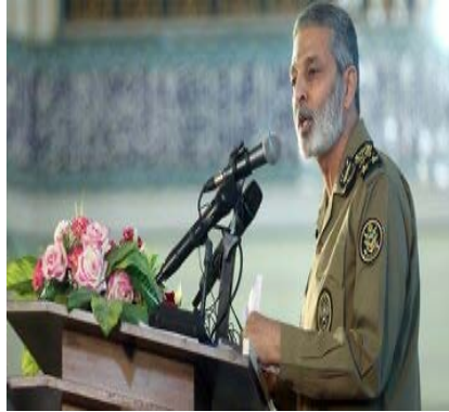
Chief of staff of the Iranian army (Khabar Online, April 25, 2024)

Abdolrahim Mousavi, the commander of the Iranian army, also threatened Israel, saying Iran was not interested in war, but would respond to any aggression more forcefully than in the past (Khabar Online, April 25, 2024).