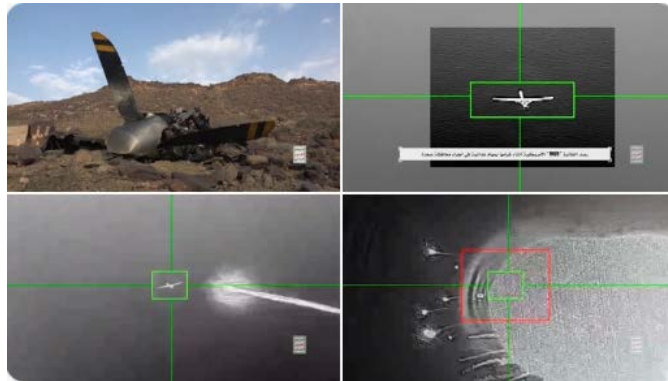
Images from a video documenting the interception of the US drone on April 26, 2024

indeed crashed in Yemen. The source said the incident was being investigated (AP, April 28, 2024).