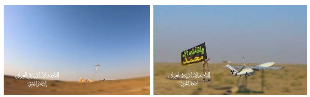
The UAV launched at the Olvia