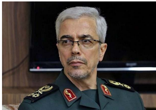
Iranian Chief of Staff Mohammad Bagheri

► Mohammad Bagheri, chief of staff of the Iranian armed forces, said at a ceremony to introduce the new deputy chief of staff that the “Zionist regime” is in existential danger and is therefore determined to continue its crimes. He noted that even the Americans are hesitant whether to support Israel in view of the dangerous conditions in which it finds itself. Referring to the killing of Ismail Haniyeh in Tehran, Bagheri said Iran would definitely respond in a calculated manner to the “crimes of the Zionist regime”.