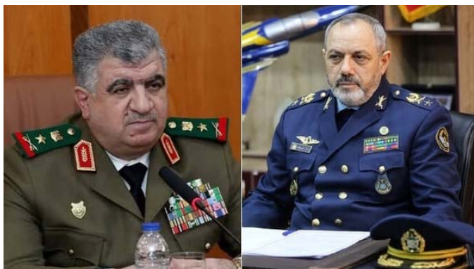
The defense ministers of Iran (right) and Syria (Fars, September 1, 2024)