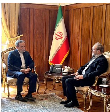
The Iranian foreign minister meets with Hezbollah’s representative in Tehran