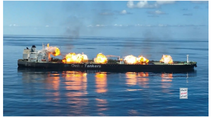
Photos from the video that allegedly documented the raid and the detonation of IEDs aboard the oil tanker Sounion (the Houthi armed forces' media arm X account, August 29, 2024)