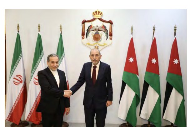
The meeting of the foreign ministers of Iran and Jordan

• During his visit to Egypt, Araghchi met with President Abdel Fattah el-Sisi and his Egyptian counterpart, Badr Abdelatty. Araghchi expressed Iran's appreciation for Egypt's efforts to achieve stability and security in the region (Iranian Foreign Ministry website, October 17, 2024).