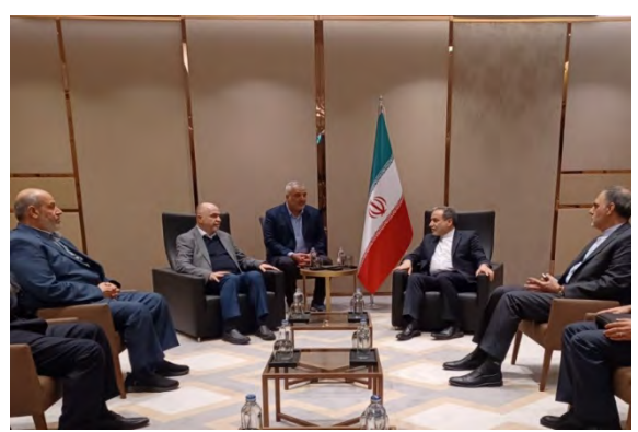
The Iranian foreign minister meets with a delegation of senior Hamas figures

• During his visit to Kuwait, Araghchi said Iran wanted a ceasefire in the entire region, both in the Gaza Strip and Lebanon, and that there could be different ways to achieve a ceasefire. He noted that Iran is in contact with countries working on this issue and that his special representative is in Beirut and meets daily with all sides in Beirut. He said decisions regarding the ceasefire are made by the Lebanese and the Palestinians themselves, and that Iran is only trying to help them (Tasnim, October 22, 2024).