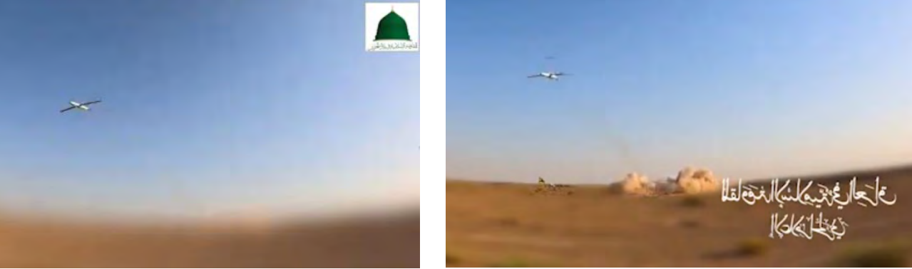
The original video (right) and the fabricated one (left) (Bilal al-Bukhari's X account, October 26, 2024)

▶ It was claimed that it was a fictitious organization and that a video circulated on social media purportedly documenting the launch was actually a video released on July 15, 2024, by the Islamic Resistance in Iraq and digitally edited (Bilal al-Bukhari's X account, October 26, 2024).