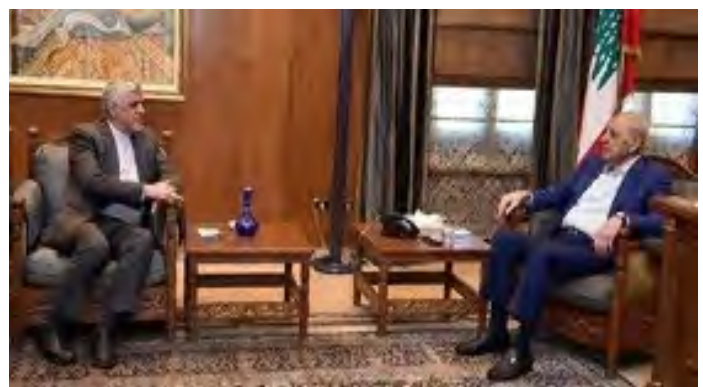
The representative of the Iranian foreign minister meets with the speaker of the Lebanese parliament