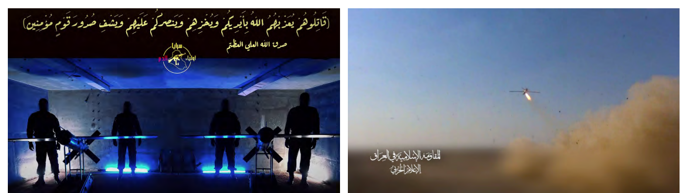
Right: Launching a drone at southern Israel (Islamic Resistance in Iraq Telegram channel, October 24, 2024). Left: Saraya Awliya al-Dam operatives preparing to launch drones (Saraya Awliya al-Dam Telegram channel, October 26, 2024)

the Saraya Awliya al-Dam militia issued 13 claims of responsibility for 14 attacks against targets in Israel, all using drones (Saraya Awliya al-Dam Telegram channel, October 15-30, 2024). The IDF Spokesperson reported the interception of eight drones that made their way into Israeli territory or penetrated Israeli airspace. In addition, another drone fell in the Red Sea before entering Israel, and four drones that penetrated Israel fell in open areas. There were no casualties (IDF Spokesperson, October 15-30, 2024).