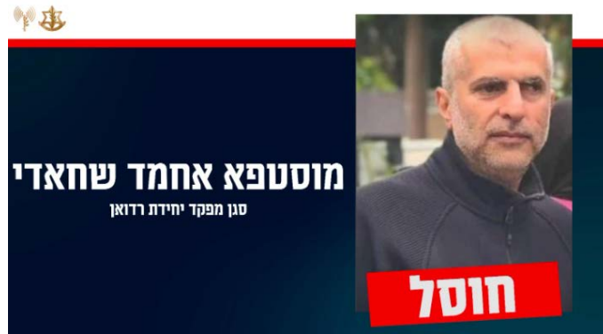
Shahadi's "ID card" (IDF spokesperson, November 2, 2024)