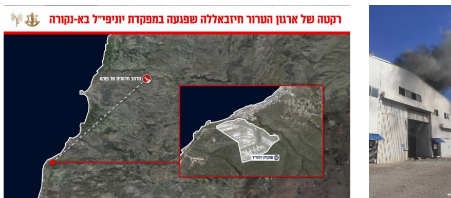
Right: The strike on the UNIFIL headquarters (UNIFIL's Telegram channel, October 29, 2024). Left: The trajectory of the rocket that struck the headquarters (IDF spokesperson, October 29, 2024)

► Najib Mikati, prime minister of the Lebanese interim government, requested Foreign Minister Bou Habib to monitor the investigation into the rocket strike on the Austrian UNIFIL battalion's headquarters. Additionally, Mikati condemned the "Israeli strike" on UNIFIL forces and praised the role the forces play in maintaining security and stability in south Lebanon (al-Nashra, October 31, 2024).