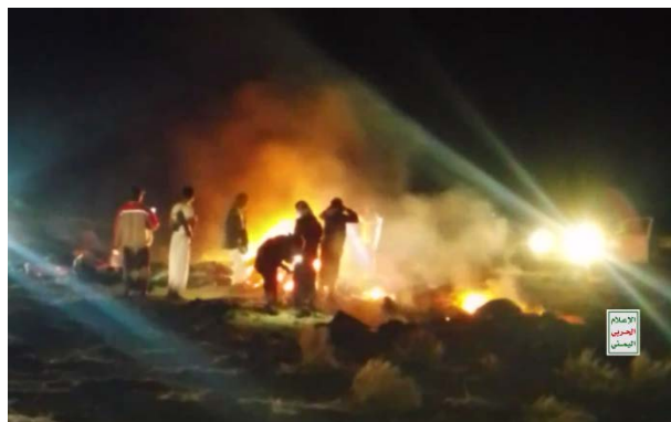
The scene of the American drone crash

► On November 8, 2024, Yahya Saria said Houthi forces intercepted a US MQ-9 drone while it was in the airspace of Yemen’s Houthi-controlled al-Jawf Governorate. According to Saria, this is the 12th MQ-9 drone intercepted by the Houthis since the beginning of the war in the Gaza Strip in October 2023 (Yahya Saria’s X account, November 8, 2024).