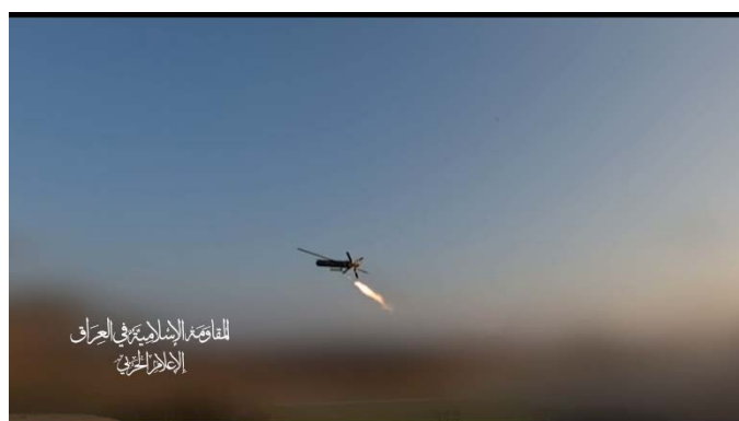
Right: A drone launched at a “military target” in southern Israel (Islamic Resistance in Iraq Telegram channel, November 6, 2024). Left: A drone being launched by Saraya Awliya al-Dam (Saraya Awliya al-Dam Telegram channel, November 10, 2024)

► A “source close to the militias” claimed that they had succeeded in producing a new generation of drones capable of penetrating Israel’s three most advanced air defense systems.