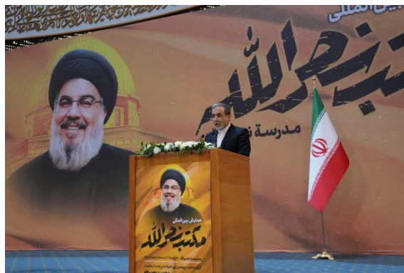
The Iranian foreign minister at a conference commemorating Nasrallah (Iranian Foreign Ministry website, November 9, 2024)

◆ Foreign Minister Abbas Araghchi said Nasrallah was a symbol of resistance and courage not only for Lebanon but for the entire Muslim world and freedom-loving peoples. He said Nasrallah had succeeded in changing the equation in the region and turning the “resistance” into an influential factor in the regional and even global balance of power. Araghchi added that the “Zionist regime” not only endangers regional stability and security but poses a serious challenge to the world order. The foreign minister also said that the international community must fulfill its responsibility and act to stop Israel’s “crimes,” and warned that if the war expands, its consequences will not be limited to the region. He stressed the need to achieve a ceasefire in Lebanon, Iran’s support for the “oppressed peoples of the region,” and the right of the “resistance” to act against the occupation and “aggression” (Iranian Foreign Ministry website, November 9, 2024).