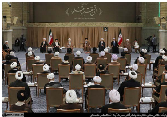
The Supreme Leader of Iran meets with members of the Assembly of Experts (Supreme Leader's website, November 7, 2024)