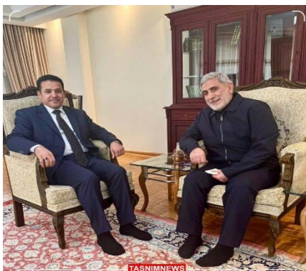
The Qods Force commander meets with Iraq's national security advisor