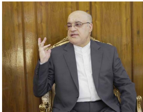
The Iranian ambassador to Lebanon