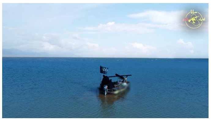
Saraya Awliya al-Dam operatives launch a drone from a boat

A source close to the militias" said a decision had been made to increase the attacks against Israel and that all the special units had been ordered several weeks ago to begin logistical preparations to improve capabilities at all levels. According to him, four to five attacks against the "occupying entity" within 24 hours are the beginning of a course that will intensify as time passes, and in the near future, the escalation will continue. He added that the "resistance" had not yet used all the weapons at its disposal and that decisions would be made before the events in real time and according to the policy outlined by the leaders (baghdadtoday.news, November 14, 2024).