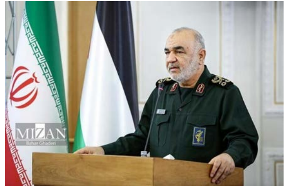
The commander of the IRGC (Mizan, November 14, 2024)

• IRGC commander Hossein Salami stressed that Iran would definitely take revenge on Israel and deal it painful blows (Mizan, November 14, 2024).