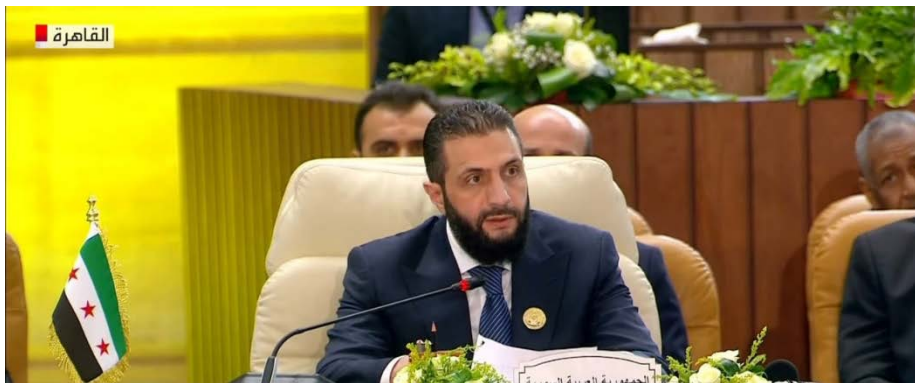
Al-Sharaa speaking at the Arab summit

► On March 4, 2025, al-Sharaa arrived in Egypt for his first visit, to participate in the Arab emergency summit on the Palestinian issue. On the sidelines of the summit he met with Egyptian President Abdel Fattah el-Sisi, Lebanese President Joseph Aoun, Palestinian Authority chairman Mahmoud Abbas, UN Secretary General António Guterres, and European Council President António Costa. Speaking before the summit meeting, he thanked Arab leaders for their support of Syria and said the country's return to the Arab League was a historic moment which reinforced Arab unity and solidarity. Relating to the Palestinian issue, al-Sharaa accused certain actors of attempting to redraw "new geographical maps" at the expense of Palestinian blood, stating that calls for the uprooting of Palestinians were a "stain on humanity" and a threat to the Arab nation, urging all Arabs to stand against the plans.