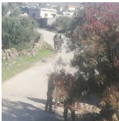
IDF forces in the village of al-Rafid (Daraa24 X account, February 28, 2025)

► On March 3, 2025, the IDF carried out an airstrike on a site where weapons belonging to the previous Syrian regime were stored, in the Qardaha area near Latakia on the Syrian coast (IDF spokesperson, March 3, 2025). Syrian media reported that fighter jets of the Israeli "occupation" carried out airstrikes in the Tartus area, with no casualties reported (SANA, March 3, 2025). On March 5, 2025, an Israeli airstrike reportedly targeted a weapons depot of the 155th Missile Brigade near the village of Hala, in the rural area northeast of Damascus. No casualties were reported (Syrian Observatory for Human Rights, March 5, 2025).