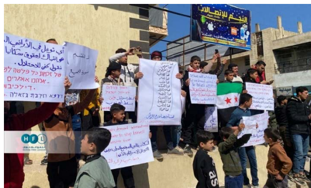
Protesting Israeli activity in southern Syria (FREE HORAN Facebook page, February 28, 2025)

◆ Hundreds of residents of the Druze town of Khirbet Ghazaleh, north of Daraa, protested Israel's involvement in Syria. One of the signs, written in Hebrew, read, "Any invasion of Syrian lands is a violation of the rights of its inhabitants; we say no to occupation!" (FREE HORAN Facebook page, February 28, 2025).