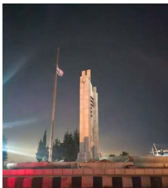
Israeli flag in al-Anqoud Square, al-Suwayda (ivarmmm's X account, March 3, 2025)

On March 3, 2025, a picture of an Israeli flag being raised in the Druze city of as-Suwayda was posted to the social media (ivarmmm's X account, March 3, 2025). In a video posted later, local residents were photographed lowering the flag and then burning it (Syria TV, March 3, 2025). It is unclear who was responsible for raising or burning the flag.