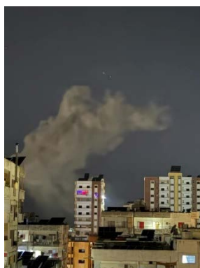
Smoke following airstrikes in the Tartus area (Syrian TV, March 3, 2025)

► On March 3, 2025, the IDF carried out an airstrike on a site where weapons belonging to the previous Syrian regime were stored, in the Qardaha area near Latakia on the Syrian coast (IDF spokesperson, March 3, 2025). Syrian media reported that fighter jets of the Israeli "occupation" carried out airstrikes in the Tartus area, with no casualties reported (SANA, March 3, 2025). On March 5, 2025, an Israeli airstrike reportedly targeted a weapons depot of the 155th Missile Brigade near the village of Hala, in the rural area northeast of Damascus. No casualties were reported (Syrian Observatory for Human Rights, March 5, 2025).