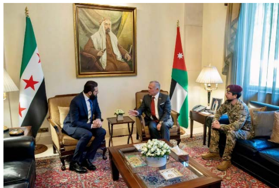
Al-Sharaa (left) and the king of Jordan

► On February 26, 2025, Syrian President Ahmed al-Sharaa paid his first visit to Jordan, where he met with King Abdullah II and Crown Prince Hussein bin Abdullah. They discussed expanding cooperation in trade, energy and water, and increasing coordination on border security. The king of Jordan condemned Israeli strikes in Syria and expressed support for Syria's sovereignty, unity and territorial integrity. He also pledged to assist in Syria's reconstruction to make it possible for refugees to return (Syria TV, February 26, 2025).