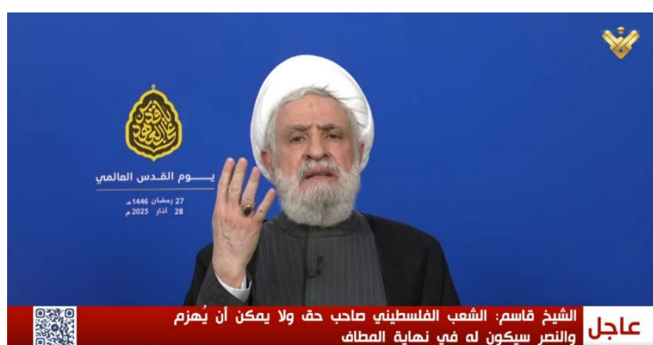
Na'im Qassem delivers his World Jerusalem Day speech (al-Manar, March 29, 2025)

◆ Tensions on the Syria-Lebanon border: He claimed there were parties trying to blame Hezbollah for attacks targeting Syrian security forces along the border. He said, "It is not true, we have no connection to the events."