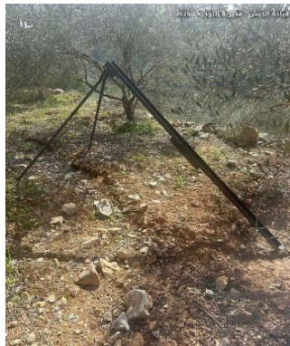
The improvised launcher from which the rockets were fired at Kiryat Shmona (Lebanese army X account, March 29, 2025)

► The Lebanese army stated that its forces had located the rocket launch site in the Qaaqaait al-Jisr-Nabatieh area and were investigating who was responsible for the rocket fire. The army claimed the "Israeli enemy" escalated its attacks under the "pretext" that two rockets had been fired from Lebanon, claiming that the attacks hit various areas in the south and reached as far as Beirut, a blatant violation of Lebanon's sovereignty and the ceasefire agreement (Lebanese army X account, March 28, 2025).