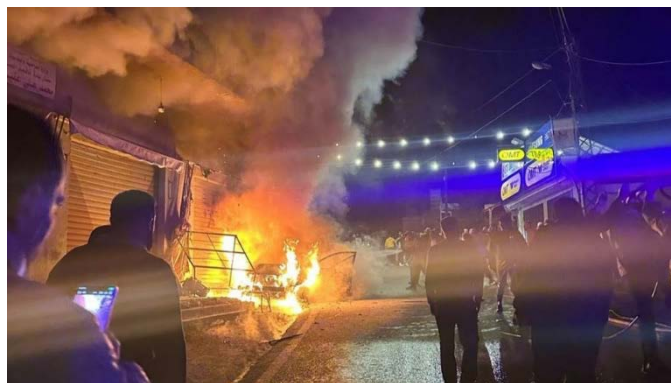
The vehicle of Hezbollah's anti-tank missile array commander after the attack (al-Madan, March 24, 2025)

► Last week the IDF continued its operations against Hezbollah's efforts to rebuild its military capabilities and continue terrorist activity in south Lebanon, in violation of the ceasefire agreement which prohibits a Hezbollah presence south of the Litani River. Several Hezbollah terrorist operatives and senior field commanders were eliminated, including the commander of the anti-tank missile array for the southern front and a battalion commander in the Radwan Force (IDF spokesperson, March 24–31, 2025).