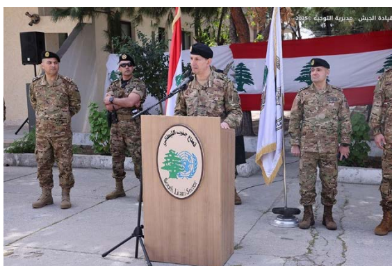
The commander of the Lebanese army visits south Lebanon

► Rodolph Haykal toured south Lebanon and met with officers and soldiers. He noted the army's role in defending Lebanon and its people, adding that the army was making tremendous efforts to carry out its missions in the south. He said they were committed to implementing Resolution 1701 and the ceasefire without delay, in accordance with the directives of President Aoun and the commitment of the Lebanese government, and to cooperate and coordinate missions with UNIFIL. He claimed the only obstacle to the final completion of the Lebanese army deployment and the consolidation of the ceasefire was the presence of the "Israeli enemy" at occupied positions and points in Lebanon, in addition to its repeated attacks. He added that firing rockets from Lebanon at Israel served the "enemy," the army was conducting investigations to identify those responsible, and had arrested several suspects (Lebanese army X account, March 29, 2025).