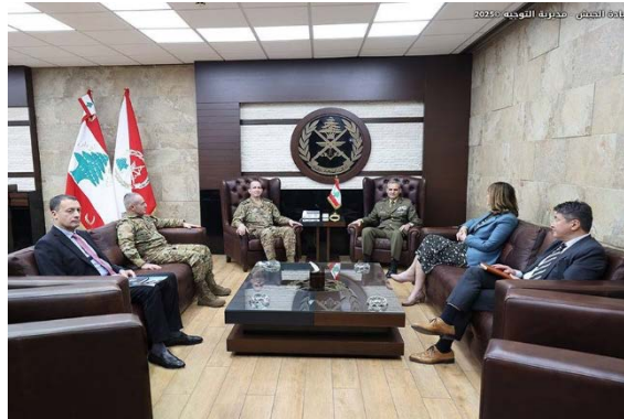
The UNIFIL commander meets with the Lebanese defense minister and the commander of the Lebanese army (UNIFIL Telegram channel, March 26, 2025)

redeployment in the south of the country in order to restore security and stability (UNIFIL Telegram channel, March 26, 2025).