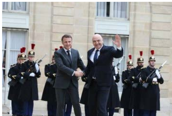
Lebanese President Aoun and French President Macron at the Élysée Palace in Paris