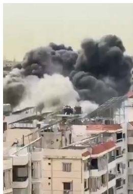
IDF strike in Beirut (March 28, 2025)

in the al-Hadath neighborhood of Dahiyeh al-Janoubia in Beirut, which the IDF reported had served as a storage facility for UAVs of Hezbollah's Aerial Unit 127. It was the first attack on Beirut since the ceasefire went into effect on November 27, 2024. Before the attack the IDF issued a warning to evacuate the area (IDF spokesperson, March 24–31, 2025).