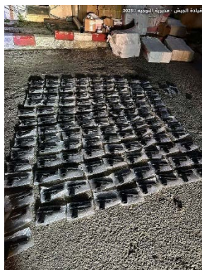
Weapons seized by the Lebanese army on the Syrian border (Lebanese army X account, March 24, 2025)