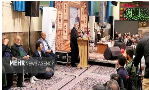
The Qods Force commander (Mehr, April 9, 2025)

► Gholam-Reza Soleimani, the commander of the Basij forces, declared at a conference in Tehran that “we speak proudly of Palestine and are proud of its existence” and that it will not be long before it is liberated. He noted that the “crimes of the Zionists” are being committed with the support of the Western powers and that people all over the world have woken up and are now thinking about how to eradicate the evil power of Zionism and cleanse the world of its existence. He added that thanks to the Islamic Revolution, humanity today sees Palestine as the central issue in the world (snn.ir, April 15, 2025).