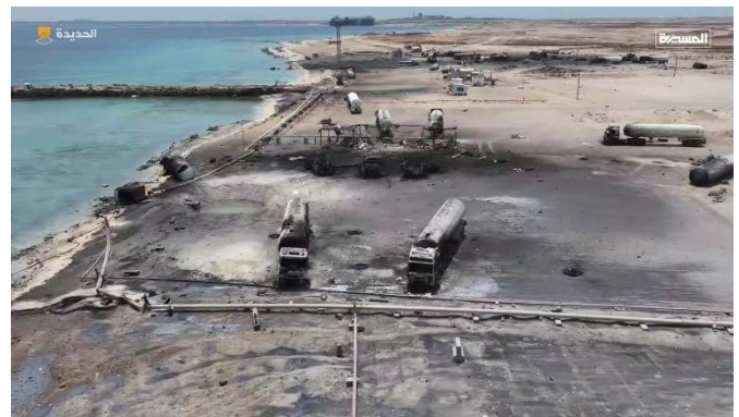
Left: Funeral ceremonies for those killed in the US attack on Ras Issa. Right: The damage in the energy terminal in Ras Issa