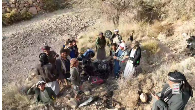
Houthi residents near the remains of an American drone (Houthi Combat Information Telegram channel, April 19, 2025)