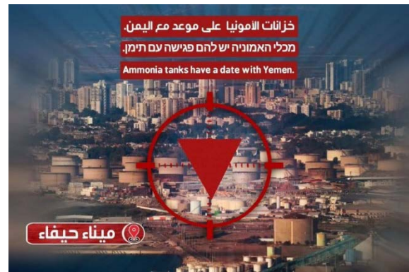
Right: Houthi threat to attack the port of Haifa and the ammonia tanks (Fouad al-Zubayri’s X account, May 6, 2025). Left: Poster with the inscription: “Yemen imposes a total air blockade on the Israeli enemy” (Al-Masirah Telegram channel, May 5, 2025).

► Iran and the “axis of resistance” organizations praised the Houthis for the attack on Ben Gurion Airport and condemned the Israeli retaliatory attacks in Yemen: