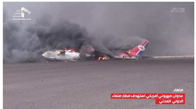
The damage caused by the Israeli airstrikes

► Senior Houthi officials condemned the Israeli attacks in Yemen. They made it clear that they will continue to act against Israel in "support" of the Palestinians and the Gaza Strip and threatened to attack strategic and civilian targets in various areas of Israel following the successful hit at Ben Gurion Airport. The following are notable statements: