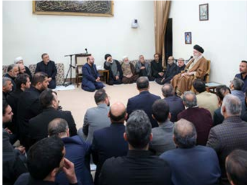
Iranian Supreme Leader Khamenei (April 24, 2025)

► Iranian Supreme Leader Ali Khamenei praised the “steadfastness” of the Palestinians in the Gaza Strip. At a religious event in Tehran, Khamenei said that anyone who stands firm follows in the footsteps of the Shiite imams, and that those who stand firm today in the Gaza Strip and Lebanon are following in the footsteps of those imams (Iranian Supreme Leader’s website, April 24, 2025).