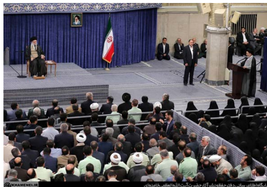
The Supreme Leader of Iran

► Iranian Supreme Leader Khamenei said at a meeting marking the beginning of the pilgrimage to Saudi Arabia (Hajj) that if the Islamic nation had been united, the current disasters in the Gaza Strip and “Palestine” would not have occurred, and Yemen would not have been subjected to such pressure. He noted that division within the Islamic nation is a prerequisite for imposing the interests and aspirations of the colonialists – the United States, the “Zionist regime,” and other countries – on the Muslim nations. Khamenei warned that in a situation of lack of unity, the fate of the Muslim countries could be the same as that of the countries that were under the pressure of colonialism, and their situation could become like that of the Gaza Strip.