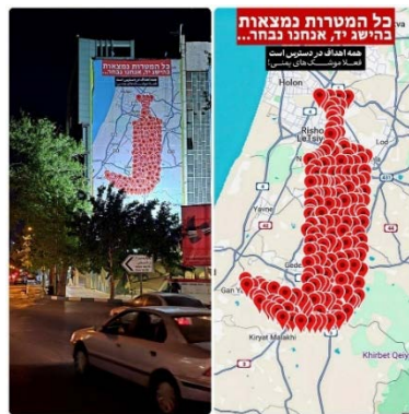
A Hebrew-language propaganda sign hung in Tehran’s Palestine Square after the missile launch from Yemen to Ben Gurion Airport (Mehr, May 4, 2025)

◆ The Iranian Foreign Ministry welcomed the launch of the missile at Ben Gurion Airport. It was stated that the Yemeni actions in “support” of the Palestinians are carried out based on an independent decision stemming from their sense of human and Islamic solidarity with the “Palestinian brothers,” and that attributing these acts to Iran is a distortion intended to cover up “the crimes of the Zionist regime in occupied Palestine” and to provide an excuse for undermining security in the region. The Iranian Foreign Ministry stressed that “the genocide in occupied Palestine” is the main cause of the continued insecurity in the entire region. It also said that the Iranian people are determined to defend themselves against any “hostile and illegal action” against Iran’s security and national interests and hold the US administration and the “Zionist terrorist regime” responsible for the consequences of any action against Iran (Iranian Foreign Ministry website, May 5, 2025).