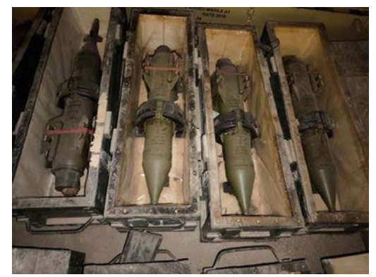
Weapons seized by Syrian security forces near the Syria-Iraq border (X account Qalaat al-Mashiq, May 20, 2025)