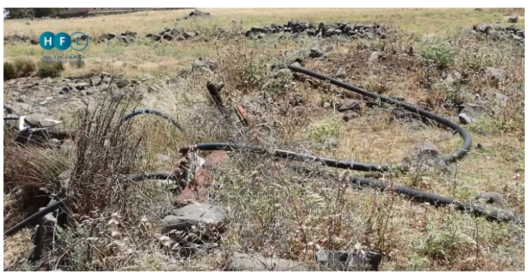
Alleged damage to water pipes near Tel al-Ahmar in Quneitra (Facebook page of the Horan Free Union, May 20, 2025)