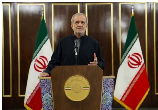
President of Iran (Tasnim, June 13, 2025)

◆ Iranian President Masoud Pezeshkian said Iran's "legitimate, powerful response" would make the "enemy" regret its "foolish act." He said "the barbaric act that violates all international commitments" proved the "criminal nature" of "the illegitimate Zionist regime," whose existence was based on "occupation, aggression and child murder." He said Iran would not stand idly by and would respond "forcefully, wisely and decisively" to defend its territorial integrity (Tasnim, June 13, 2025).