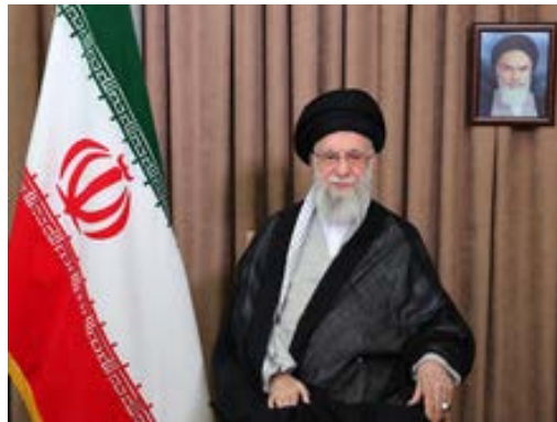
Iranian supreme leader Ali Khamenei (Khamenei's website, June 13, 2025)

a bitter, painful fate, which it would undoubtedly receive (Leader of Iran's website, June 13, 2025). Later, in a televised message shortly before the start of the Iranian "response," Khamenei declared that "the despicable Zionist regime" had made a "great mistake," the consequences of which would render it "miserable." He stated the Iranian nation would not forgive the blood of its fallen and Iran would not allow Israel to escape unharmed from "the great crime" it had committed. He added that the Iranian armed forces would deliver heavy blows to Israel and that the Islamic Republic would prevail over it (Leader of Iran website, June 13, 2025).