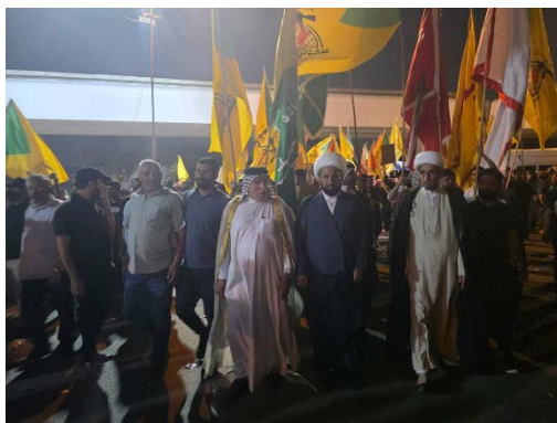
Supporters of pro-Iranian militias call for the removal of American forces at a demonstration near the American Embassy in Baghdad

stated that the "crimes and violations will not pass without severe and decisive punishment." The militia also called on Iraqi Prime Minister Mohammad Shia al-Sudani "not to yield to American pressure" and urged the government to take all measures to prevent "the enemy" from penetrating Iraqi airspace (Shafaq News Agency, June 13, 2025).