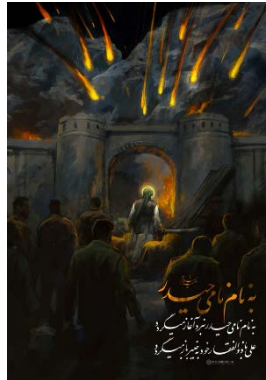
Khamenei's poster of the Battle of Khaybar