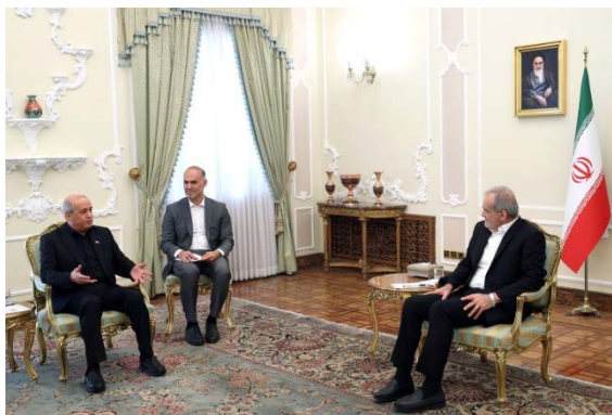
The Iranian president meets with the PFLP deputy secretary-general (Iranian president’s website, June 11, 2025)

that support for the oppressed around the world, especially the Palestinian people, constitutes a principled and unchanging policy stemming from the pure principles of the Islamic Revolution. He noted that the main reason for the continuation of the “crimes of the Zionist regime” is the lack of unity and coordination among the Islamic countries and that the enemies of Islam use various means to create conflict between the Muslim countries and provide Israel with a safe space to continue its “crimes” in the Gaza Strip, Lebanon, and other Islamic territories. He stressed Iran’s determination to create unity among the Islamic countries in support of the Palestinian people and to use all the diplomatic and political tools at its disposal to stop the “crimes of the Zionists” in the Gaza Strip (Iranian president’s website, June 11, 2025).