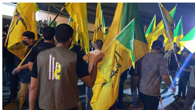
Militia supporters demonstrate in Baghdad in favor of Iran and against Israel and the United States

► According to an “American military source” and an “official source,” on the night of June 14-15, 2025, three drones launched at the American base in Ain al-Assad in western Iraq were shot down (Associated Press, June 15, 2025). However, a “senior Iraqi security source” estimated that the drones were not aimed at the Ain al-Assad base but rather were on their way to targets deep inside Israel and crashed due to a loss of range or a technical malfunction as a result of the long distance. He added that the security forces are monitoring the drone flights and are handling any developments on the ground (Shafaq News, June 15, 2025). “Sources” later confirmed that the American forces in Iraq shot down a drone launched at the Ain al-Assad base (Al-Arabiya, June 16, 2025). In addition, in the early morning of June 16, 2025, “security sources” reported that the defense systems at the American consulate in Erbil, in the autonomous Kurdish region of northern Iraq, had intercepted a drone that approached the area (Baghdad Today, June 16, 2025).