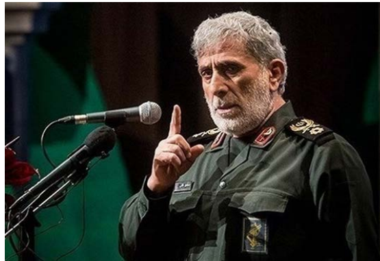
The Qods Force commander