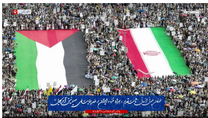
Iranian and Palestinian flags at a mass support demonstration in Sana'a (Al-Masirah, June 20, 2025)

► Following the entry into force of the ceasefire between Iran and Israel, the Houthis were quick to congratulate Tehran and stressed that they are committed to continuing their activity against Israel “in support” of the Gaza Strip and the Palestinians. The following are prominent reactions: