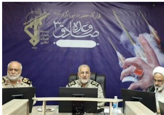
The IRGC commander

◆ IRGC commander Mohammad Pakpour said at the ceremony of the appointment of the commander of the Ground Forces and head of the IRGC's Intelligence Organization that the organization would continue forcefully in the path of the senior commanders who were killed in the Israeli attack. He noted that the objective is to advance the operational activity and the goals that the Revolutionary Guards aspire to achieve, and that this would be possible with the assistance of all forces (Tasnim, June 19, 2025). In a video from his command room, Pakpour declared that unity among the people is growing stronger as time passes, and that the activities of the Revolutionary Guards' air and space arm do not stop and deprive the Zionists of any sense of security.