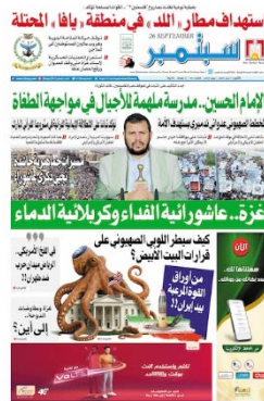
The cover of the newspaper September 26 , affiliated with the Houthis, featuring an octopus wearing a kippah on top of the White House, under the headline “How did the Zionist lobby seize control of White House decision-making?” ( September 26 , July 7, 2025)