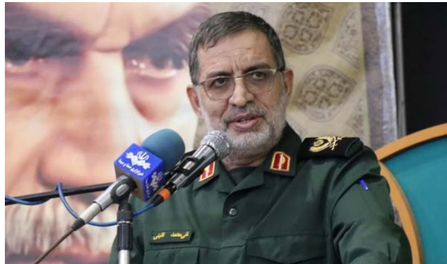
The IRGC spokesman (ISNA, July 4, 2025)

Islamic Republic regime but failed to achieve any of its objectives in the war. He noted that the “enemy” had clearly stated that the goal of the war was to subdue Iran and dismantle it. After failing to achieve its goals through negotiations, it resorted to military action without a proper understanding of the Islamic Republic. Naeini added that during the war, Iran had fired more than 2,000 missiles and drones at Israel, many of which hit their targets, and that Iran’s enemies are undoubtedly the ones who fear its destructive response in the event of another attack (ISNA, July 4, 2025).