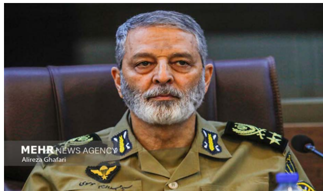
Iranian Chief of Staff Mousavi

◆ Iranian Chief of Staff Abdolrahim Mousavi said on the sidelines of the commemoration ceremony for those killed in the war with Israel that Iran's response to any act of aggression by its "enemies" would be more painful than ever. He noted that the "enemies" must know that any illegal and threatening action will be met with a firm and serious response. Referring to Israel's elimination of Iranian senior commanders and nuclear scientists during the war, Mousavi said that the "enemy" mistakenly estimated that these assassinations could destroy the "nerve center" of the armed forces, but the Iranian forces under the Supreme Leader's command would never collapse.