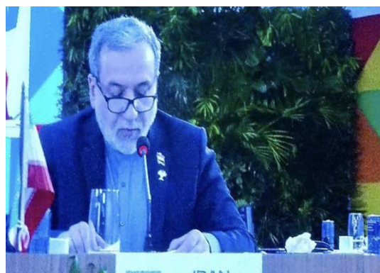
Abbas Araghchi (Fars, July 6, 2025)

♦ In his speech at the BRICS summit in Brazil, Iranian Foreign Minister Abbas Araghchi condemned Israel's attacks on Iran and the US support for the attack. He noted that the attack was a clear violation of the UN Charter and the Nuclear Non-Proliferation Treaty (NPT). He stressed that Iran will continue to defend itself with all its might against any future aggression, saying that the insecurity in the region will not be resolved as long as the "Israeli regime" continues to enjoy the support and encouragement of its allies. Araghchi expressed regret that in the past two years, the international community has failed to stop the "genocide of the Palestinians" and to end the "occupation" of Arab lands by Israel. He called on UN member states to condemn the Israeli attack, saying that any attempt to justify this war constitutes complicity in the crime and that the international community must prosecute those responsible for "crimes and violations of international law" by Israel (Fars, July 6, 2025).