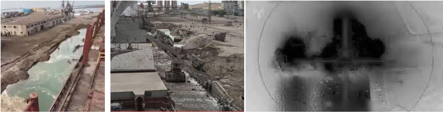
Right: The attack against the Galaxy Leader. In the center and left: The damage caused by the Israeli attack on the port of Hodeidah