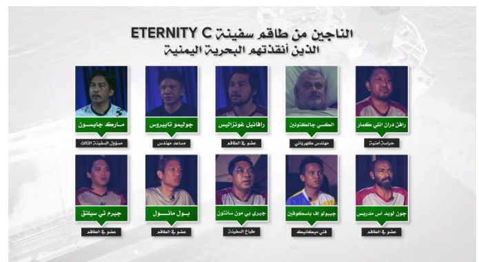
Right: Crew members held by the Houthis. Left: Crew members watching images from Gaza (Houthi Combat Information Telegram channel, July 28, 2025)