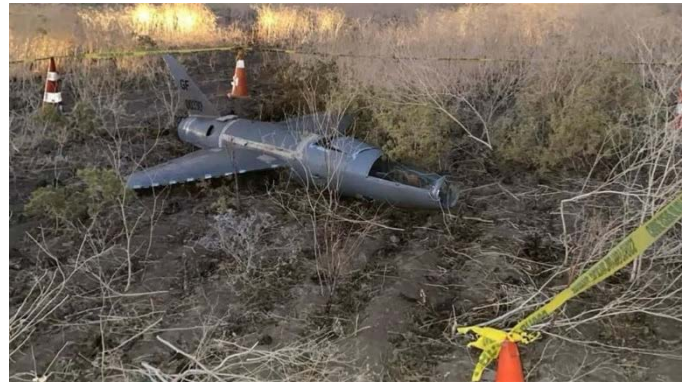
The drones that crashed in northern Iraq ( Shafaq News and Al-Sumaria , July 28, 2025)