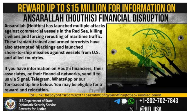
Advertisement offering a reward for information on Houthi financing (US Department of State Grant Program X account, July 23, 2025)