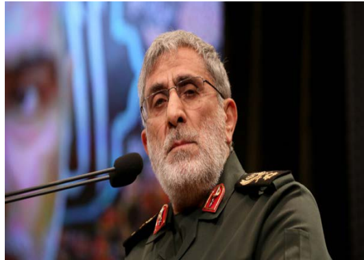
The Qods Force commander ( Shafaq News , July 28, 2025)