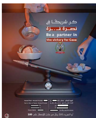
Announcement for fundraising (Yemeni armed forces “Sana’a” Telegram channel, July 23, 2025)