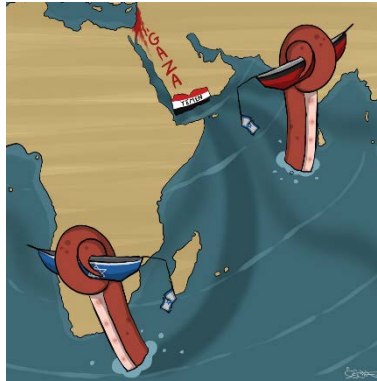
Iranian cartoon following the Houthis’ announcement of the “fourth stage” (Iran’s X account in Arabic, July 28, 2025)

that all shipping companies cease their cooperation with “Israeli enemy ports” starting with the publication of the announcement; otherwise, their ships would be attacked. In addition, he appealed to all countries and said, “If you want to avoid this escalation, exert pressure on the enemy to stop its aggression and lift the siege on the Gaza Strip. Our activities will stop immediately only after the aggression stops and the siege on the Gaza Strip is lifted” (Yahya Saria’s Telegram channel, July 27, 2025).