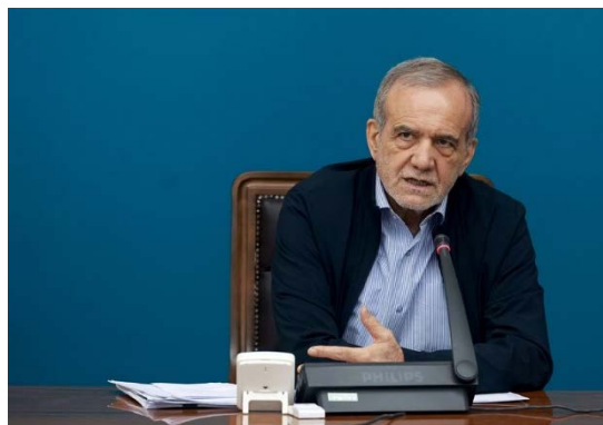
The Iranian president