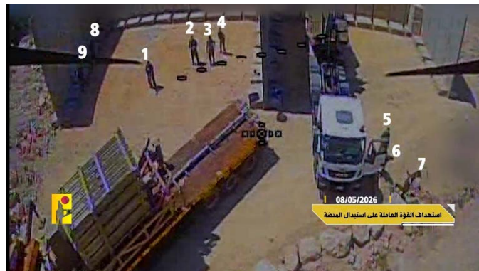
Attack on an Iron Dome battery using an explosive drone

a helicopter landing site and an Iron Dome battery. Hezbollah claimed that at least 18 attacks were in response to the strike in the Dahiye al-Janoubia (Hezbollah combat information Telegram channel, May 4–11, 2026).