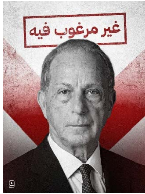
The American ambassador. The Arabic reads, "persona non grata"