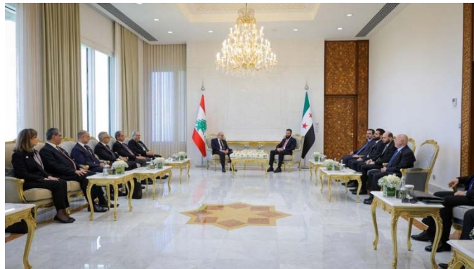
Meeting of Salam and al-Sharaa

► Lebanon's Prime Minister Salam visited Syria and met with President Ahmad al-Sharaa. Sources said they discussed the negotiations with Israel, and Salam said the Lebanese objective was to achieve a ceasefire, Israeli withdrawal and the formulation of security arrangements. He said Lebanon was committed to the Arab Peace Initiative of 2002 (al-Jadeed, May 9, 2026), and said they had agreed on the need to tighten supervision of the border in order to prevent smuggling "of any kind" ( al-Sharq al-Awsat , May 9, 2026).