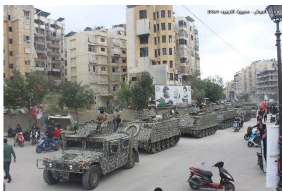
Lebanese army forces in the Dahiyeh al-Janoubia ( L'Orient-Le Jour , May 6, 2026)

► It was the first time the army had operated in the Dahiyeh al-Janoubia to implement state sovereignty. However, the "cautious nature" of the activity was criticized, as the army chose to deal with an issue "which was not expected to provoke Hezbollah," while avoiding direct contact with the organization's weapons infrastructure. Reportedly Hezbollah allowed the army to operate because the arrests related to public disturbances which angered its own environment ( L'Orient-Le Jour , May 6, 2026).