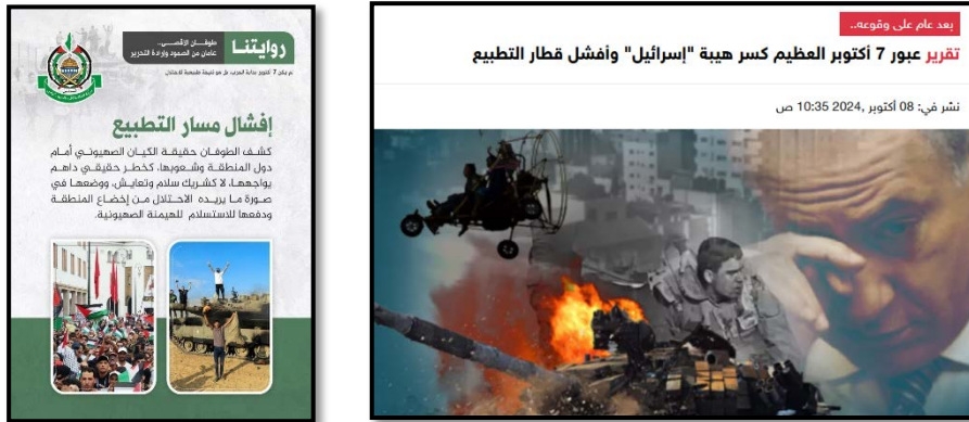
Right: "A year after it occurred... Report: The great October 7 breakthrough shattered Israel's image and derailed the normalization train" (Shehab, October 8, 2024). Left: "Derailed the Normalization Track" from the document "Our Narrative" marking two years since operation al-Aqsa Flood ( al-Risalah , December 27, 2025)

as one that reveals what the occupation seeks: subjugating the region and driving it to submit to Zionist hegemony" ( al-Risalah , December 27, 2025).