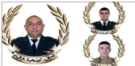
The strike in the al-Khardali-Nabatieh area

► The Lebanese army reported that one of its soldiers had been killed in an Israeli strike while on the road between Nabatieh and Kafr Tebnit in south Lebanon. In another incident, the Lebanese army stated that two officers, one of them a brigadier general, and a soldier were killed in an Israeli strike in the al-Khardali-Nabatieh area. Lebanese President Joseph Aoun condemned the attack, calling it a violation of Lebanese sovereignty and international law. He claimed it was part of the "continuing Israeli escalation" in south Lebanon despite the diplomatic efforts being conducted by Beirut with the United States to end the clashes (IDF spokesperson, June 6, 2026), June 6, 2026). The IDF said a suspicious vehicle had been identified near the village of Kafr Tebnit at a time when there was an alert regarding possible fire at IDF forces in the area. The vehicle was struck and it later became clear that its passengers were two Lebanese Army officers and attacked soldier. The IDF said the incident was under investigation and that lessons would be learned, noting that IDF forces operated against Hezbollah and not against the Lebanese army.