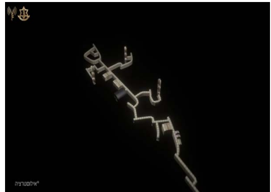
Right: Sketch of the Hezbollah tunnel network beneath the Beaufort Ridge. Left: Hezbollah operatives inside the complex