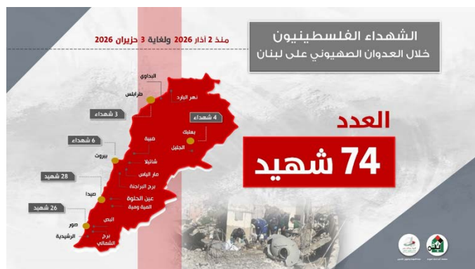
Palestinian deaths in the hostilities according to geographic distribution (Palestinian Refugees Portal, June 3, 2026)

► The Thabet Organization for the Right of Return and the Committee for Return and Refugee Affairs reported that between March 2 and June 3, 2026, 74 Palestinians were killed in Lebanon by Israeli strikes. Most of the deaths were in the Sidon area and its nearby refugee camps (28), followed by the Tyre area and its camps (26). Other deaths were in the Beirut area and surrounding refugee camps, the Beqa'a Balley and the Tripoli area and refugee camps in northern Lebanon (Palestinian Refugees Portal, June 3, 2026).