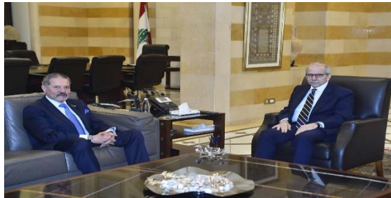
Salam and Abbas (Shafa News Agency, June 5, 2026)