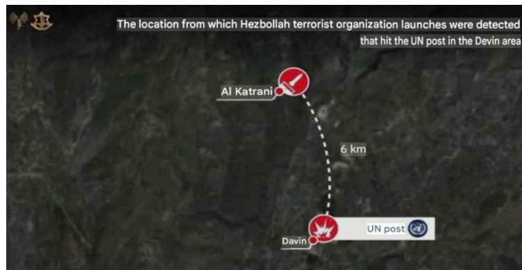
Illustration of the Hezbollah mortar shell fire that struck the UNIFIL position (IDF spokesperson, June 5, 2026)

► UNIFIL reported that one member of the international force had been killed and two others wounded by mortar shells which fell on a position near Marjayoun in south Lebanon. UNIFIL noted that attacks on peacekeeping forces violated international law and UN Security Council Resolution 1701 and could be considered war crimes ( al-Diyar , June 4, 2026). The IDF said Hezbollah had fired several mortar shells from the al-Qatrani area in south Lebanon which fell inside a UNIFIL position in the Debbine area, killing a UN staff member and wounding two others (IDF spokesperson, June 5, 2026). Hezbollah rejected the IDF statement and claimed that they were fabricated accusations intended to divert attention from Israeli activity in south Lebanon. Hezbollah said it remained committed to the continued operation of UNIFIL forces within the mandate granted to them under UN resolutions ( al-Manar , June 4, 2026).