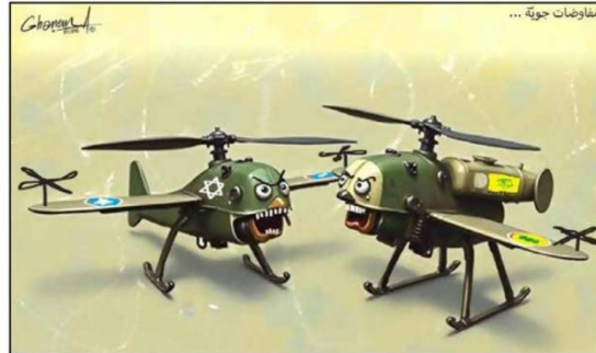
The aerial negotiations between Israel and Hezbollah ( al-Joumhouria , June 6, 2026)

freedom of action and operational initiative of Israeli forces. Killing an Israeli armored corps officer and the attempt to target the commander of the Northern Command were represented as examples of the systematic targeting of the command echelons ( al-Akhbar , June 2-5, 2026).